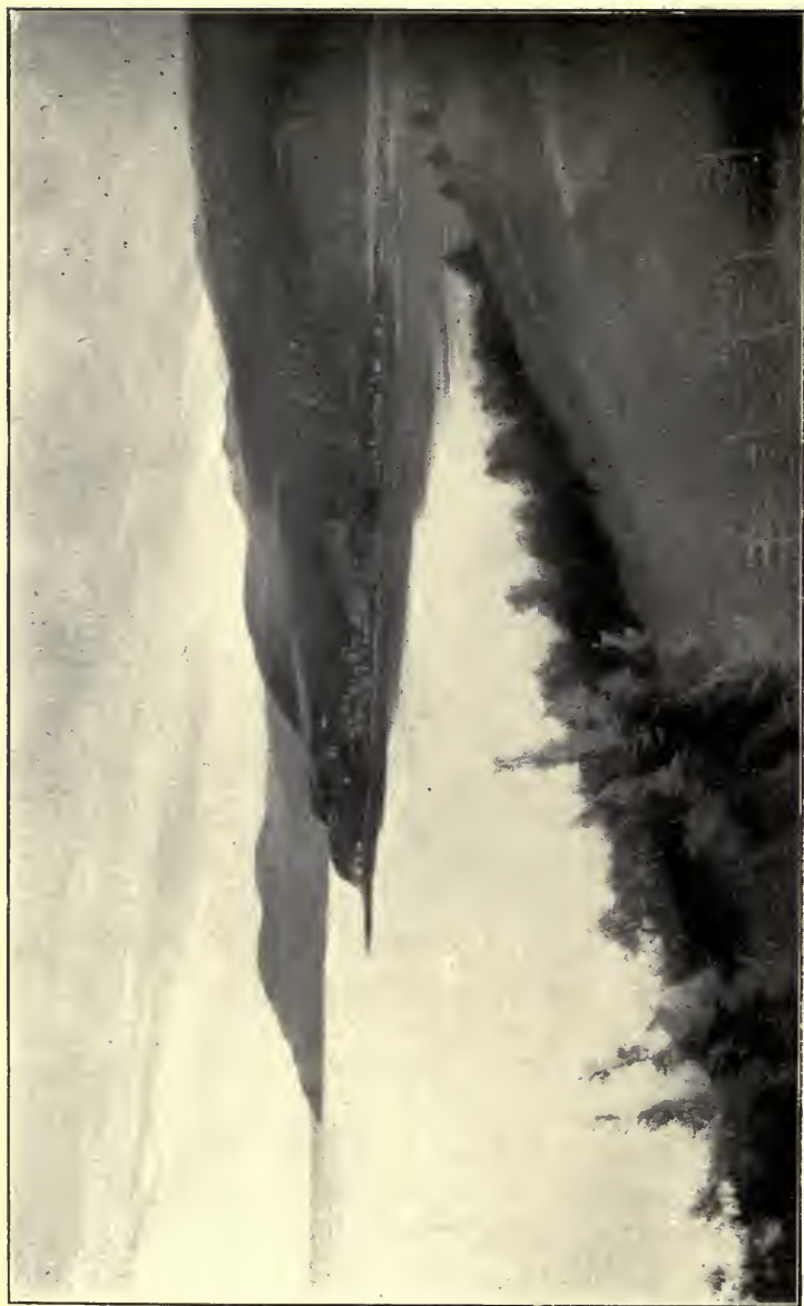
VIEW ACROSS MURRAY BAY FROM THE CAP À L'AIGLE SHORE (The farther point is Cap aux Oies, the nearer Pointe au Pic)