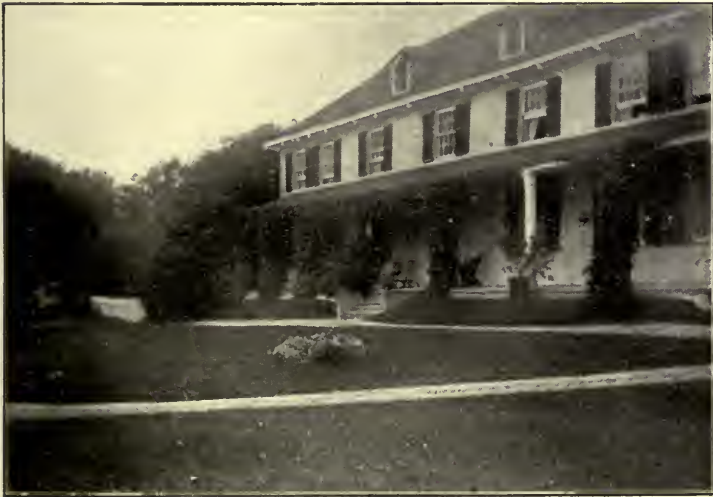
THE MANOR HOUSE AT MURRAY BAY (The upper view from the West, the lower from the East)