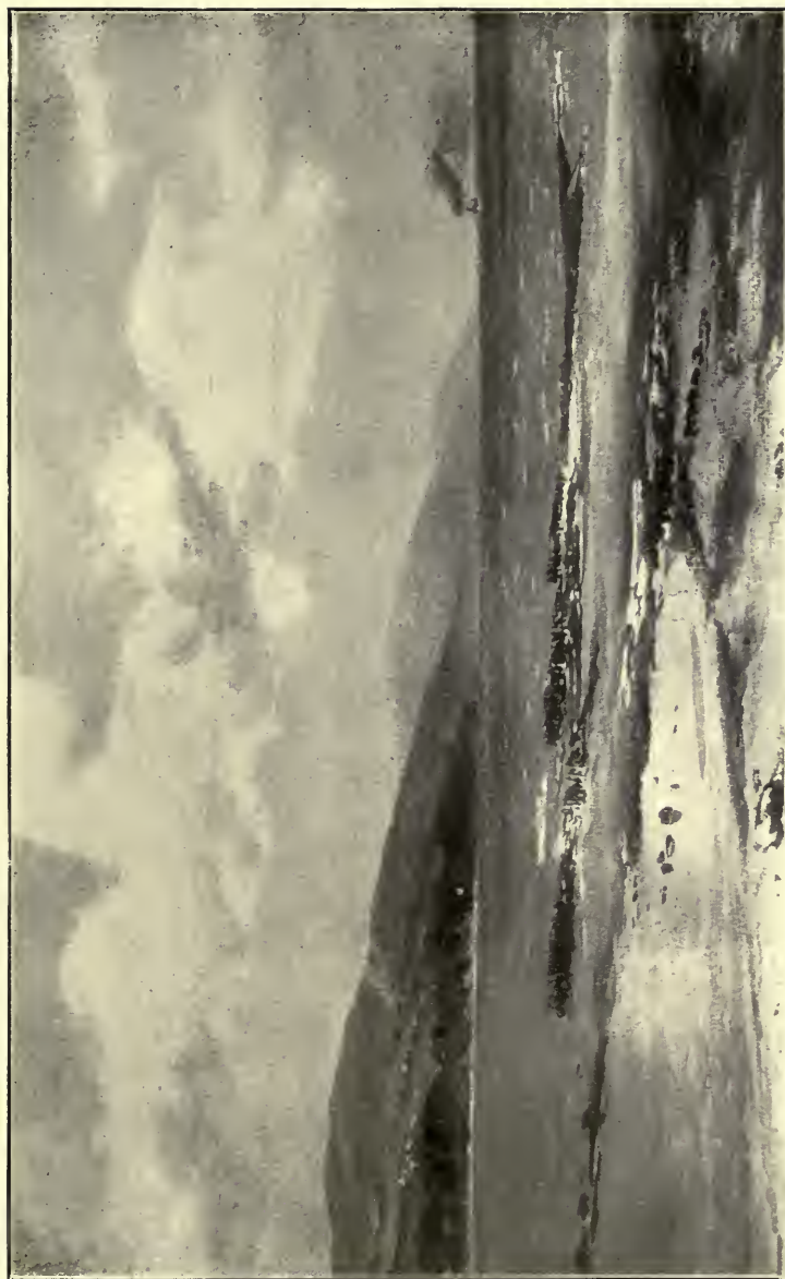
CAP À L'ANGLE FROM THE WEST SHORE OF MURRAY BAY (“A great headland sloping down to the river in bold curves.”)