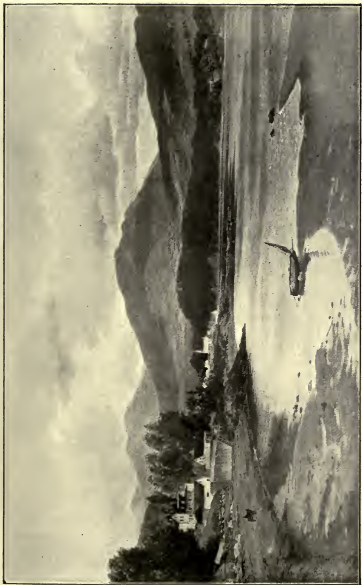
VIEW FROM POINTE AU PIC UP MURRAY BAY