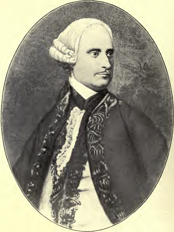
GENERAL JAMES MURRAY