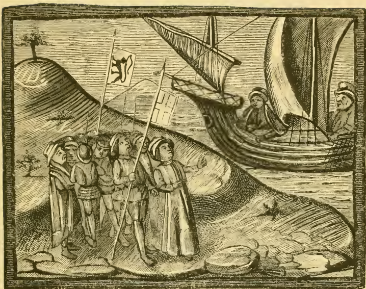
HOW THE MARINERS REFUSED GADIFER ADMISSION ON BOARD OF HIS OWN SHIP.