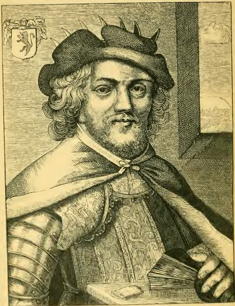
PORTRAIT OF MESSIRE JEAN DE BETHENCOURT, KING OF THE CANARIES.