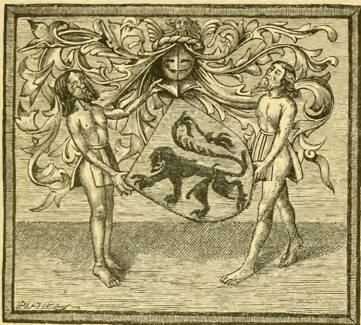
ARMS OF MONSEIGNEUR LE BARON DE BETHENCOURT, OF GRAINVILLE LA TEINTURIÈRE EN CAUX.