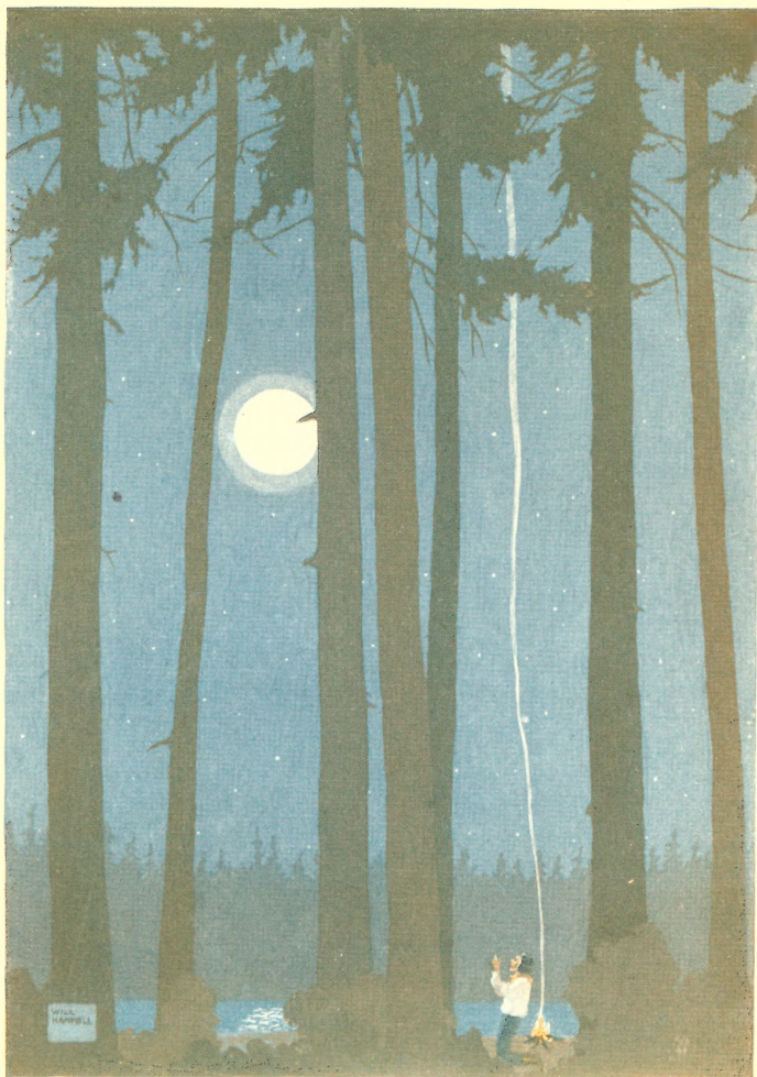
The Indian Guide's Evening Prayer (page 59)