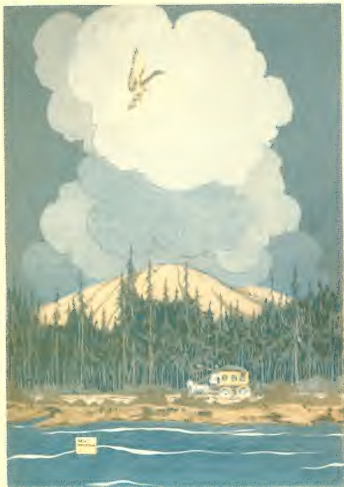
The Stage on the Road to Moosehead Lake