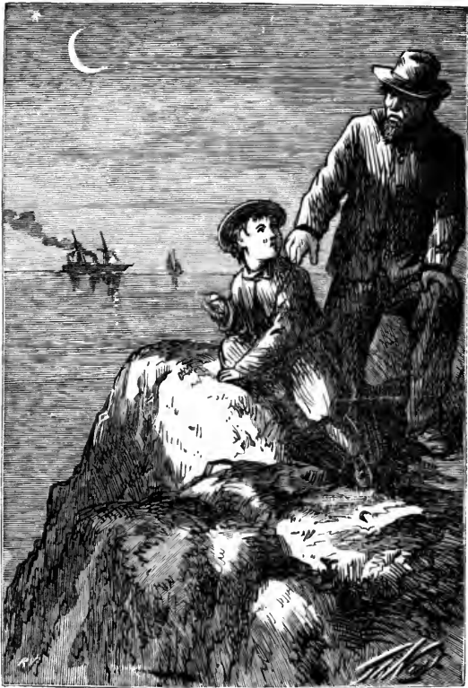
CAPTAIN HORACE LOST. Page 42.