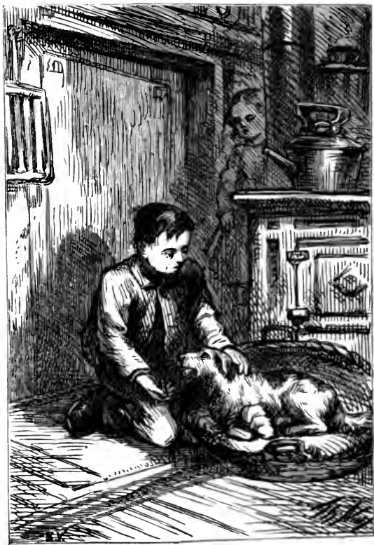
CAPTAIN HORACE AND HIS DOG. Page 138.