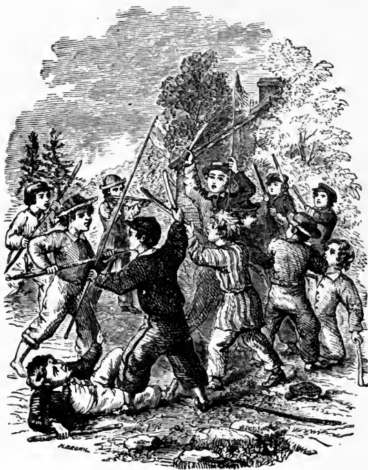
STAND BY THE FLAG. — Page 85.