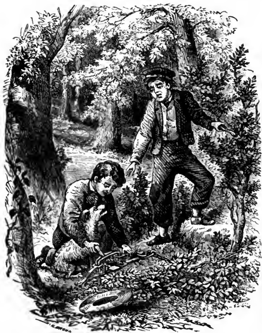
IN THE WOODS. — Page 111.