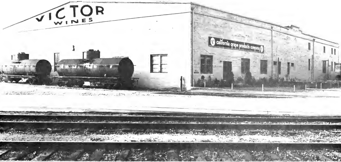
San Francisco General Office and Warehouse