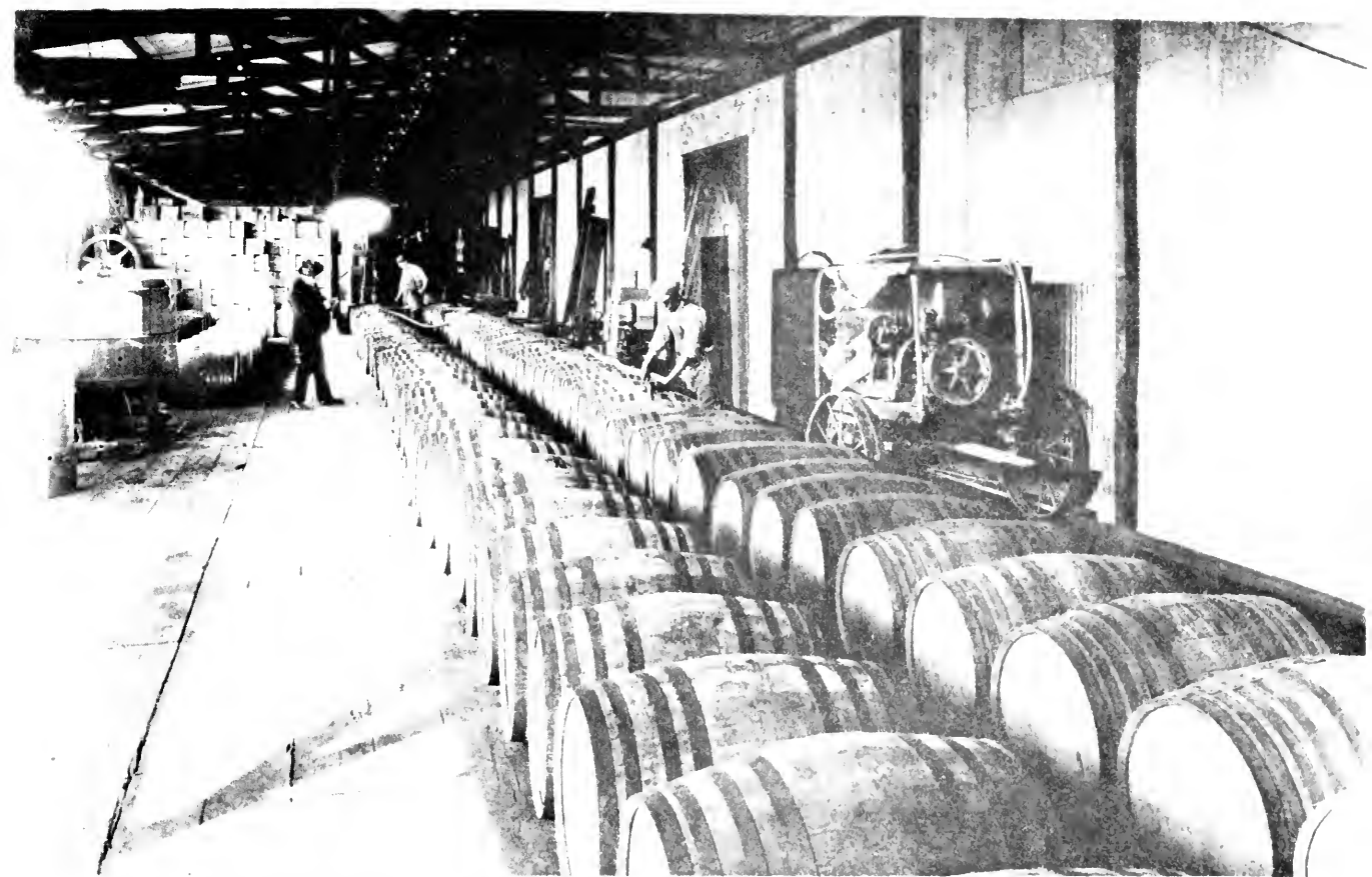
Shipping Activities At Ukiah, Calif.