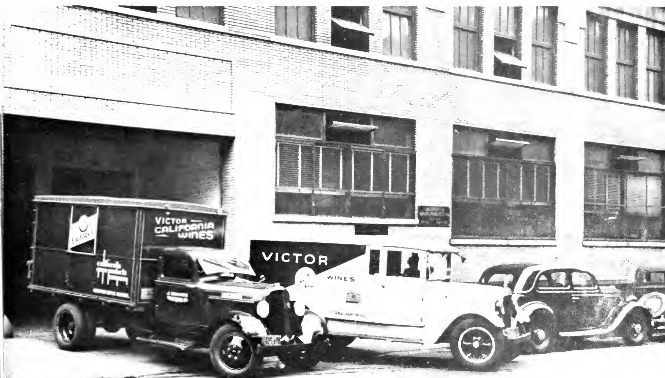
New York Office and Storage Warehouse