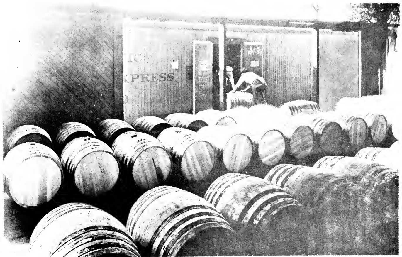
Shipping Activities At Elk Grove, Calif.