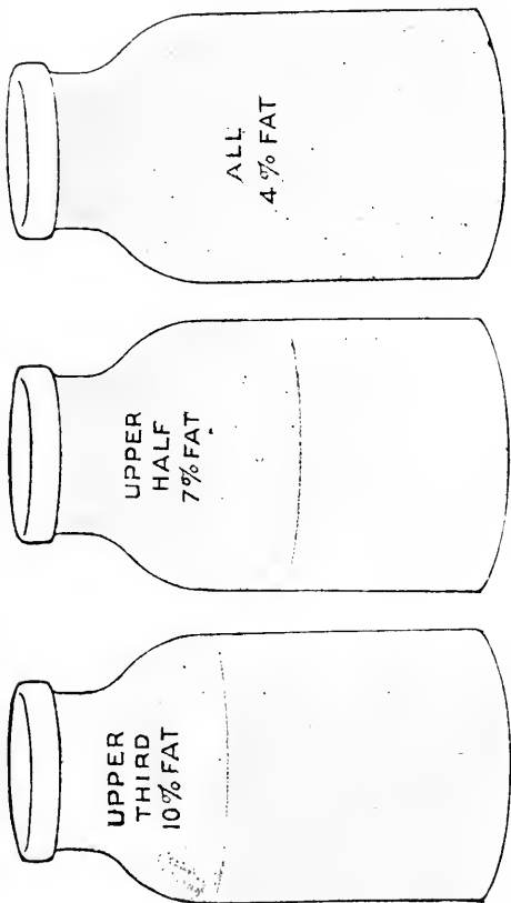
The percentage of fat in the different layers of milk of good average quality.