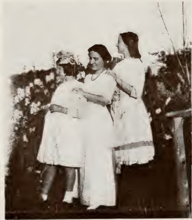
AT THE GARDEN GATE.