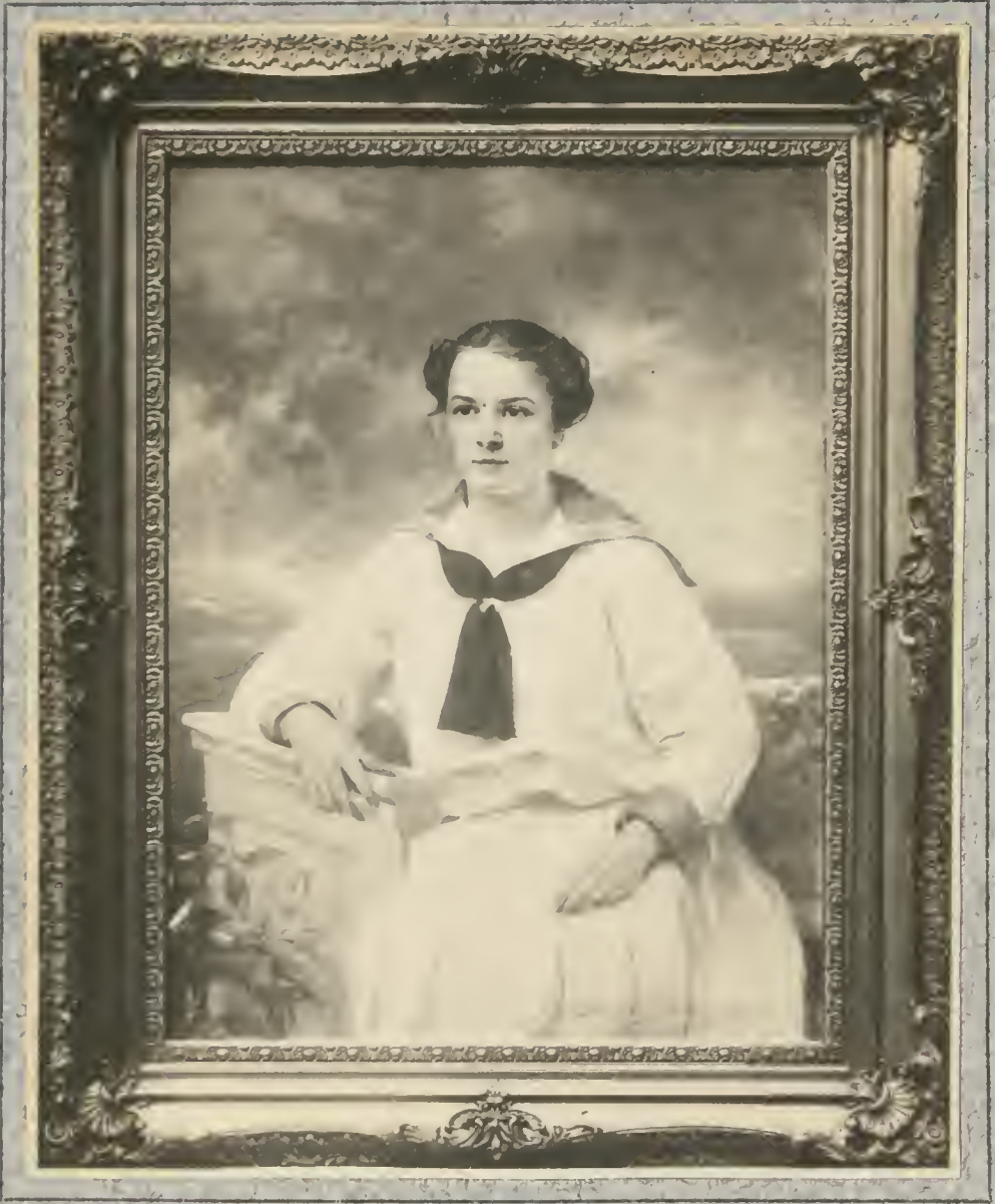
FROM THE OIL PAINTING BY STANLEY TODD, 1910