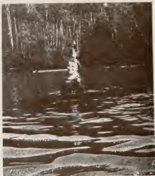
IN THE LAKE.