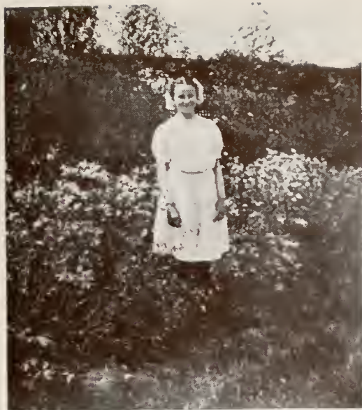
IN THE GARDEN.