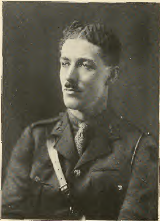
LIEUTENANT CONINGSBY DAWSON CANADIAN FIELD ARTILLERY