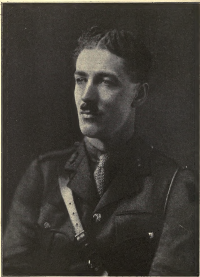
LIEUTENANT CONINGSBY DAWSON CANADIAN FIELD ARTILLERY