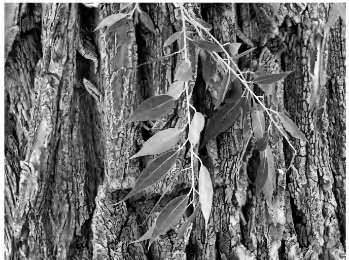
Salix amygdaloides , Goshen Co.