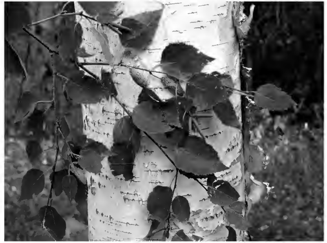
Betula papyrifera , Crook Co.

Pinus flexilis , Limber Pine, is a slow growing, long-lived, evergreen tree that can reach 80 feet tall and 30 feet wide but is usually much smaller. The leaves are needle-like in clusters of 5 and to 2.5 inches long. The female cones are very resinous and to 8 inches long. The plants occur naturally on dryish, often wind swept and rocky ridges and slopes from rocky outcrops on the plains to subalpine areas in the mountains. They prefer moist to dry, open areas and are tolerant of drought, wind, cold, and heat. They are a good candidate for bonsai culture. It can be grown from seed which is best cold stratified for 21 to 90 days before planting. Barely cover with soil. Small trees can be transplanted. The foothills ecotype will do best at our lower elevations. There are many cultivars in the nursery trade.