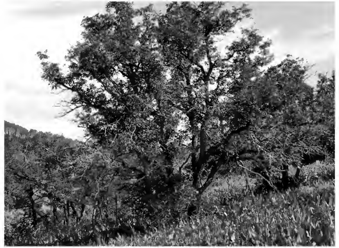
Quercus gambelii , Carbon Co.

usually much smaller. The leaves are linear, flattened, blunt at the tip, to 1.5 inches long, and borne singly along the branches similar to a fir tree. The female cones are to 3 inches long with 3-lobed bracts protruding from the cone scales. They occur naturally on dry, often rocky slopes and ridges in the mountains. They prefer a well-drained site in full sun or part shade. They are drought and wind tolerant but are best grown on a north-facing exposure. At lower elevations they may be subject to winter sun burn and pests like gall aphids, tussock moths, and needle scale. It is an alternate host for spruce gall aphid so spruce and Douglasfir should not be planted in close proximity. It can be grown from fresh seed barely covered with soil. For spring sowing, cold stratify the seed for at least 60 days. There are many cultivars in the nursery trade.