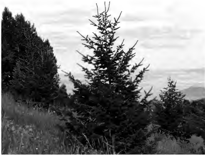
Pseudotsuga menziesii , Meagher Co., MT

Quercus gambelii , Gambel Oak, is a slow growing deciduous tree (may be shrub-like) to 20 feet tall and as wide. It tends to sucker and form thickets. The leaves are lobed like typical oak leaves and to 6 inches long. They turn yellow, orange, or red in the fall. The flowers are inconspicuous appearing in March and April. The fruit is an acorn about 0.5 inch across. The plants occur naturally in Wyoming mostly on the west slope of the Sierra Madre Mountains in Carbon County. They prefer moist to dry, open or partly shaded areas. They are tolerant of wind and some drought. It can be grown from the acorn planted half an inch deep outside in the fall. It is difficult to transplant. It is also in the nursery trade.