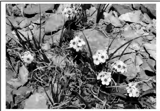
Left: Androsace chamaejasme (Sweet-flowered rock jasmine) contributed to the kaleidoscope of color on top with Aquilegia jonesii .