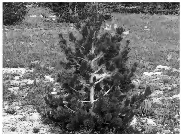
Pinus flexilis , Albany Co.

Pseudotsuga menziesii , Douglasfir, is a fast growing, evergreen tree, cone-shaped when young but becoming more irregular and open with age. They can reach 70 feet or more high and 30 feet wide but are