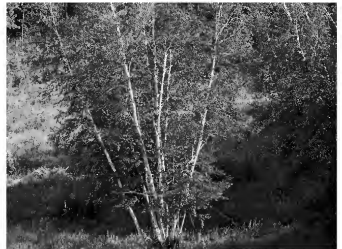
Betula papyrifera , Custer Co., SD