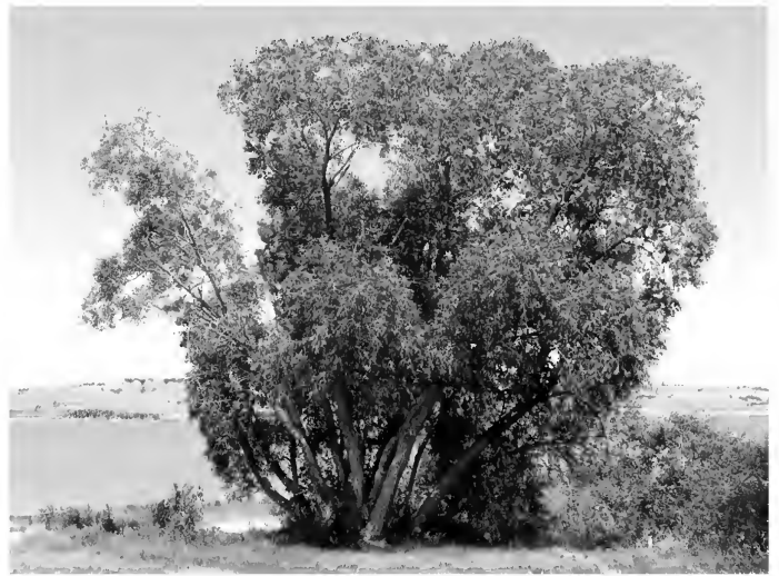
Salix amygdaloides , Platte Co.

Quercus gambelii , Gambel Oak, is a slow growing deciduous tree (may be shrub-like) to 20 feet tall and as wide. It tends to sucker and form thickets. The leaves are lobed like typical oak leaves and to 6 inches long. They turn yellow, orange, or red in the fall. The flowers are inconspicuous appearing in March and April. The fruit is an acorn about 0.5 inch across. The plants occur naturally in Wyoming mostly on the west slope of the Sierra Madre Mountains in Carbon County. They prefer moist to dry, open or partly shaded areas. They are tolerant of wind and some drought. It can be grown from the acorn planted half an inch deep outside in the fall. It is difficult to transplant. It is also in the nursery trade.