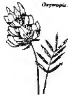
Oxytropis name Nutt., a Wyoming endemic collected by Thomas Nuttall on his journey across Wyoming in 1814