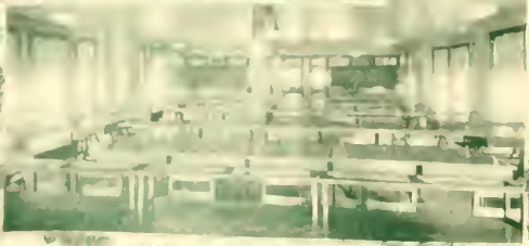
DEPARTMENT OF HALLS