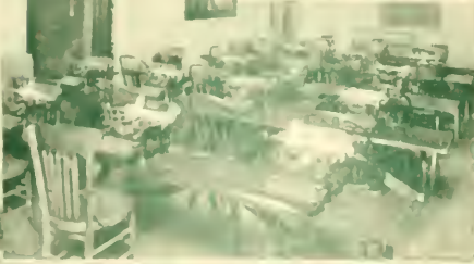
ALMA MATER DINING HALL