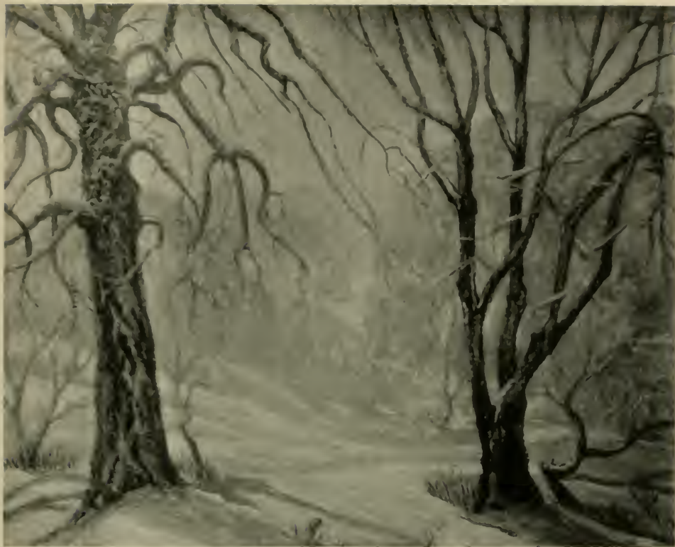
WINTER MOOD AT EDGEBROOK, ILLINOIS