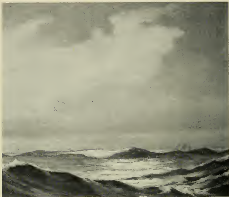
NEAR THE COAST OF SWEDEN