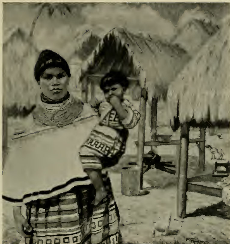
"CORN BILLY'S SQUAW"