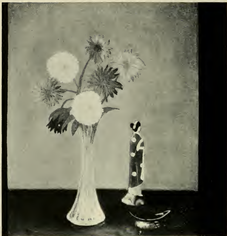
THE JAPANESE LADY