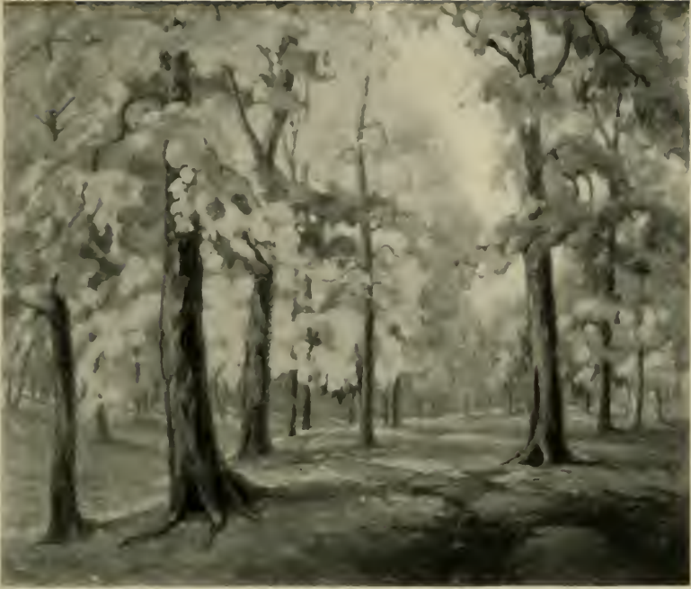
COOK COUNTY, ILLINOIS