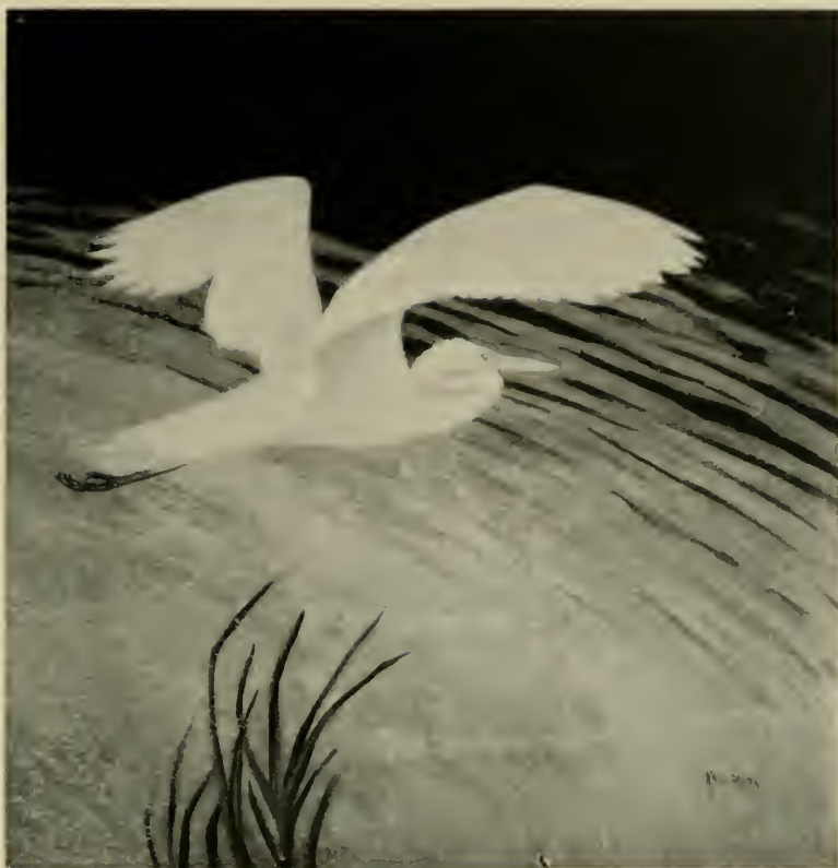
A WHITE BIRD FLYING