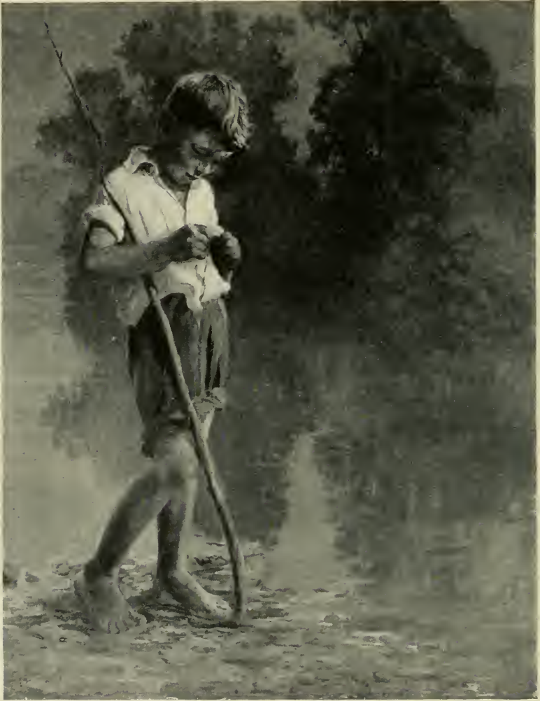
BAITING THE HOOK