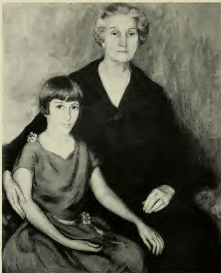
"MY MOTHER AND DAUGHTER"