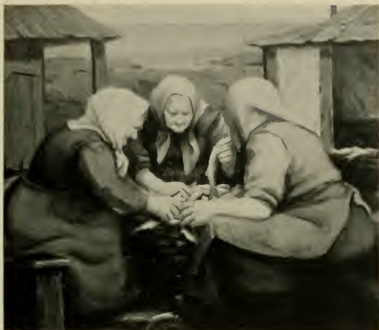
"PREPARING THE HERRING"