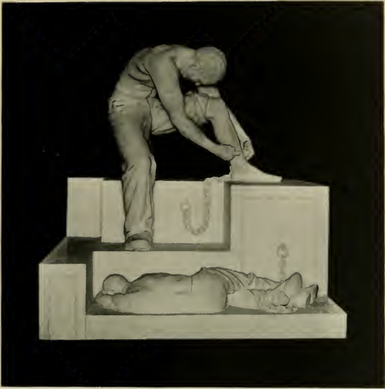
THE DREAM OF FREEDOM