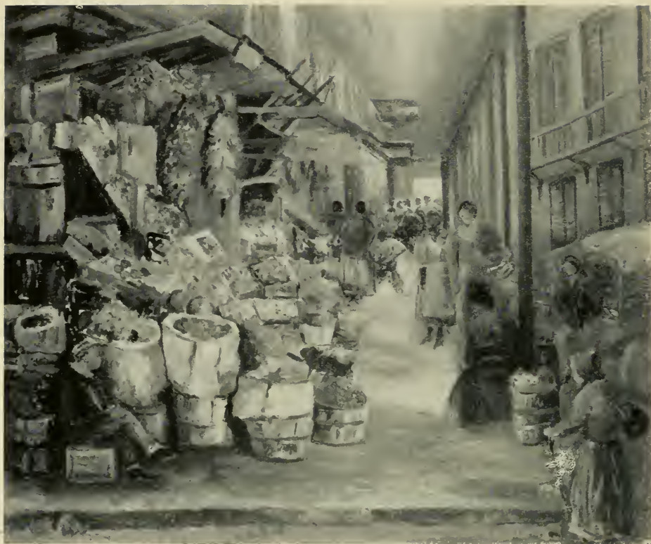
NEW ORLEANS MARKET