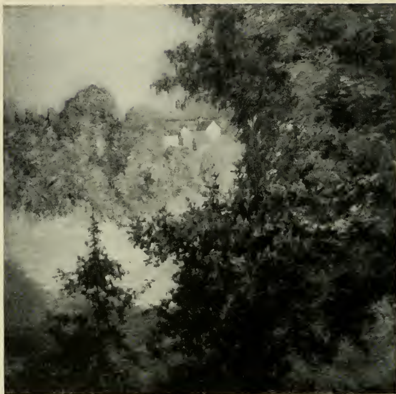
ACROSS THE VALLEY