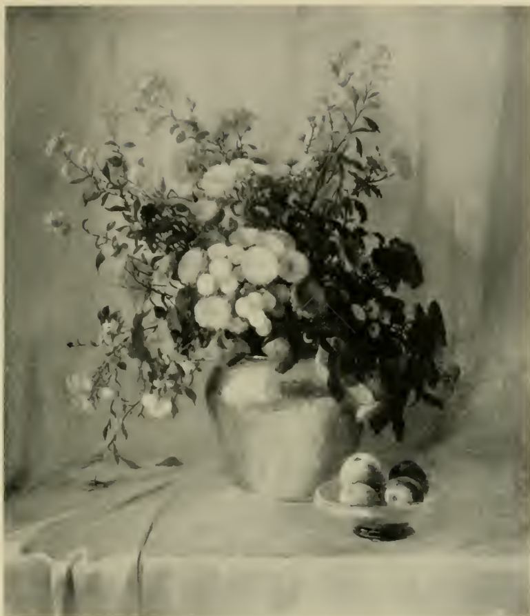
FROM AUTUMN GARDEN