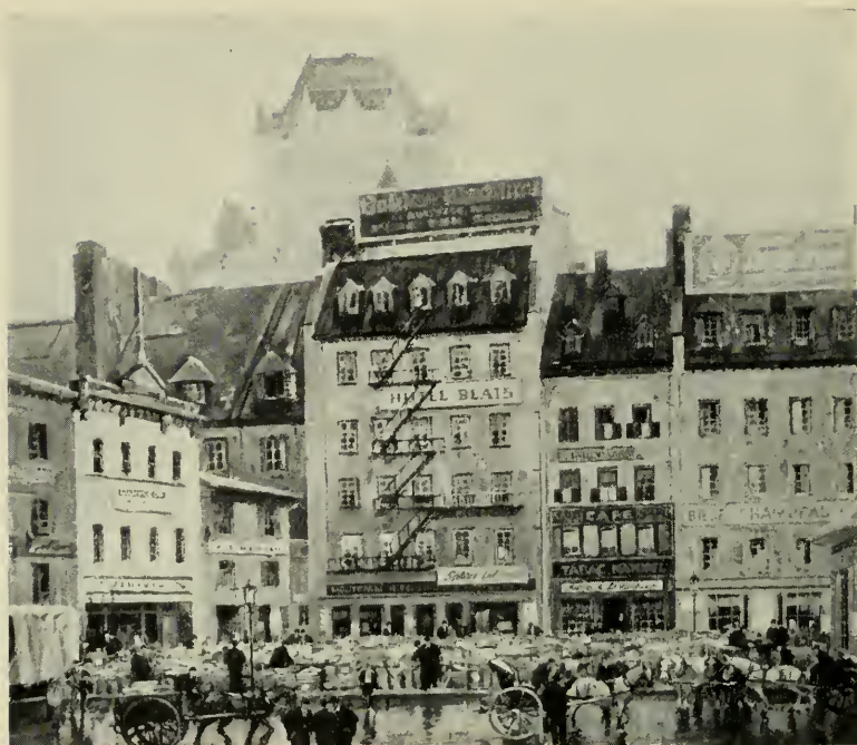
LOWER TOWN QUEBEC