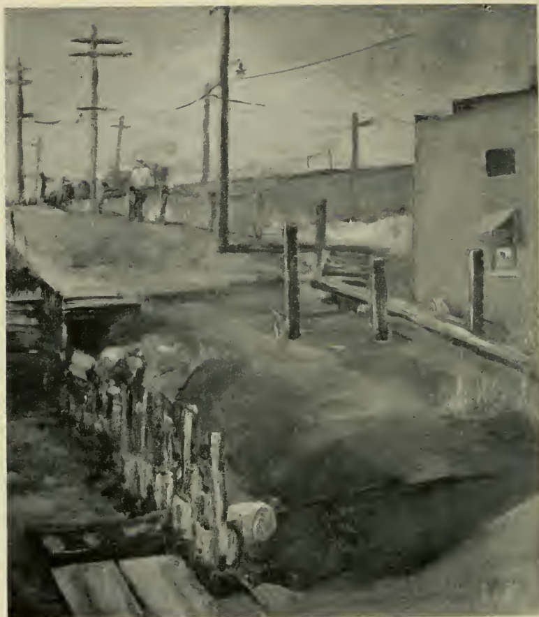
SCENE FROM RANDOLPH STREET