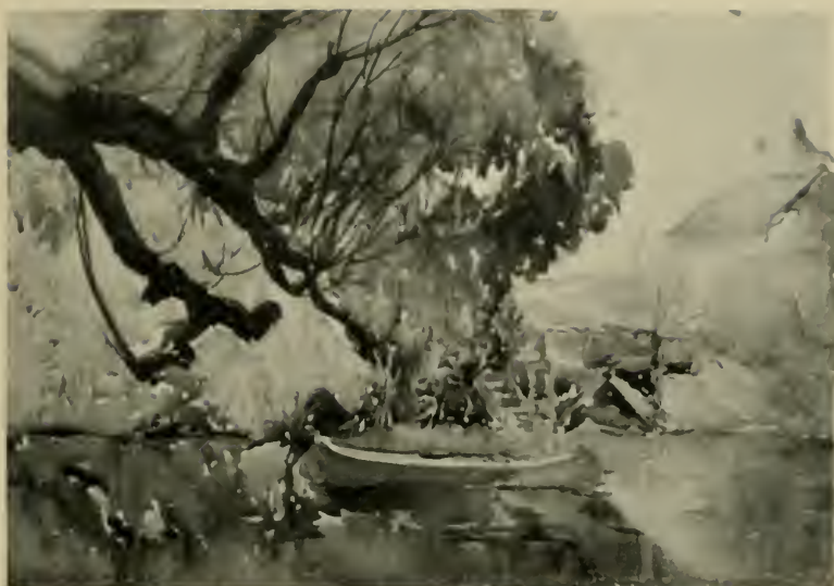
OLD WILLOW (Watercolor)