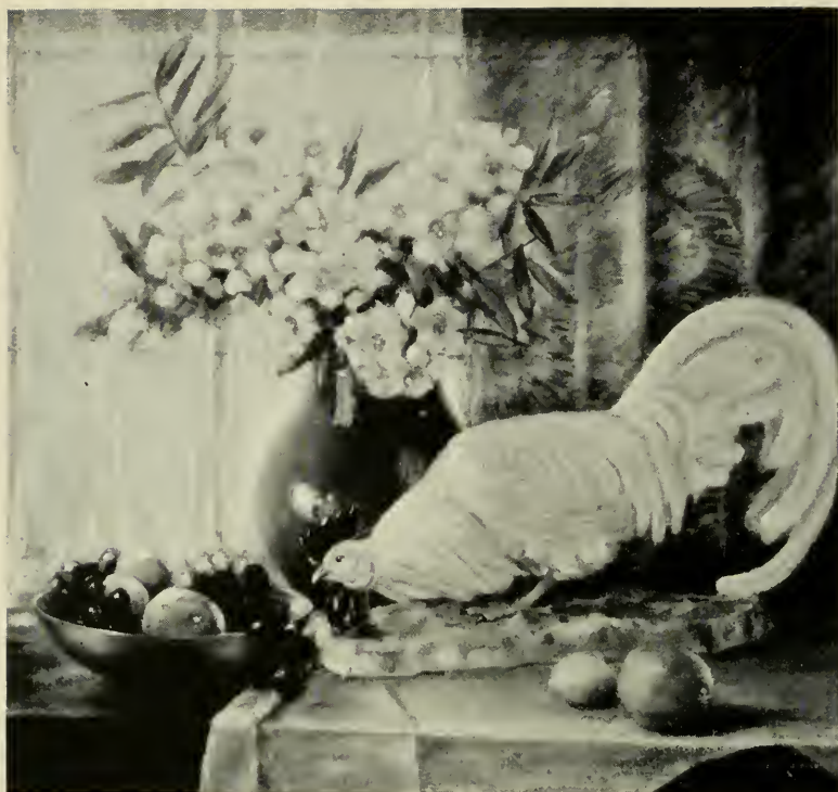
THE CHINA ROOSTER