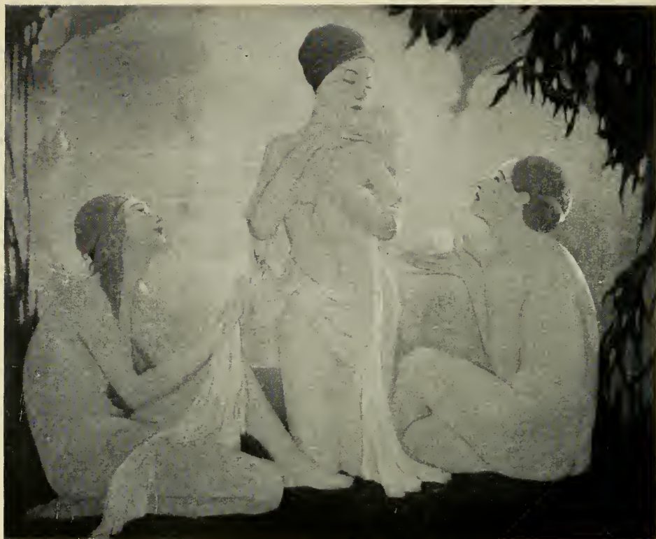
SONG OF SPRING