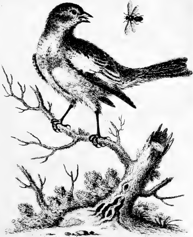
The great pied Mountain Finch or Bramlin. 1788

Edwards' first Essay towards Etching a Bird