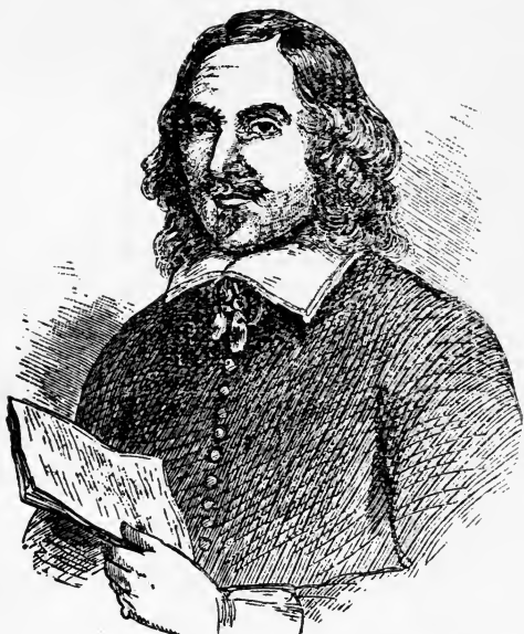
Portrait of Governor Edward Winslow.