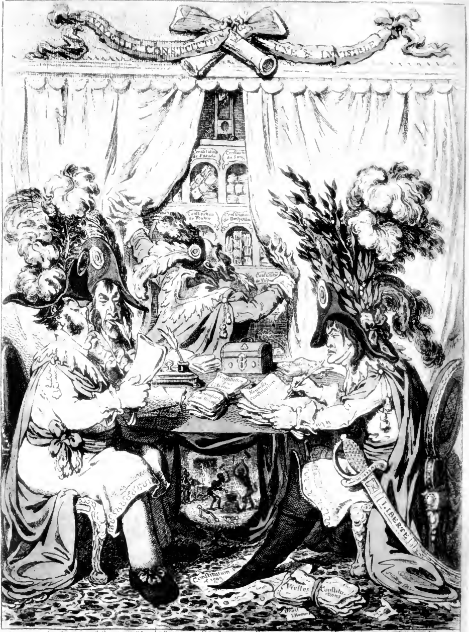
The Kings are the Likeness of CAMBRACQUES ... LE BRUN ... de ABRE SEVRES and DUONAPARTE, drawn at Paris Nov. 1793 The French-Consular-Triumvirate, sealing the New Constitution. See also Part II. in the Constitutional Papers Notes of the Abbe Sieyès in the Back Ground