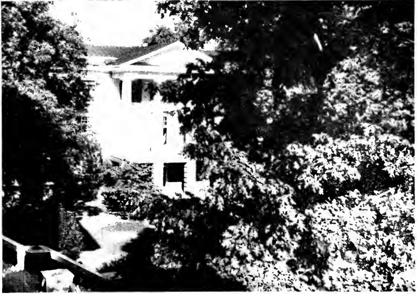
PATTIE JULIA WRIGHT BUILDING