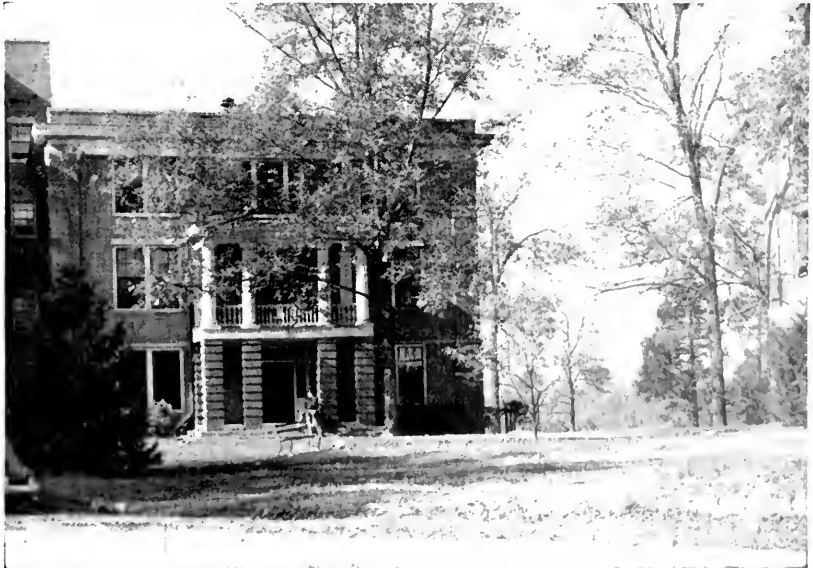
MATTHEW S. DAVIS MEMORIAL BUILDING