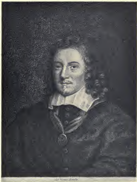
SIR JOHN DENHAM.

From the original in the Collection of the Earl of Chesterfield.