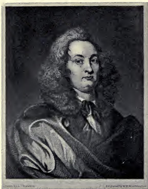
SIR WILLIAM DAVENANT. From an original Picture.