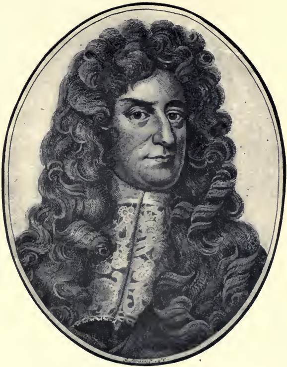
SIR ROGER L'ESTRANGE. From an original by Sir Godfrey Kneller.