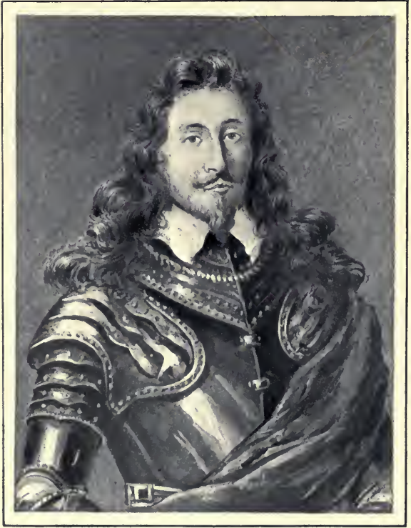
SIR EDWARD SHERBURNE.