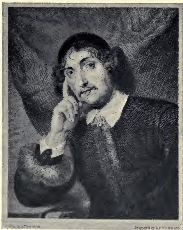
JAMES SHIRLEY. From an original Picture in the Bodleian Gallery.