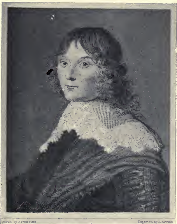
SIR JOHN SUCKLING. From an original Picture in the Ashmolean Museum, Oxford.