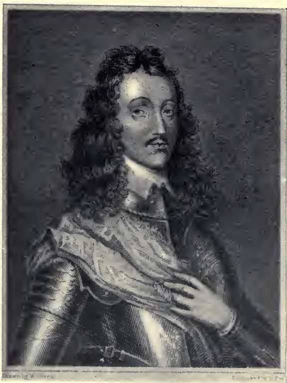
RICHARD LOVELACE. From an original Picture at Dulwich College.