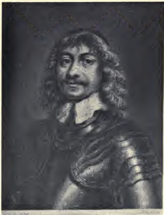
JAMES GRAHAM, Marquis of Montrose.