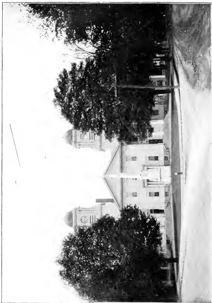
TOWN HALL AND HIGH SCHOOL.