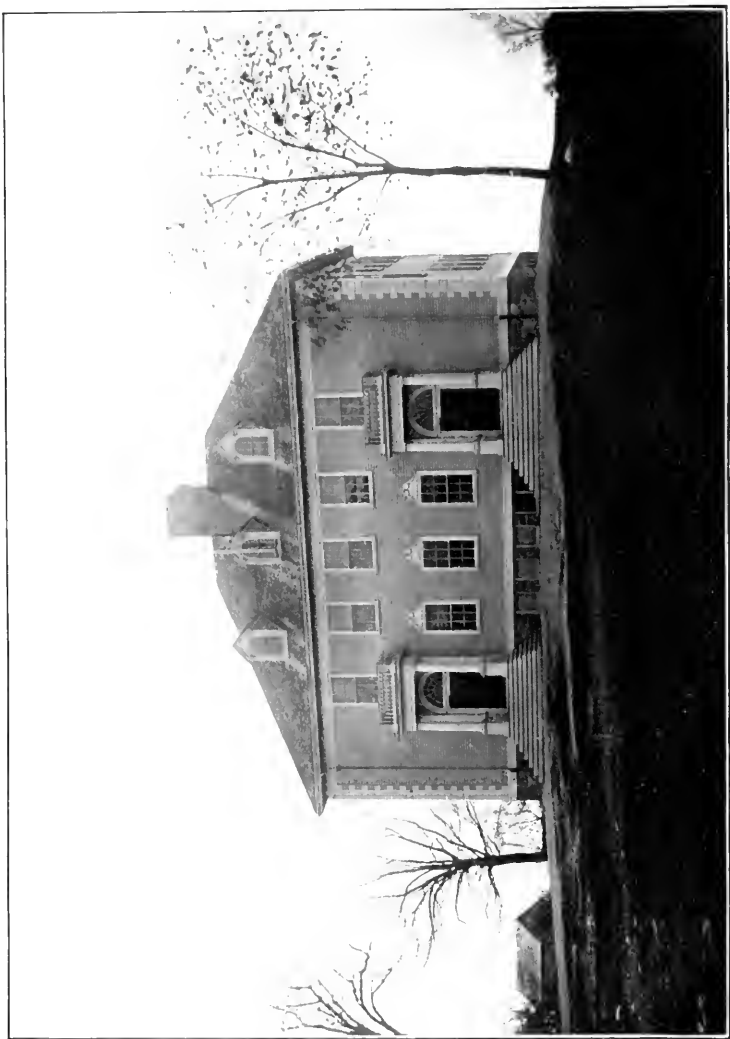
GRAMMAR SCHOOL, DANVERS CENTRE.