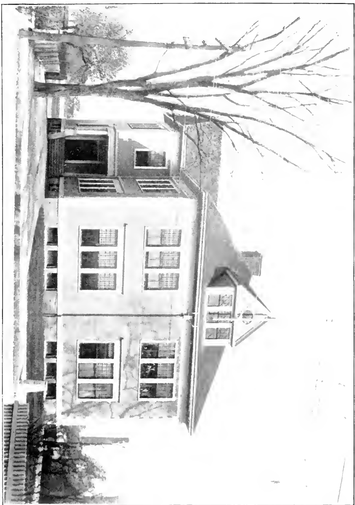
GRAMMAR SCHOOL, DANVERSPORT.