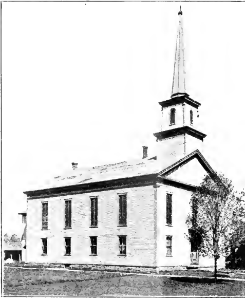
THE BAPTIST CHURCH