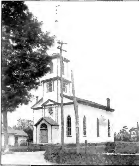
THE METHODIST CHURCH