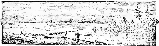
The Mouth of the River Boquet.