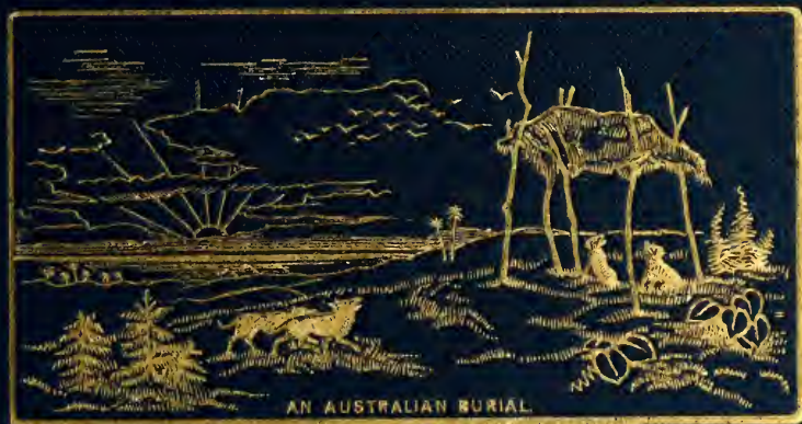
AN AUSTRALIAN BURIAL