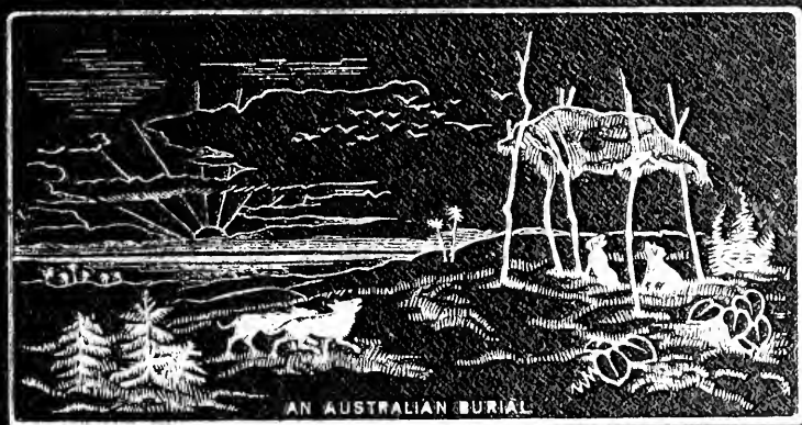
AN AUSTRALIAN BURIAL