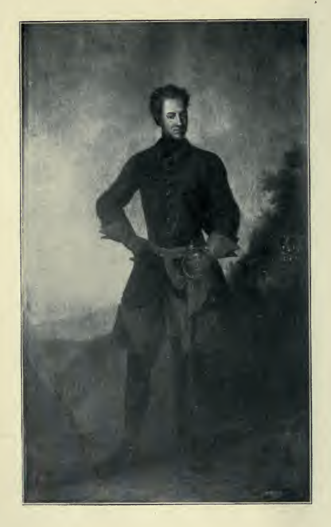
CHARLES XII., King of Sweden.

From a portrait in the Palace at Schwerin.