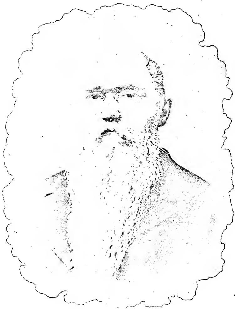
COL. WILLIAM LINN TIDBALL.