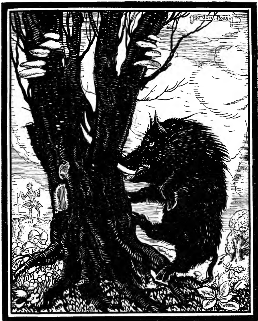
HIS TUSKS PIERCED THE TREE