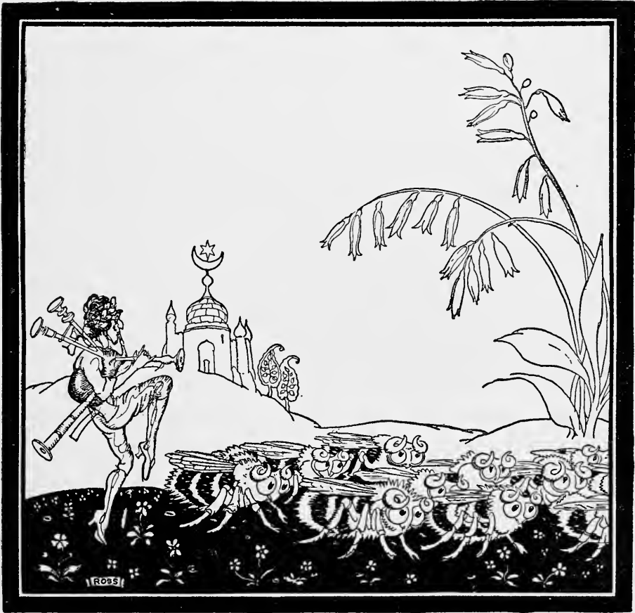
MY WORK WAS TO DRIVE THE SULTAN'S BEES TO THEIR PASTURE- GROUNDS