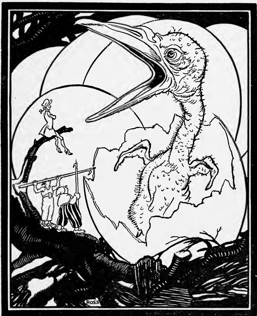
WITH GREAT DIFFICULTY WE CUT OPEN ONE OF THESE EGGS