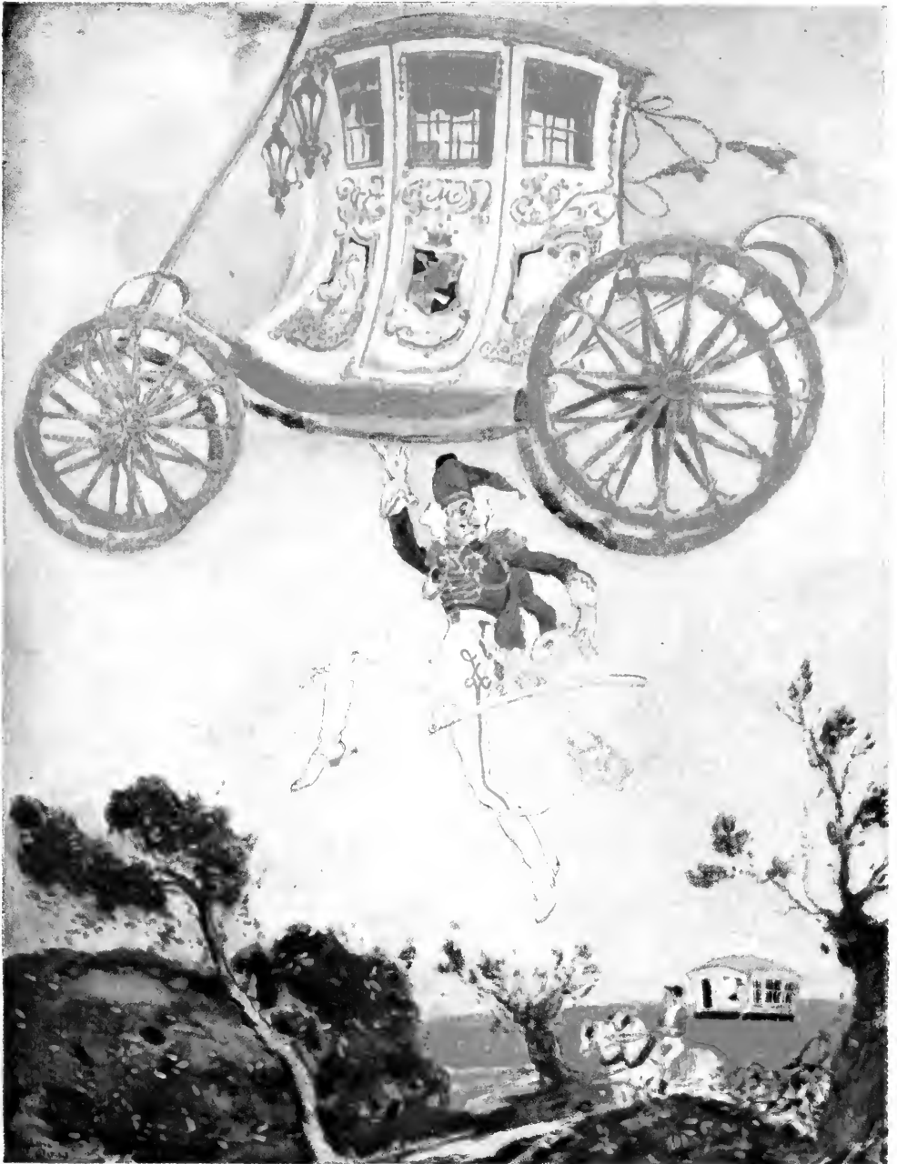
I THEN JUMPED A HEDGE ABOUT NINE FEET HIGH