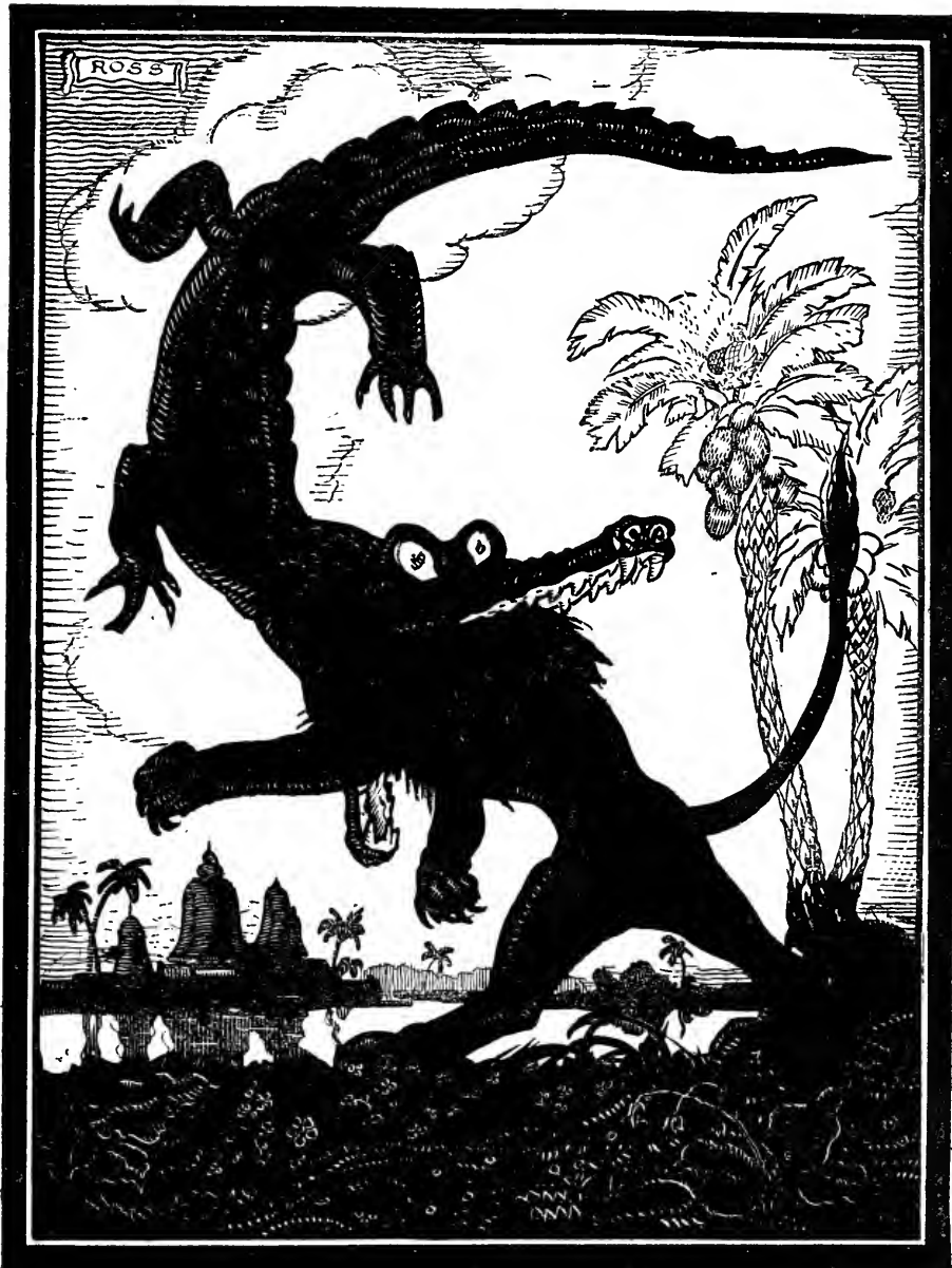
THE HEAD OF THE LION STUCK IN THE THROAT OF THE CROCODILE