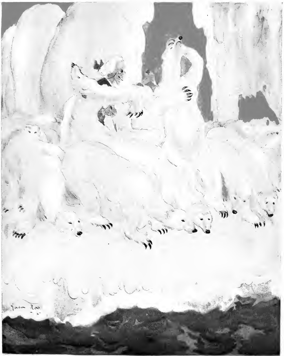
I SLAUGHTERED THE CREATURES ONE BY ONE