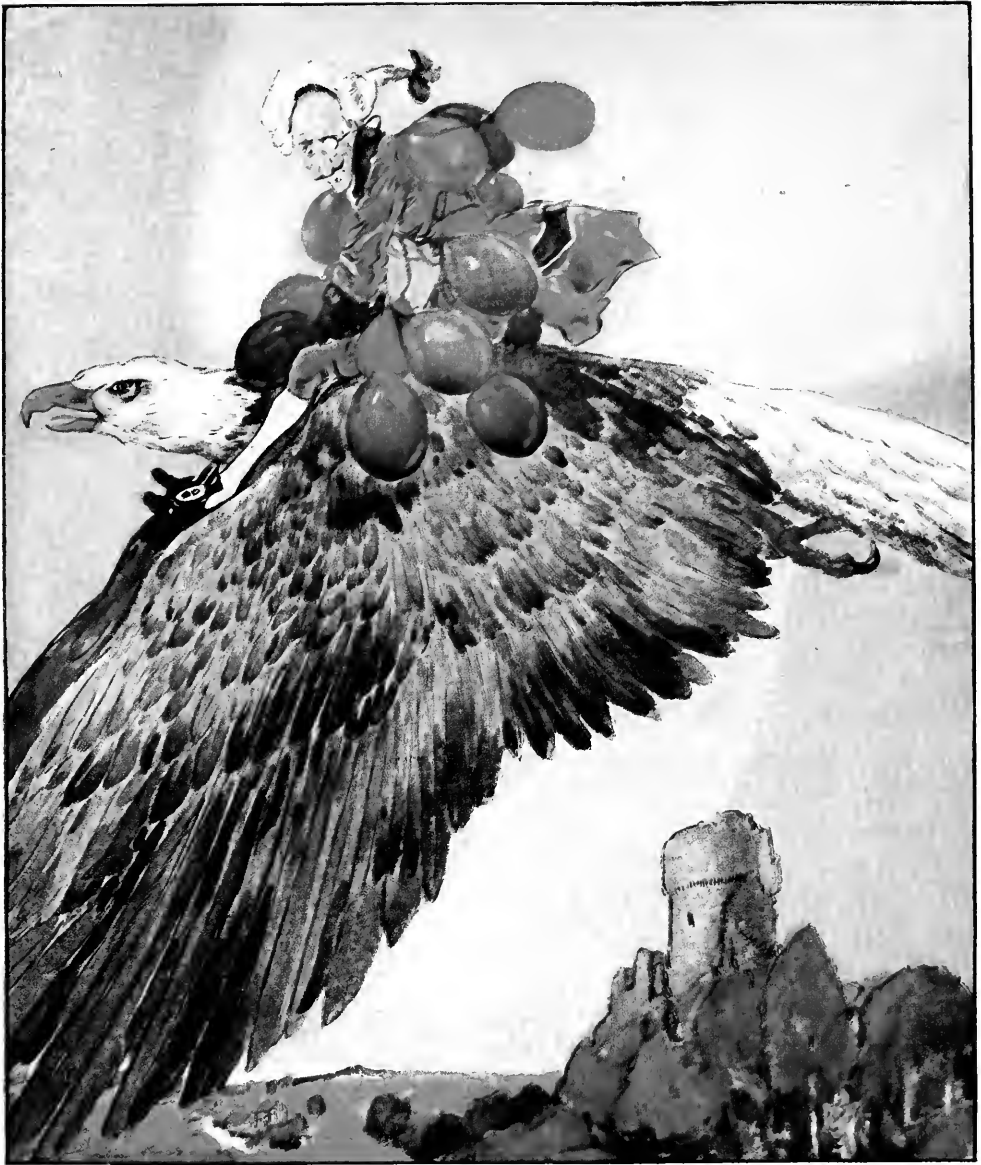
AT LAST THE BIRDS ROSE WITH GREAT SPEED AND VIGOR