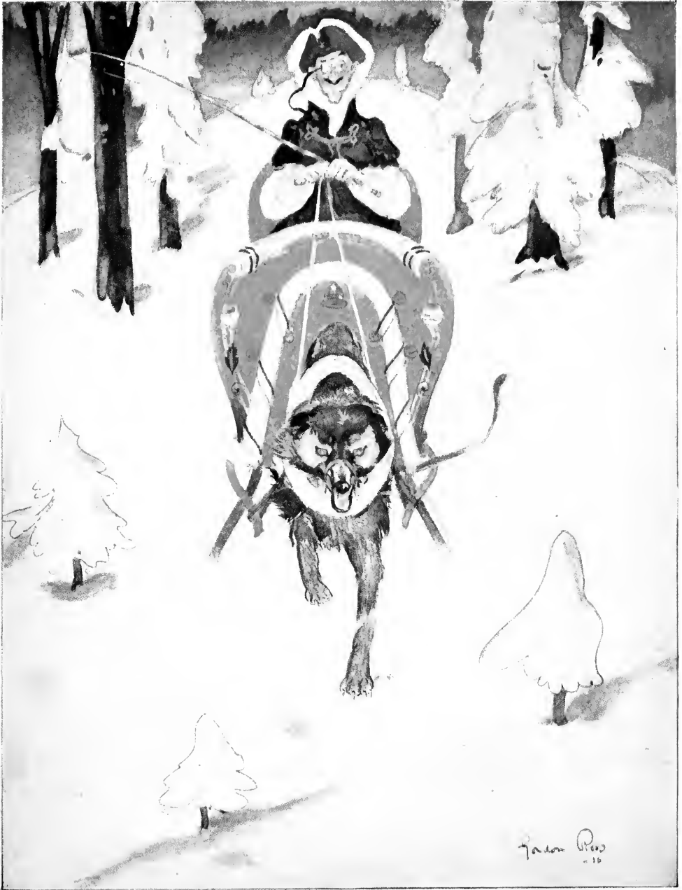
HE HAD, OF COURSE, EATEN HIS WAY INTO MY BEAST'S HARNESS