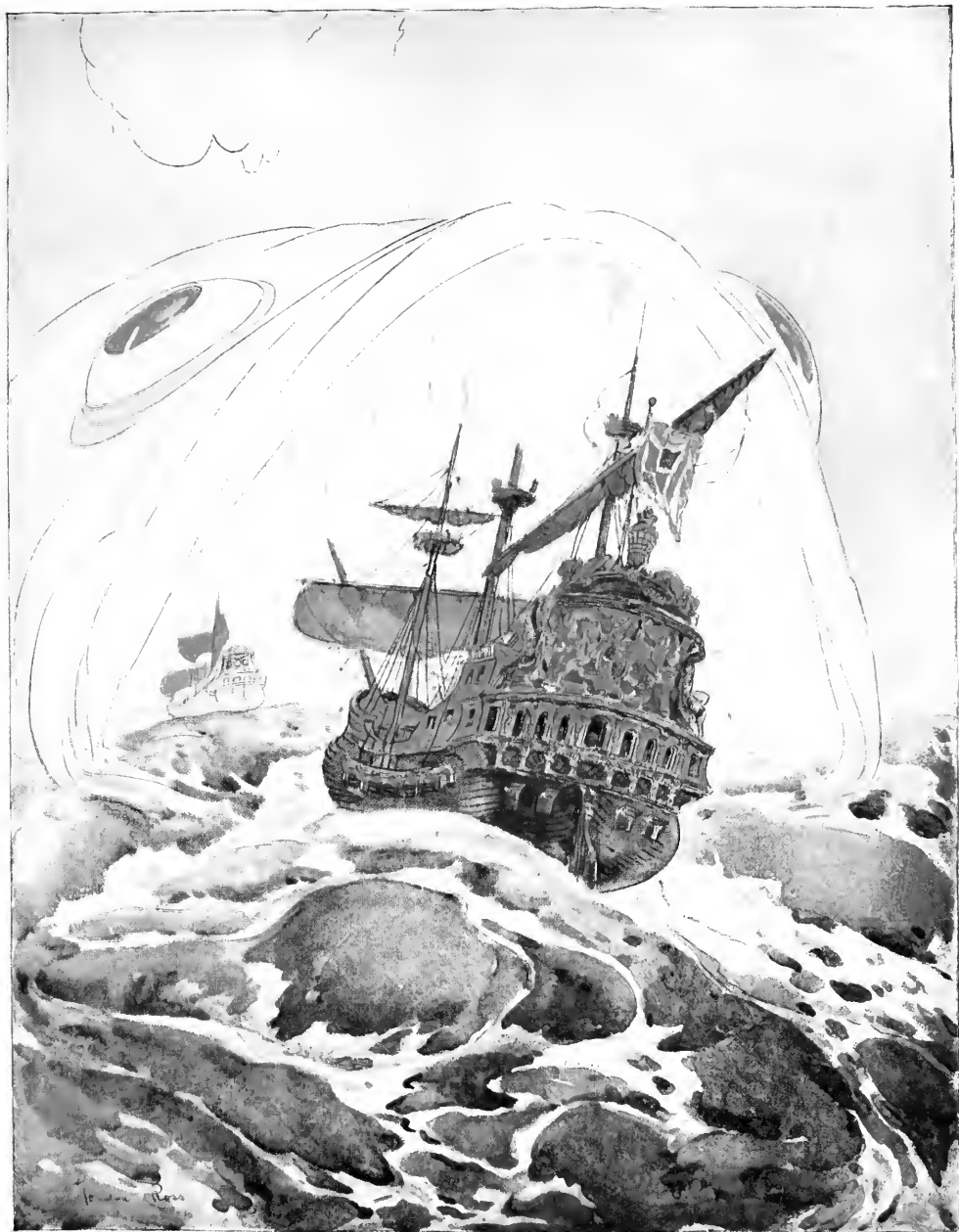
OUR SHIP, WITH ALL MASTS STANDING AND WITH SAILS FULL SET, WAS DRAWN STRAIGHT INTO HIS MOUTH