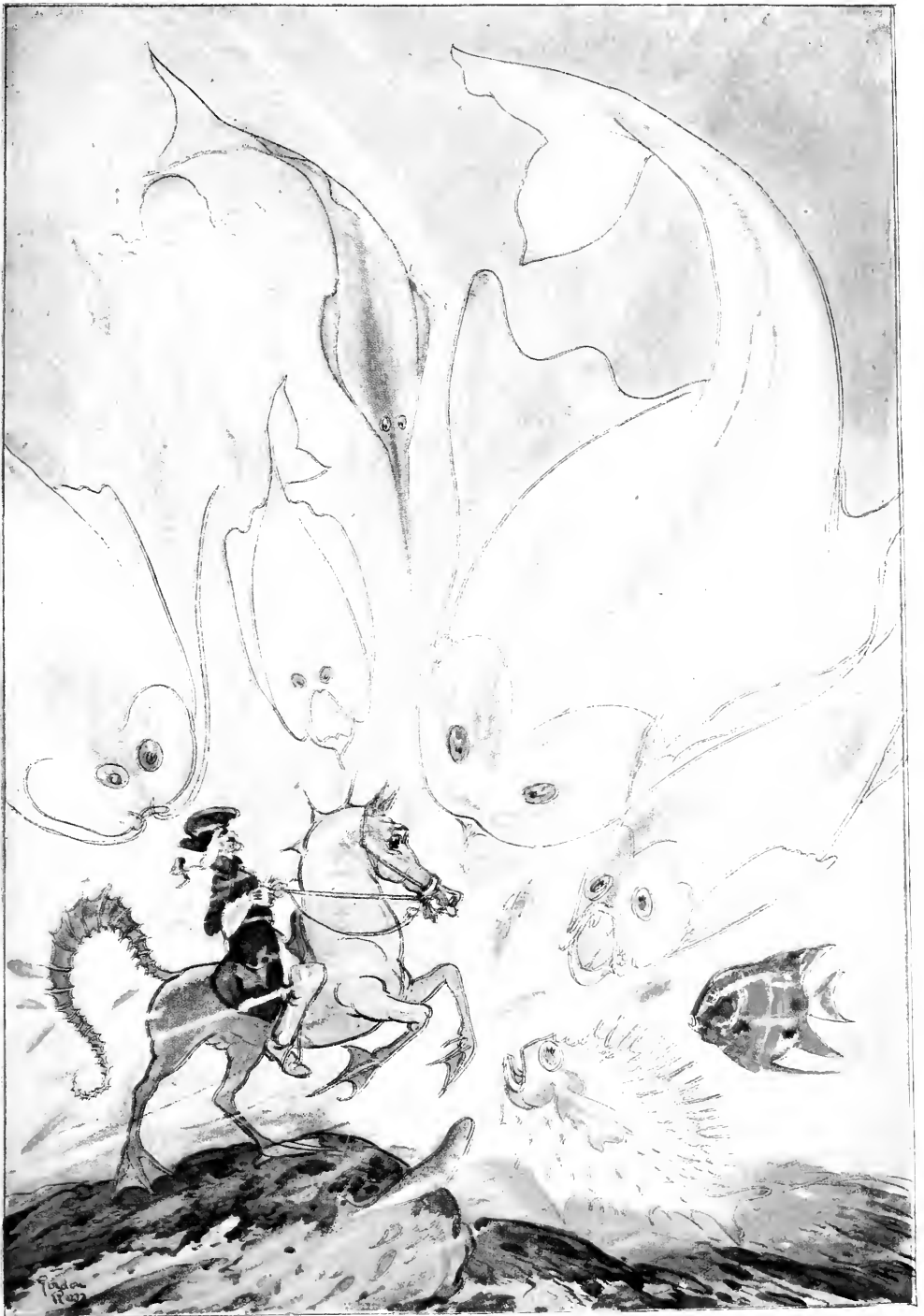
HE GALLOPED ACROSS THE SEA'S BOTTOM