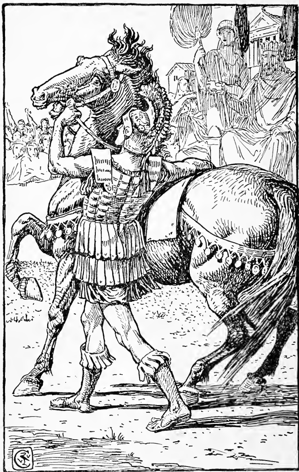
ALEXANDER TAMING BUCEPHALUS