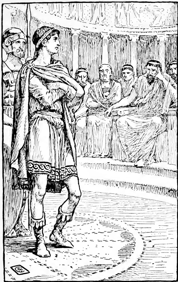
THE DOOM OF AGIS KING OF SPARTA. G