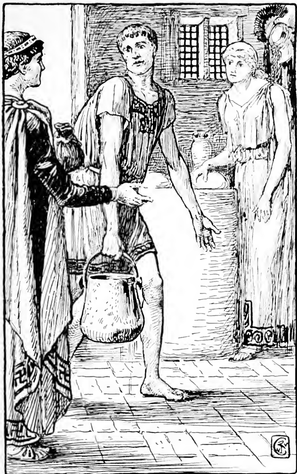
PHOCION & THE MACEDONIAN ENVOY