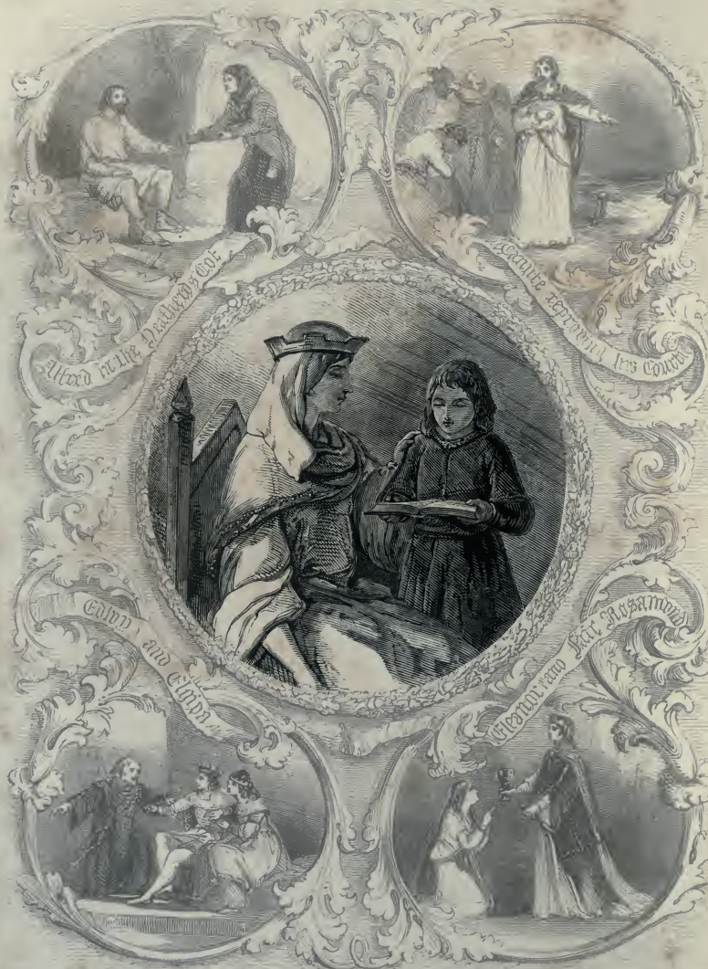
Alfred make Dialects Eng