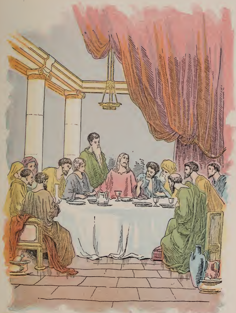
THE LAST SUPPER.