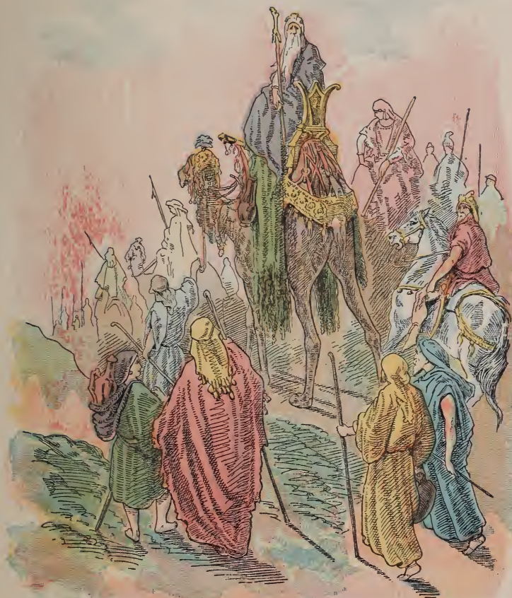
THE STAR IN THE EAST.