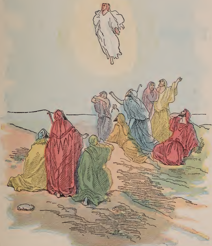
THE ASCENSION INTO HEAVEN.