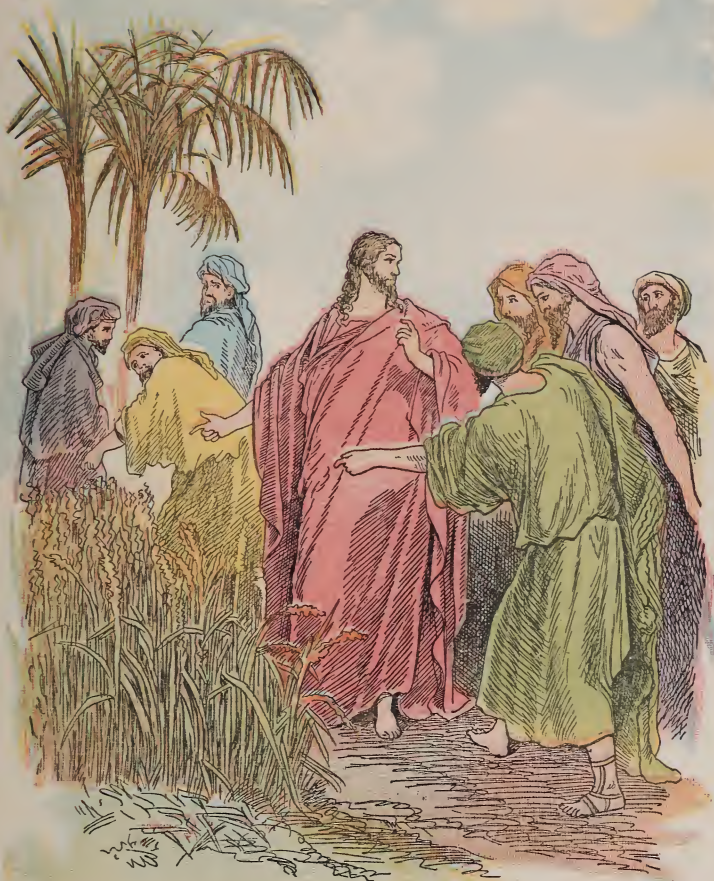
THE DISCIPLES PLUCKING CORN ON THE SABBATH.