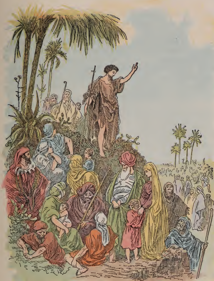
JOHN THE BAPTIST.