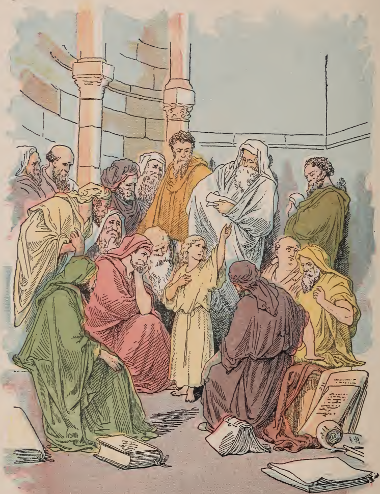
JESUS QUESTIONING THE DOCTORS.