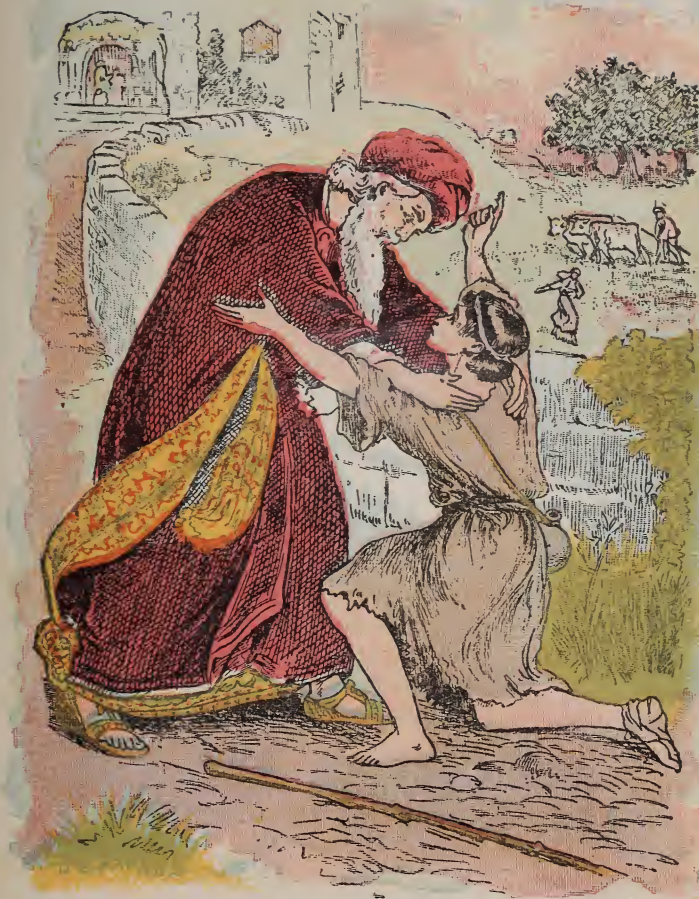
THE PRODIGAL SON.