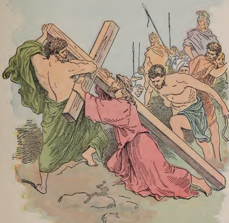
JESUS CARRIES THE CROSS.