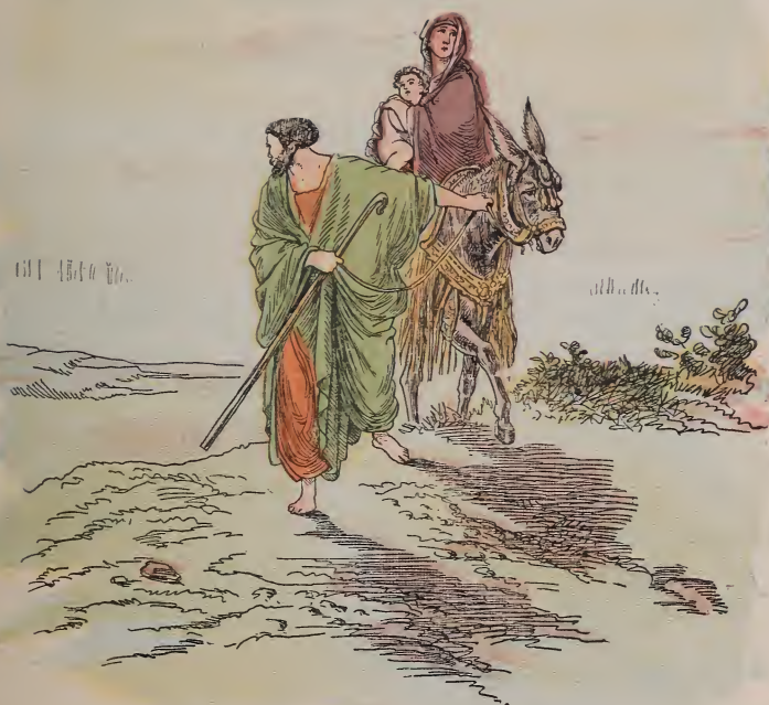
THE FLIGHT INTO EGYPT.