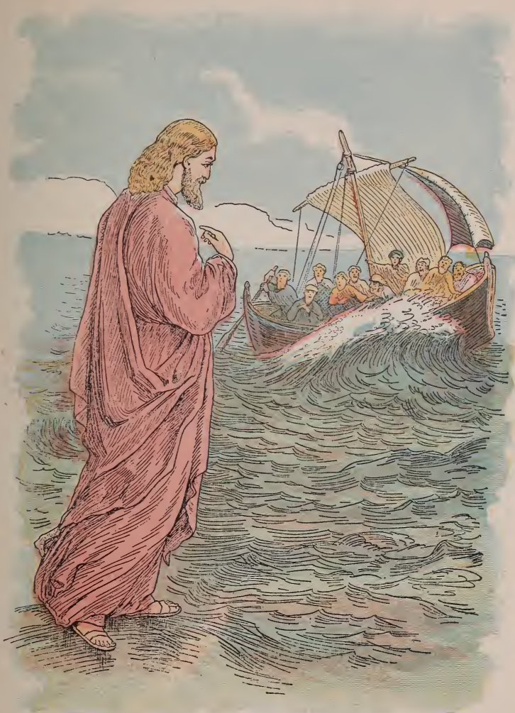
JESUS WALKING ON THE WATER.