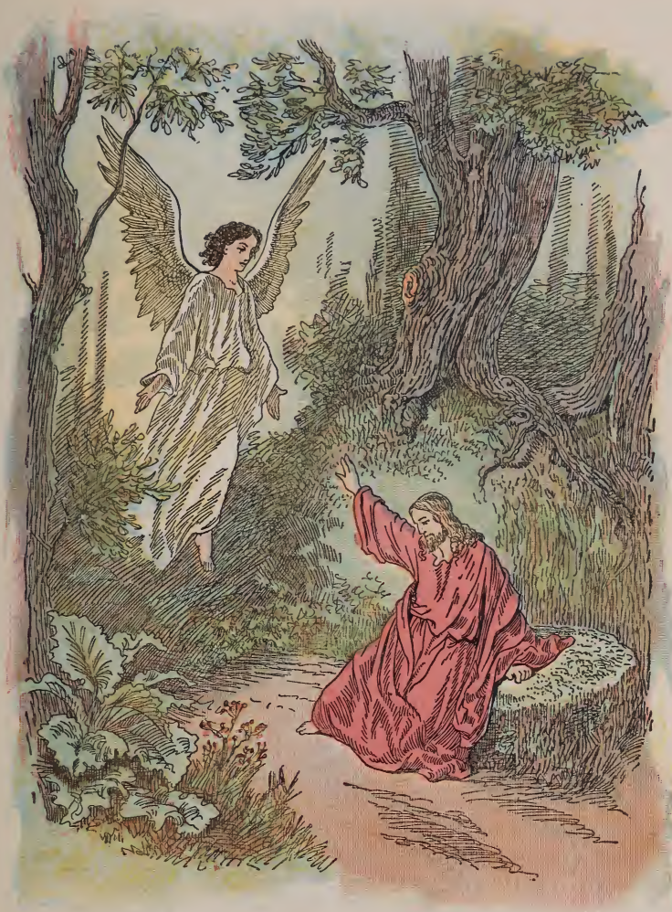
THE AGONY IN THE GARDEN.