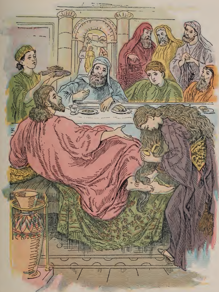
MARY ANOINTING THE FEET OF JESUS.