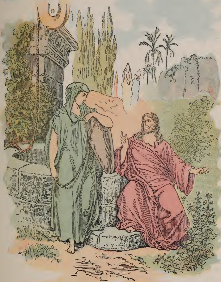
JESUS AND THE WOMAN OF SAMARIA.