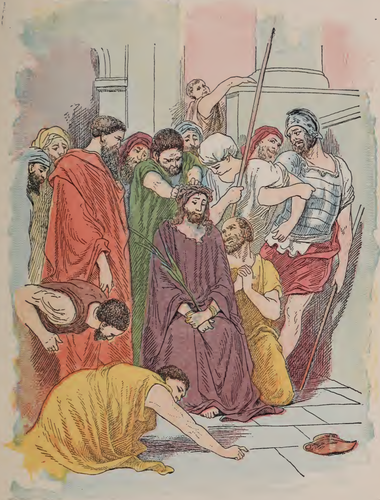
THE CROWNING WITH THORNS.