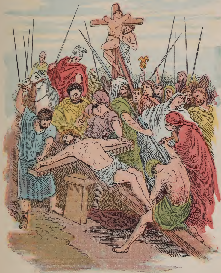
JESUS NAILED TO THE CROSS.