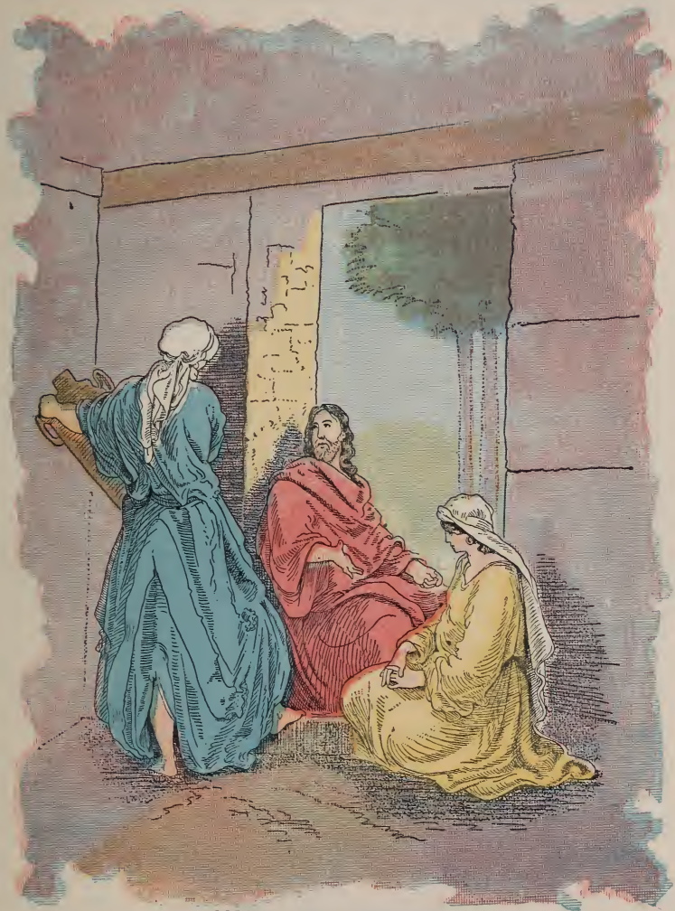
MARY AND MARTHA.