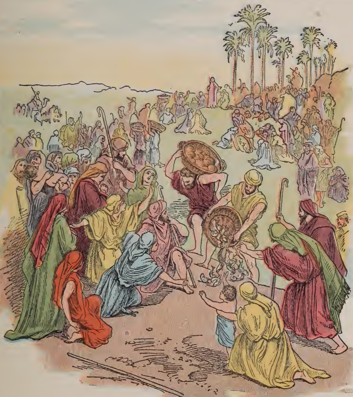
THE FEEDING OF THE MULTITUDE.