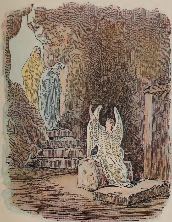
THE ANGEL AT THE SEPULCHER.