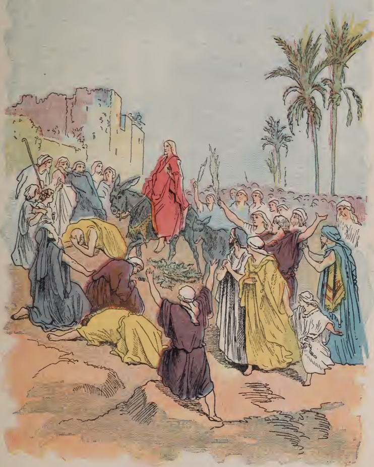
THE ENTRY INTO JERUSALEM.