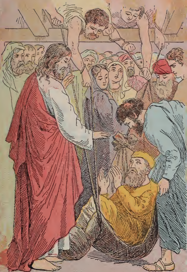
THE CURING OF THE PARALYTIC.