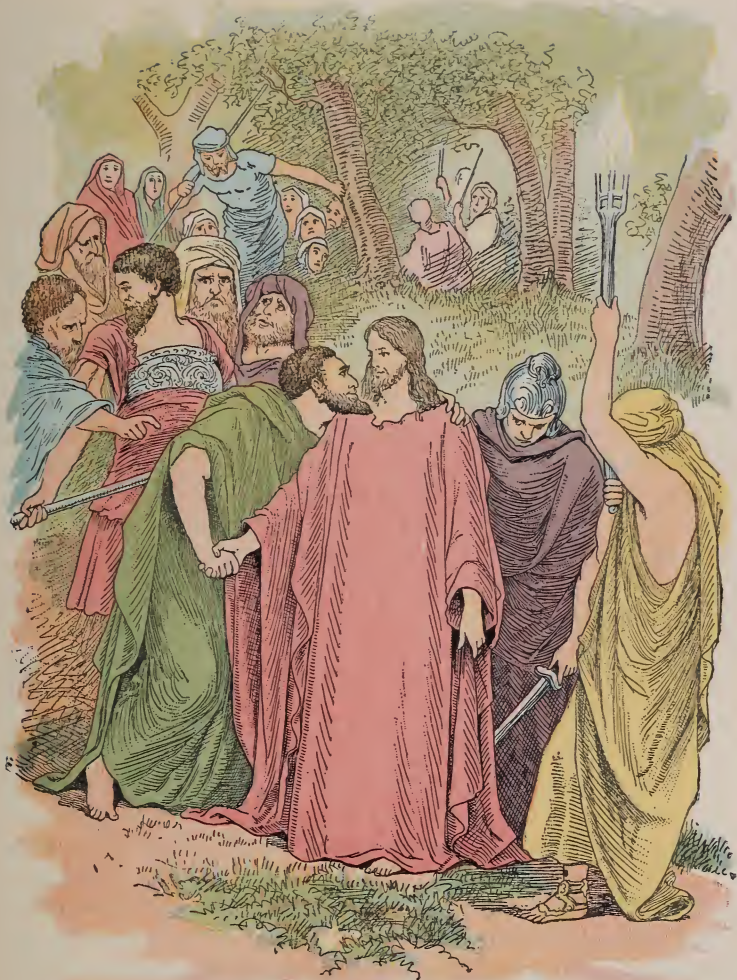
THE BETRAYAL BY JUDAS.