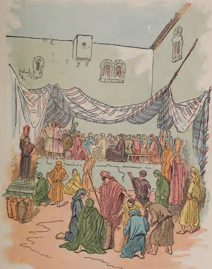
THE MARRIAGE FEAST AT CANA.