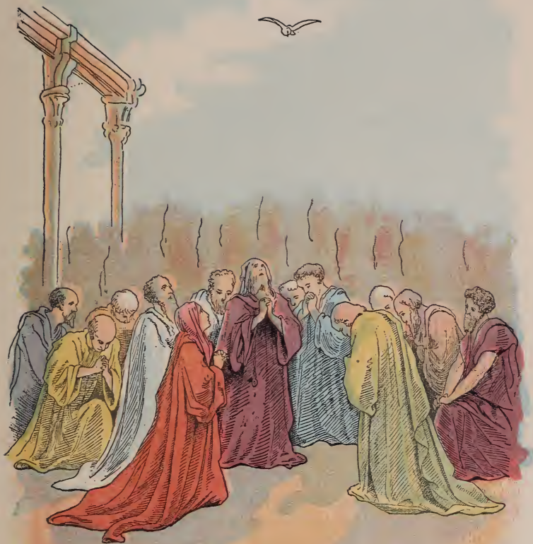
THE DESCENT OF THE HOLY GHOST.