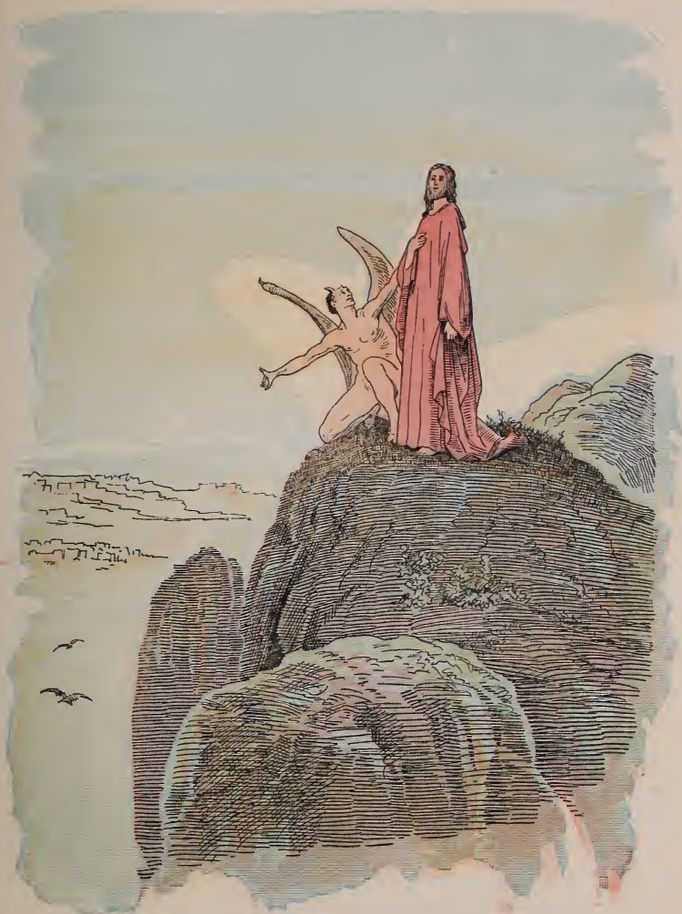
THE TEMPTATION OF JESUS.