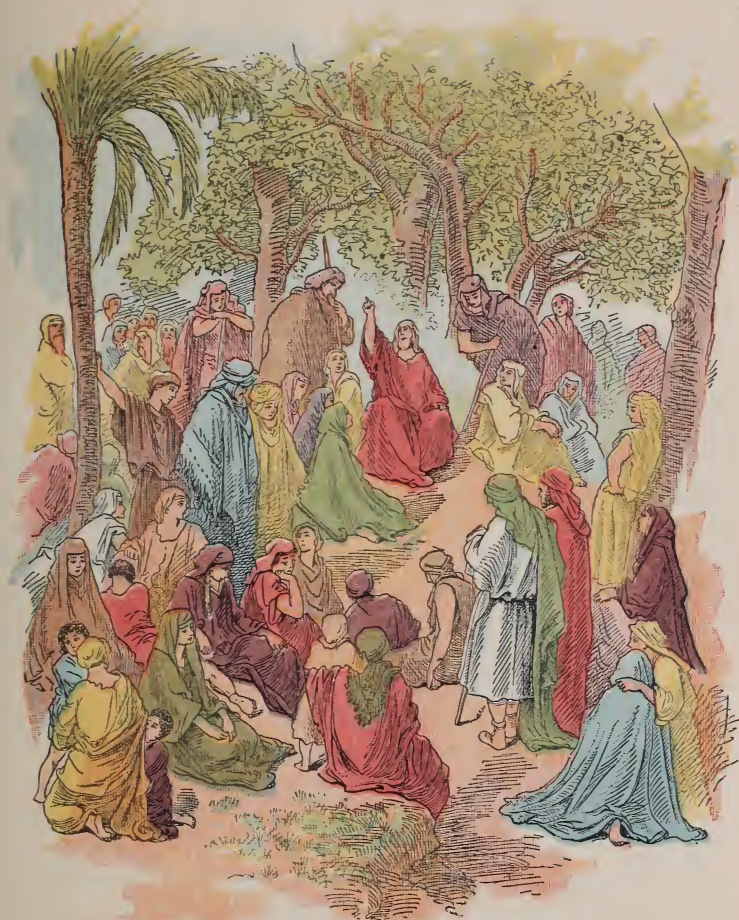
THE SERMON ON THE MOUNT.