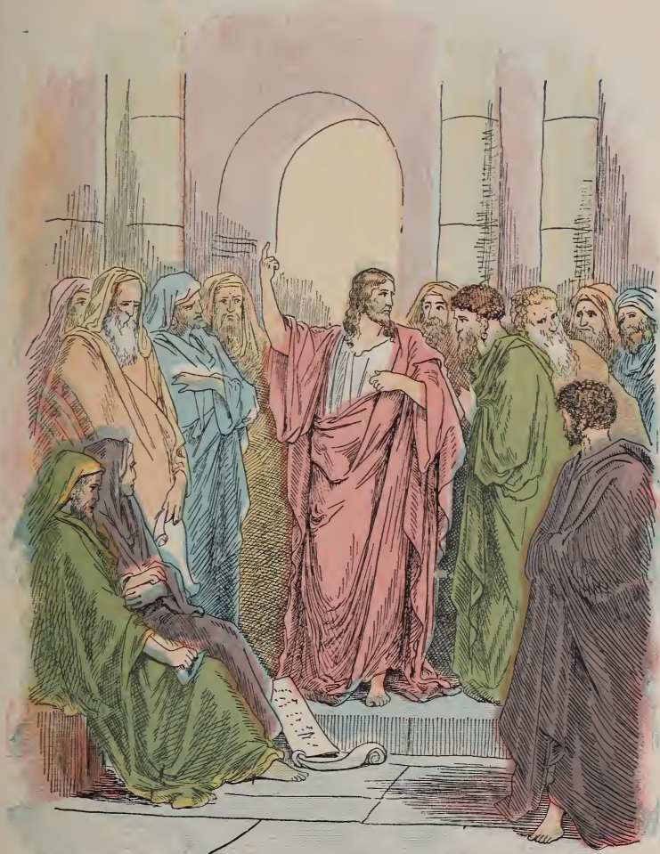
JESUS IN THE SYNAGOGUE.