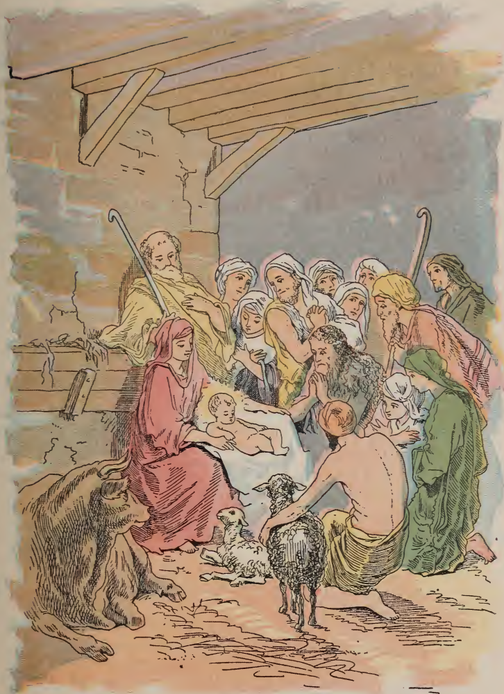
THE BIRTH OF CHRIST.