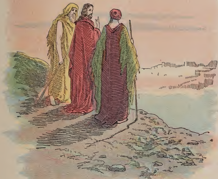
THE JOURNEY TO EMMAUS.