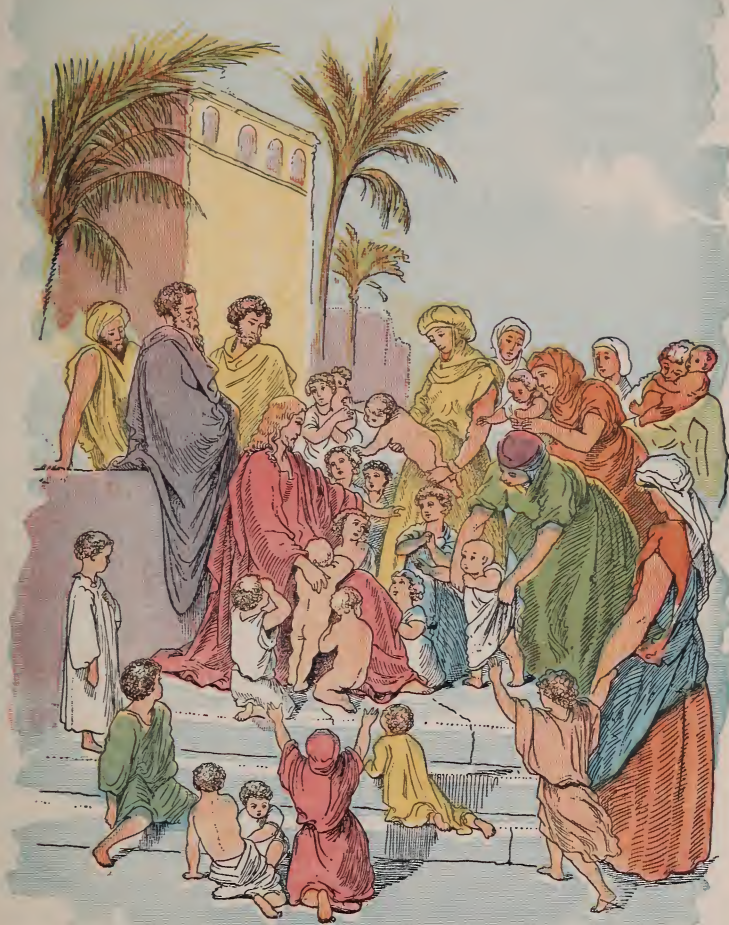
JESUS BLESSING THE CHILDREN.