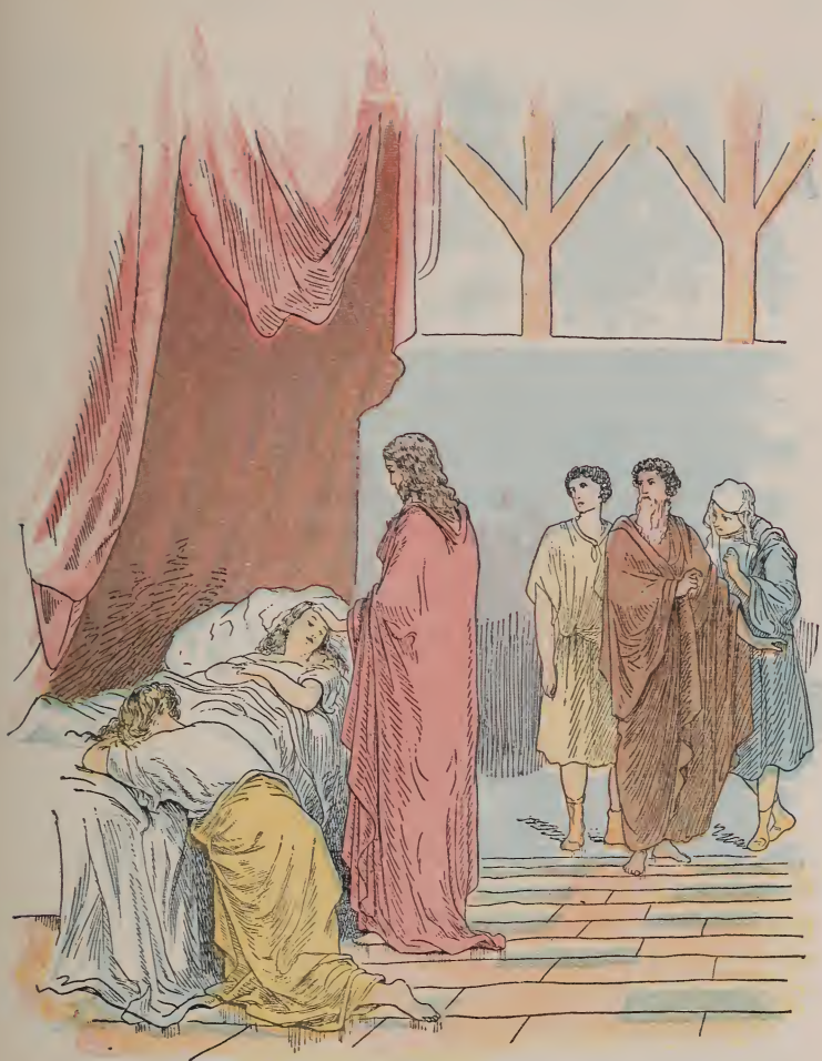
RAISING OF THE DAUGHTER OF JAIRUS.