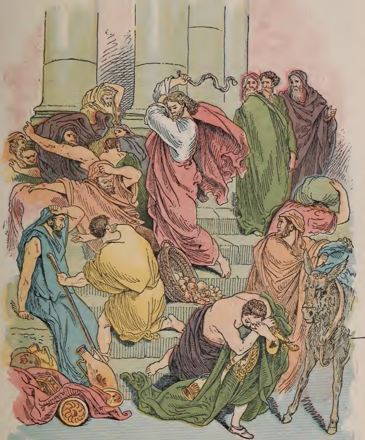
DRIVING THE SELLERS FROM THE TEMPLE.