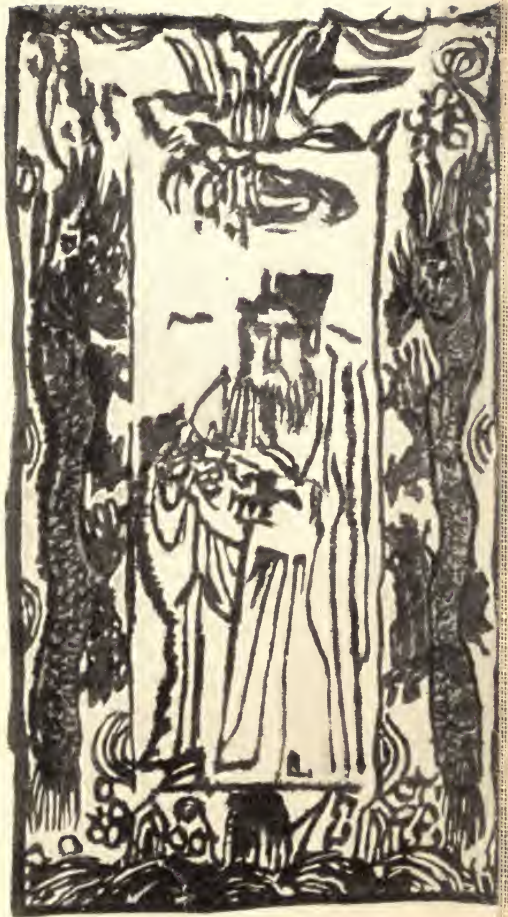
A CHINESE BOOK COVER DECORATION

Made when the Anglo-Saxon people were living in caves