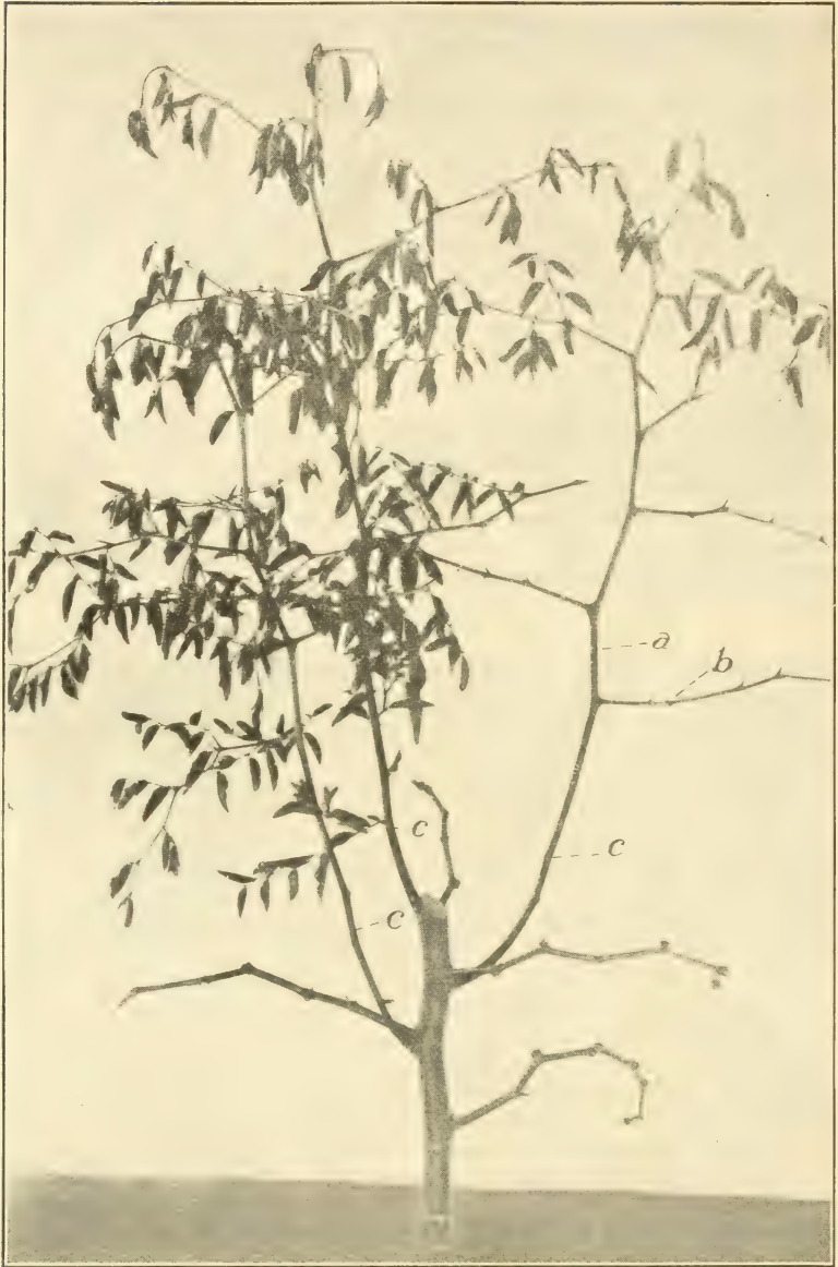
FIGURE 4.—Top of a jujube tree which has been cut back, showing new growth, small lateral branches, and spines: a , Wood suitable for propagation; b , twigs too small to be used in propagating; c , new branches resulting from cutting back the main branch.