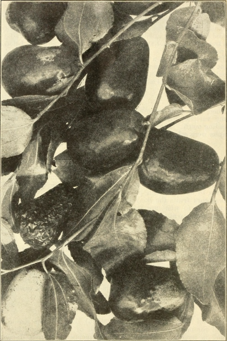
FIGURE 3.—The Lang jujube. The tree is a good bearer, and the large, pear-shaped fruits, which average 25 to 30 to the pound, are very satisfactory for processing. The various stages in ripening are shown above. (About natural size.)