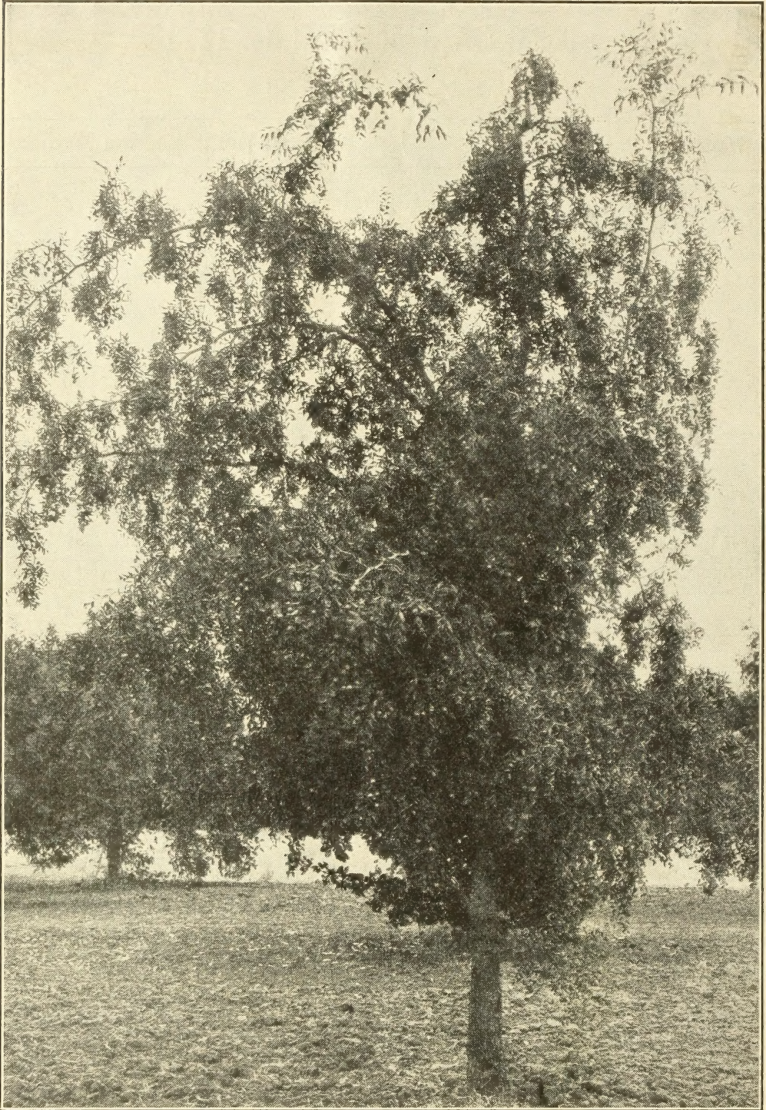
FIGURE 1.—A seedling jujube tree showing upright growth habit most common in cultivated varieties.

China throughout northern India, Iran (Persia), Armenia, and Syria to the Mediterranean region, Spain, and France. Throughout most of this region, according to De Candolle, the jujube is found both