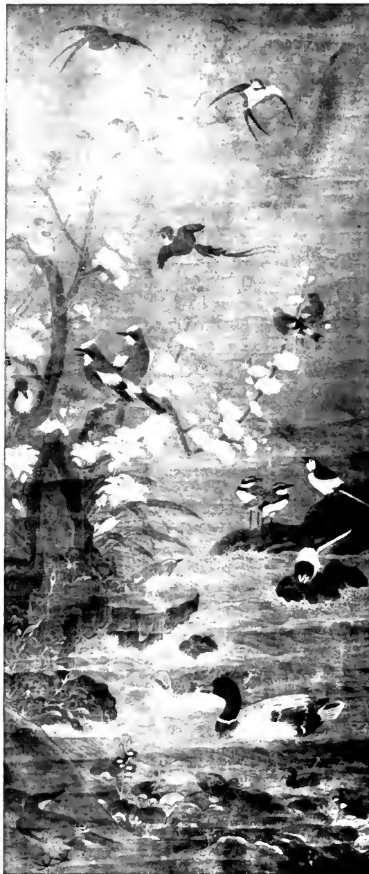
PLATE XV. PAINTINGS OF THE YÜAN OR EARLY MING PERIOD Style of the Northern School. Collection of R. Petrucci.