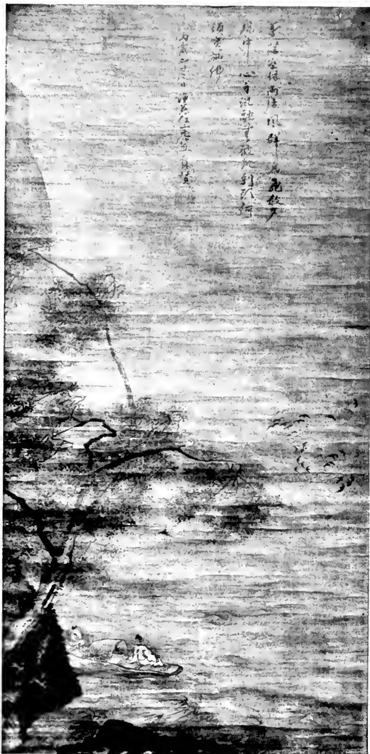
PLATE XI. LANDSCAPE BY MA LIN Sung Period. Collection of R. Petrucci.