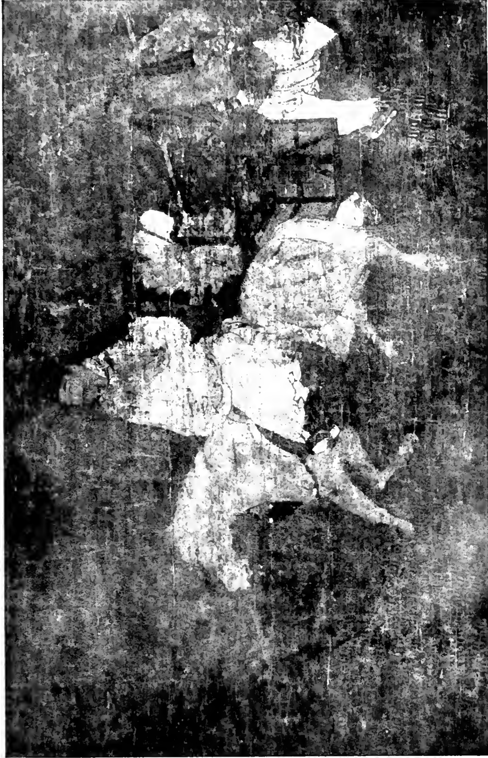
PLATE IX. HORSEMAN FOLLOWED BY TWO ATTENDANTS