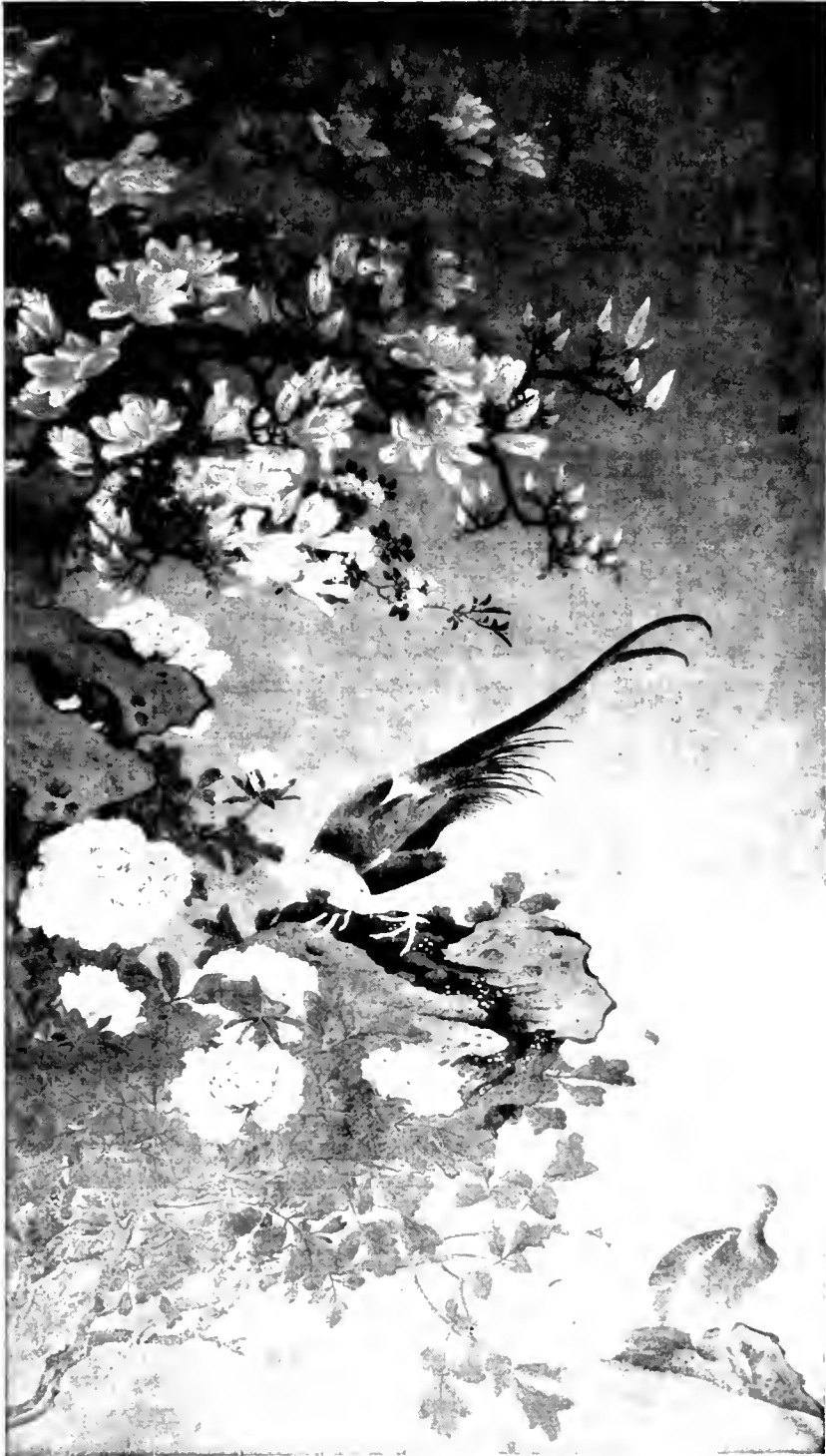
PLATE XXIV. PAINTING BY CHANG CHENG Eighteenth Century. Collection of M. Worch.