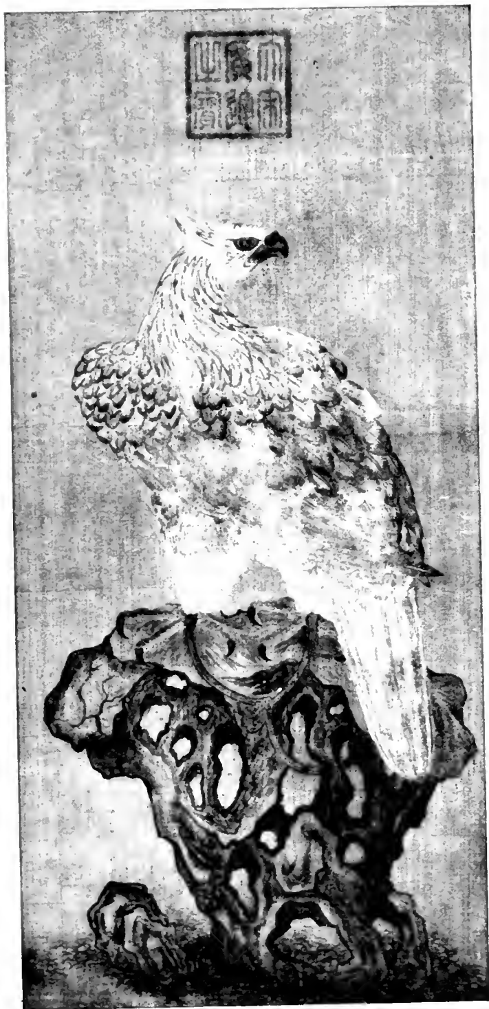
PLATE VIII. WHITE EAGLE. SUNG PERIOD Collection of R. Petrucci.