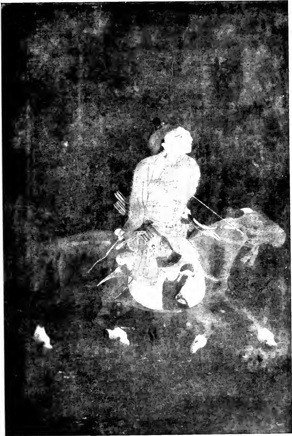
PLATE XII. MONGOL HORSEMAN RETURNING FROM THE HUNT

By Chao Mêng-fu. Yüan Period. Doucet Collection.