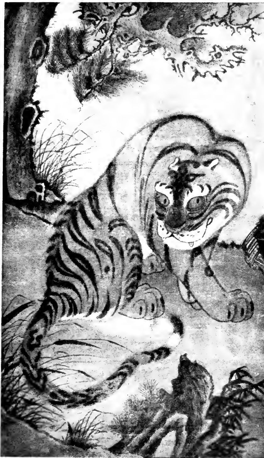
PLATE XXV. TIGER IN A PINE FOREST Eighteenth to Nineteenth Centuries. Collection of V. Goloubew.