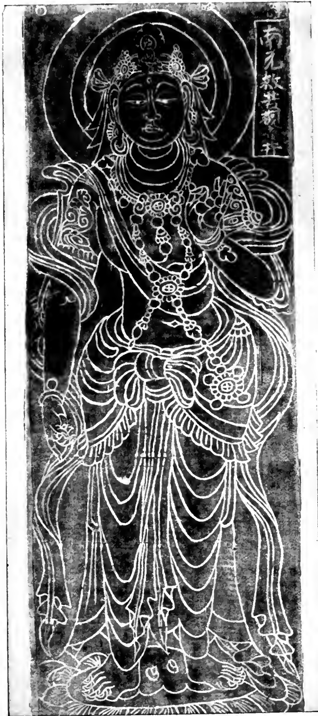
PLATE III. KWANYIN. EIGHTH TO TENTH CENTURIES Painting brought from Tun-huang by the Pelliot Expedition. The Louvre, Paris.