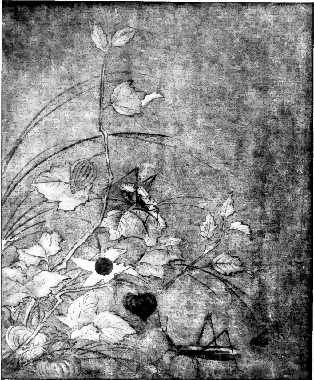
PLATE XX. FLOWERS AND INSECTS Ming Period. Collection of R. Petrucci.