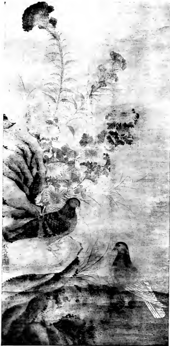
PLATE XIII. PIGEONS BY CH' IEN HSÜAN Yüan Period. Collection of R. Petrucci.