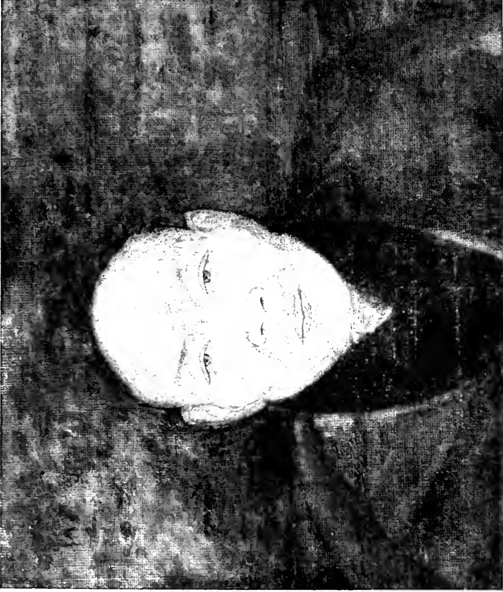
PLATE XVI. PORTRAIT OF A PRIEST Yüan or Early Ming Period. Collection of H. Rivière.