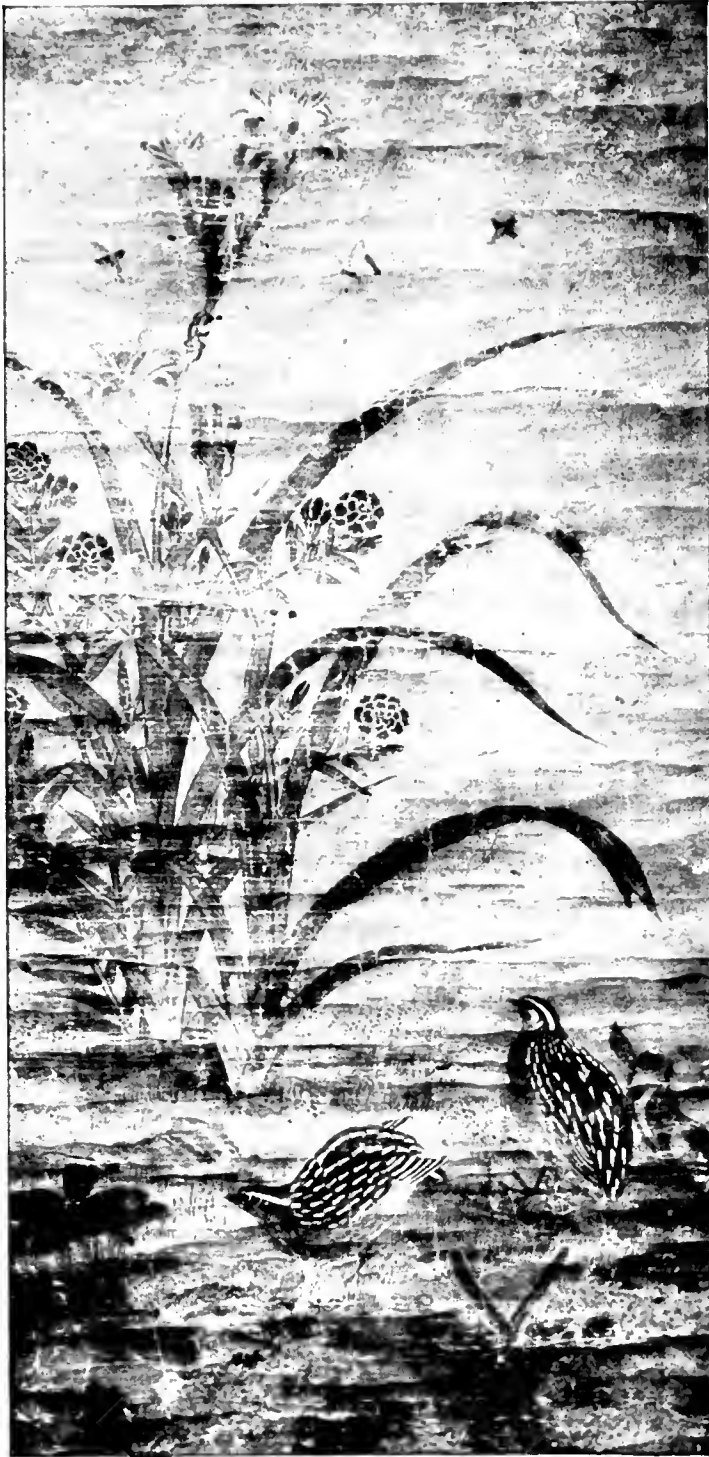
PLATE VI. PAINTING BY AN UNKNOWN ARTIST T'ang Period. Collection of R. Petrucci.