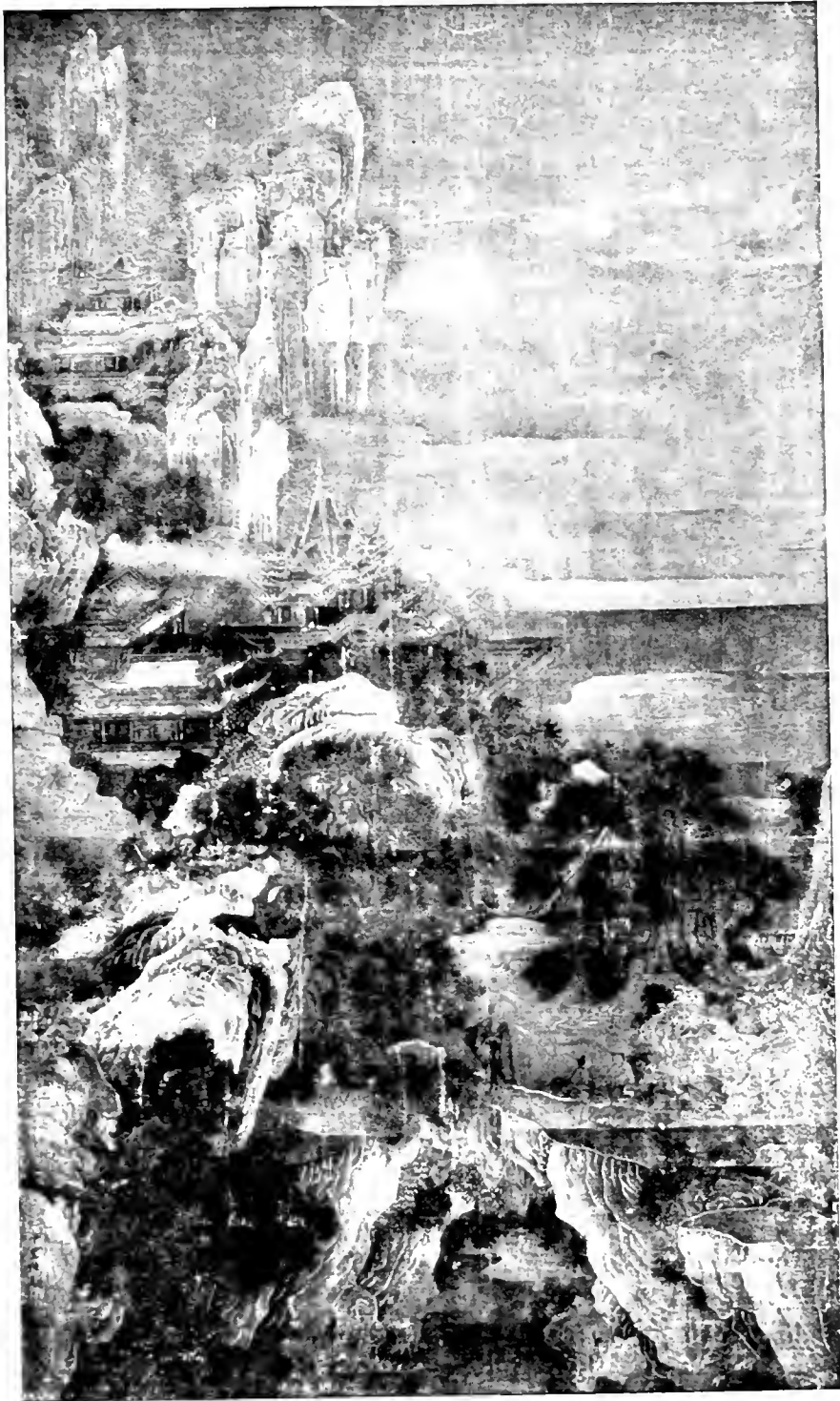
PLATE XXI. LANDSCAPE Ming Period. Bouasse-Lebel Collection.