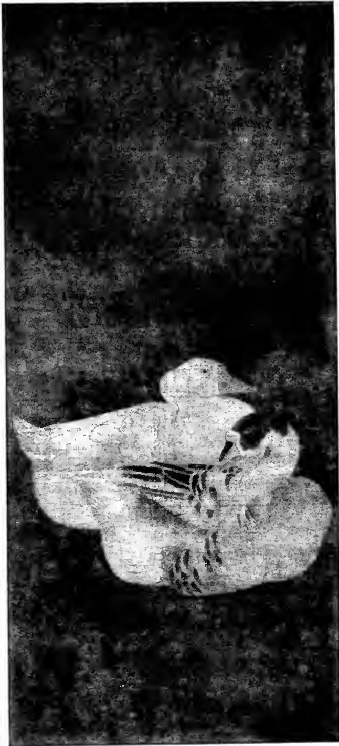
PLATE VII. GEESE Sung Period. British Museum, London.