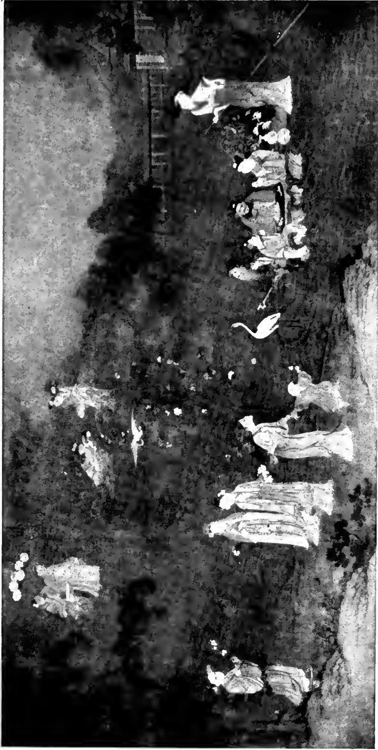
PLATE XVIII. VISIT TO THE EMPEROR BY THE IMMORTALS FROM ON HIGH