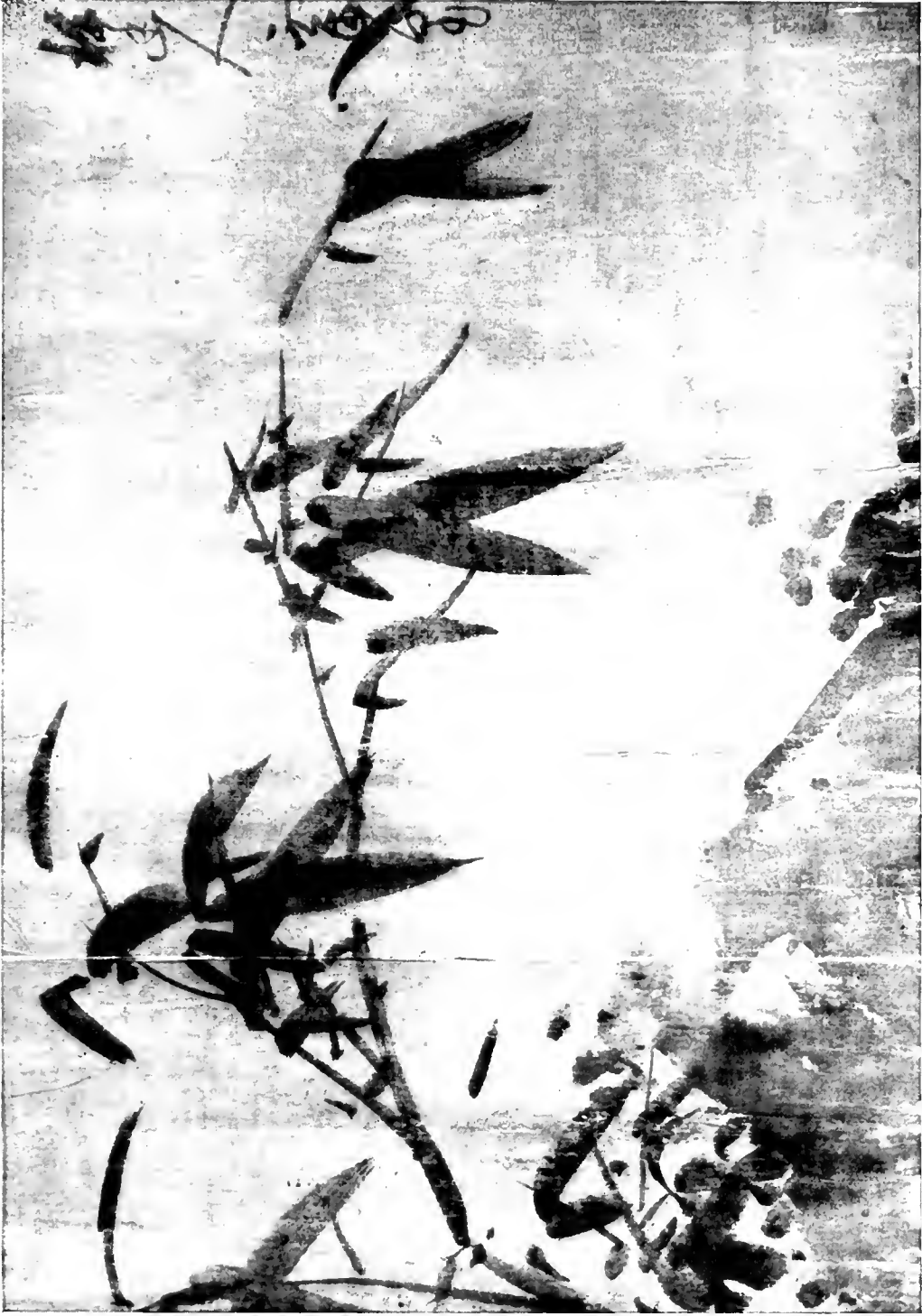
PLATE XIV. BAMBOOS IN MONOCHROME BY WU CHÉN