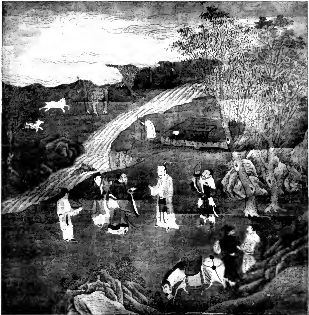
PLATE XXIII. HALT OF THE IMPERIAL HUNT Ming Period. Sixteenth Century. Collection of R. Petrucci.