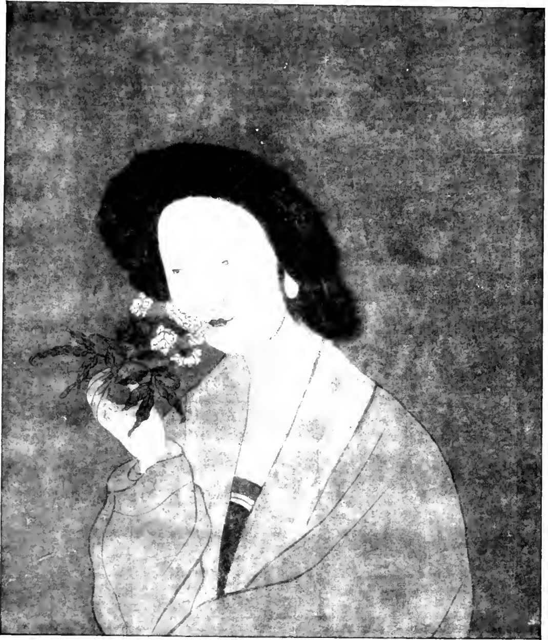
PLATE XXII. BEAUTY INHALING THE FRAGRANCE OF A PEONY