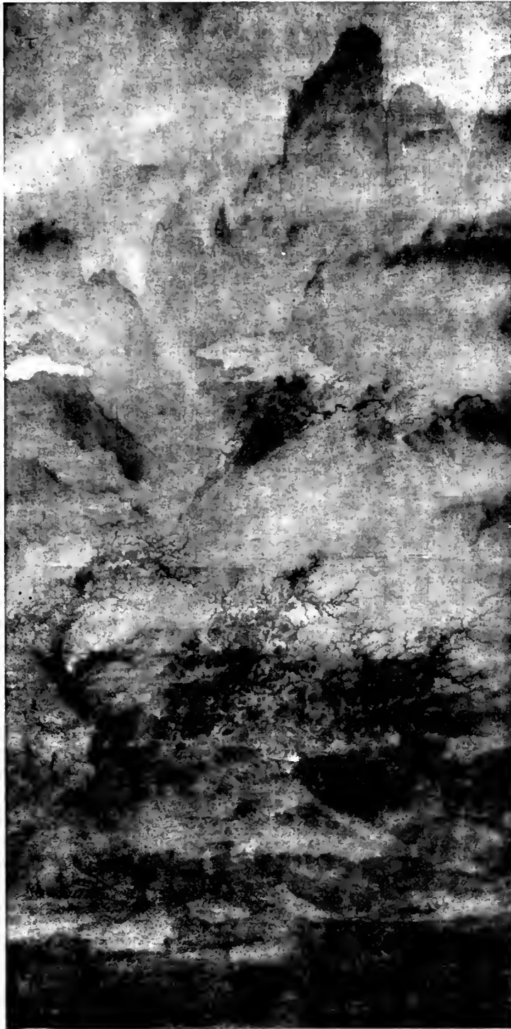
PLATE X. LANDSCAPE IN THE STYLE OF HSIA KUEI Sung Period. Collection of Martin White.