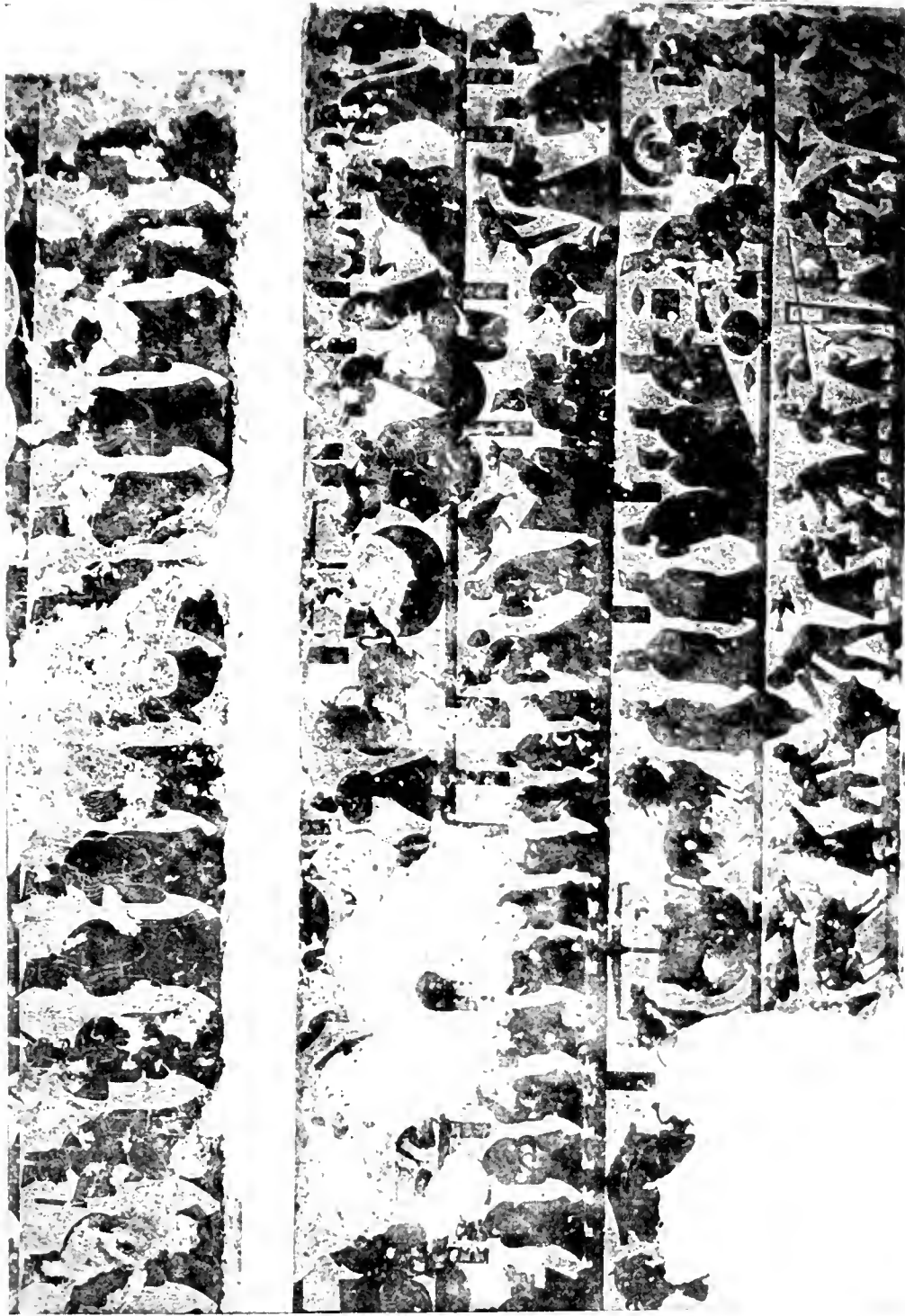
PLATE I. SCULPTURED STONES OF THE HAN DYNASTY Second to Third Centuries. Rubbings taken by the Chavannes Expedition.