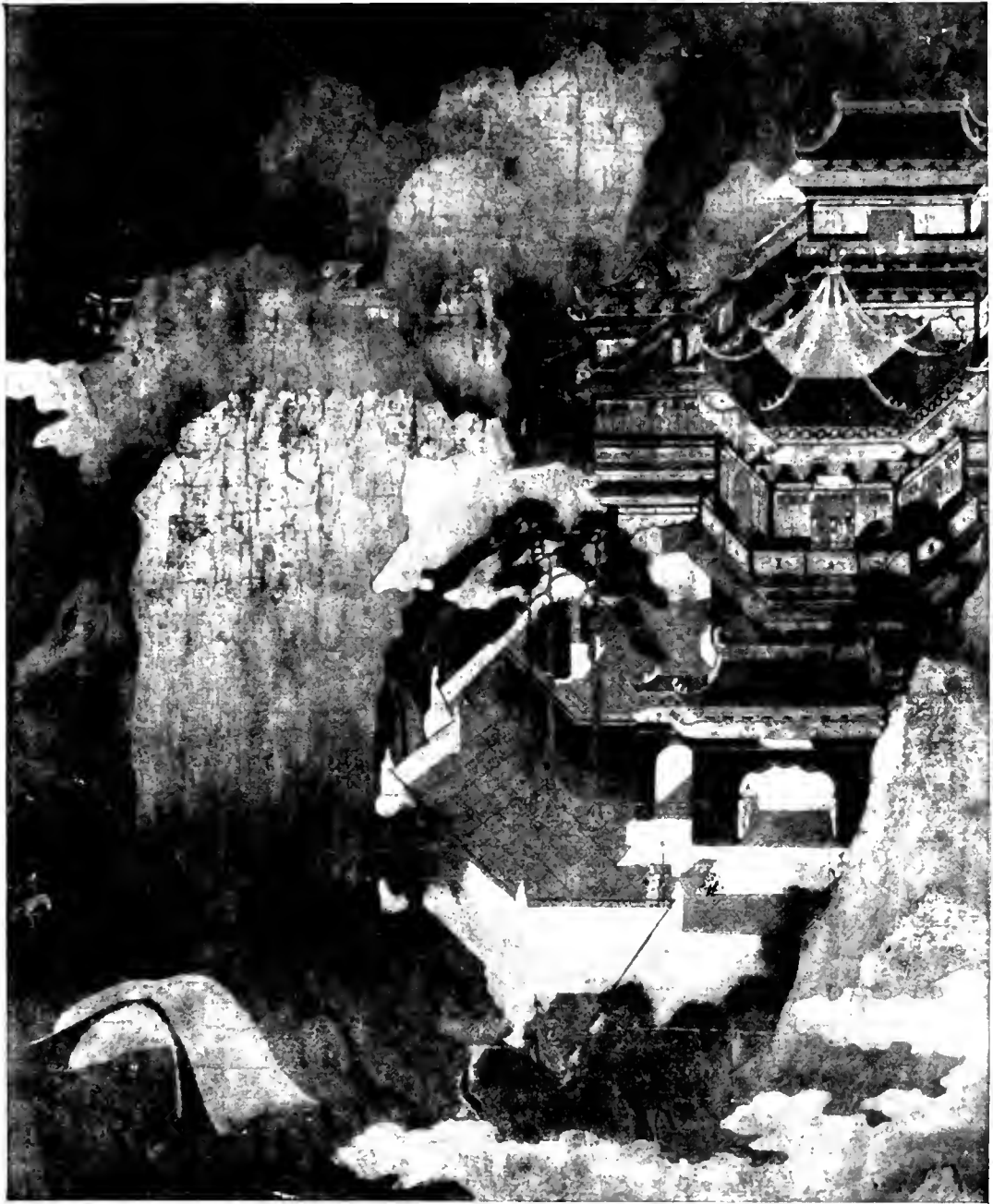
PLATE IV. PALACE OF KIU CHENG-KUNG BY LI CHAO-TAO T'ang Period. Collection of V. Goloubew.