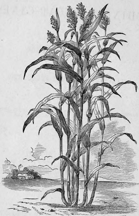
THE CHINESE SUGAR-CANE.