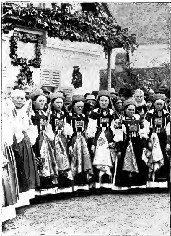
Girls and women of Toroczko.