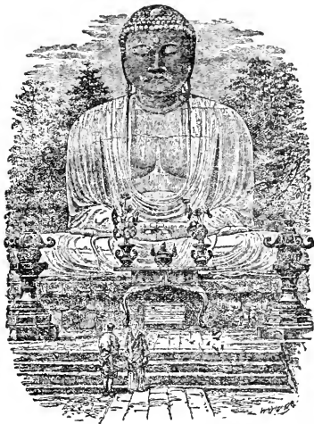
GIGANTIC JAPANESE IMAGE OF BUDDHA