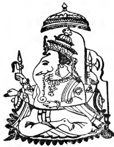
GANESA, THE ELEPHANT GOD.