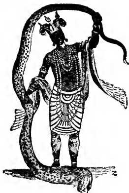
KRISHNA AND THE SNAKE.