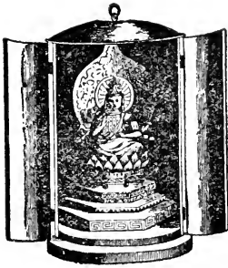
SHRINE OF KWANON.