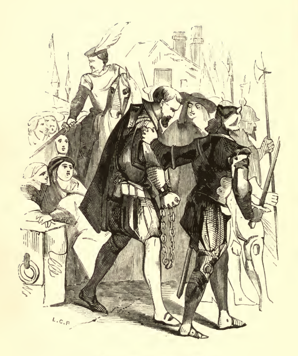
Columbus Returns in Chains.-Page 159.