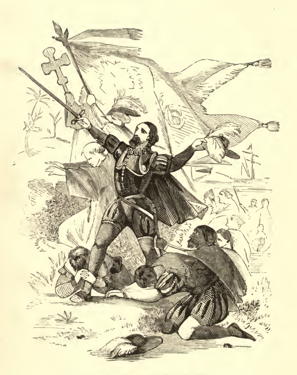
The Landing in the New World.