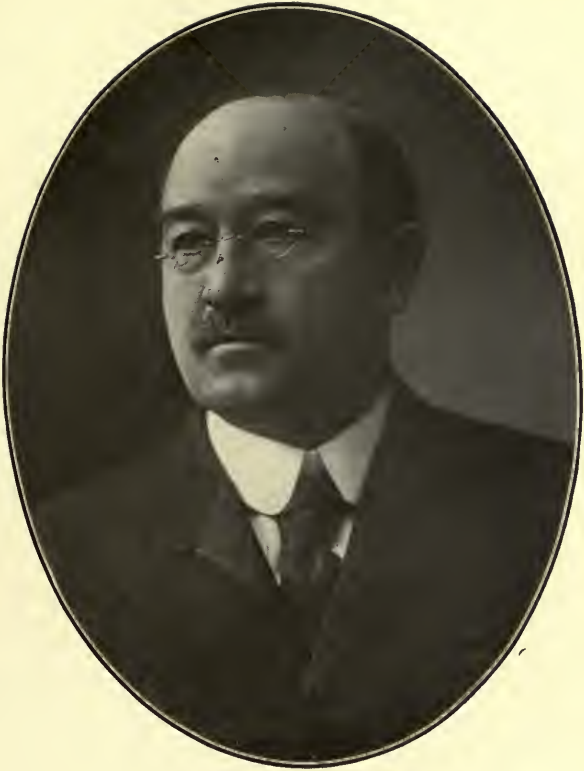
William T. Haines