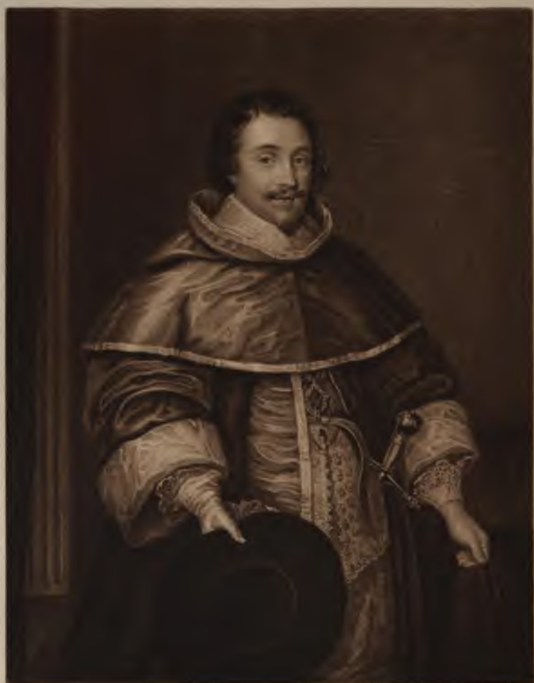
Ralph, Lord Hopton.