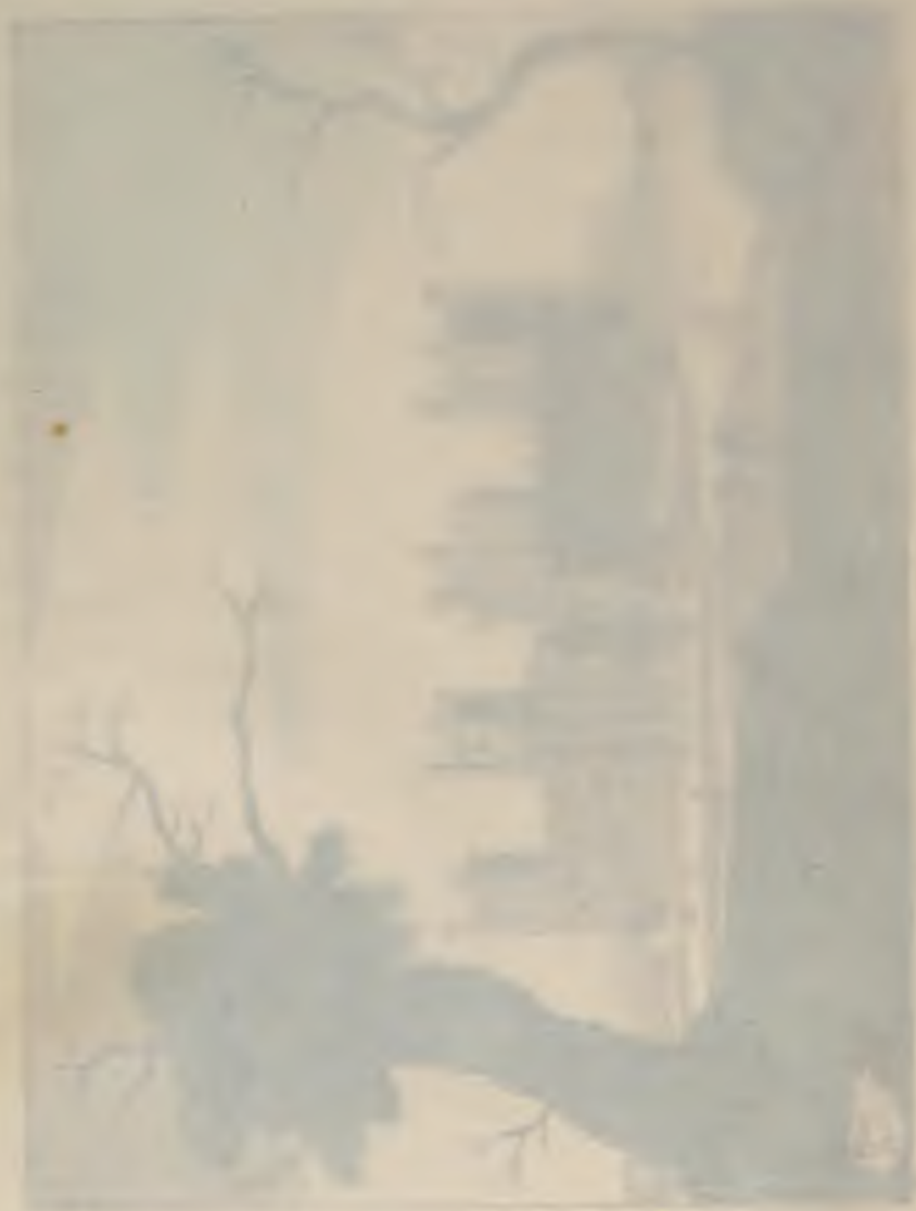
THE HOUSE OF THE FUTURE

THE HOUSE OF THE FUTURE is a vision of the future of the human race. It is a vision of a world in which the human race has reached the highest stage of its development. It is a vision of a world in which the human race has achieved the highest degree of unity and harmony. It is a vision of a world in which the human race has reached the highest stage of its development. It is a vision of a world in which the human race has achieved the highest degree of unity and harmony.