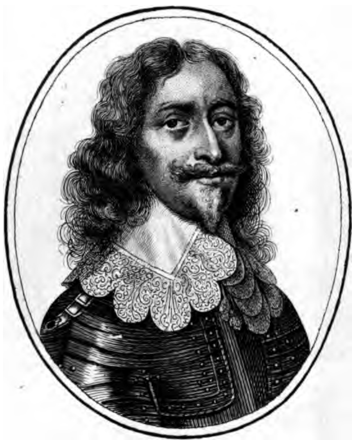
Sir William Waller From an Original by Corn. Janssen.