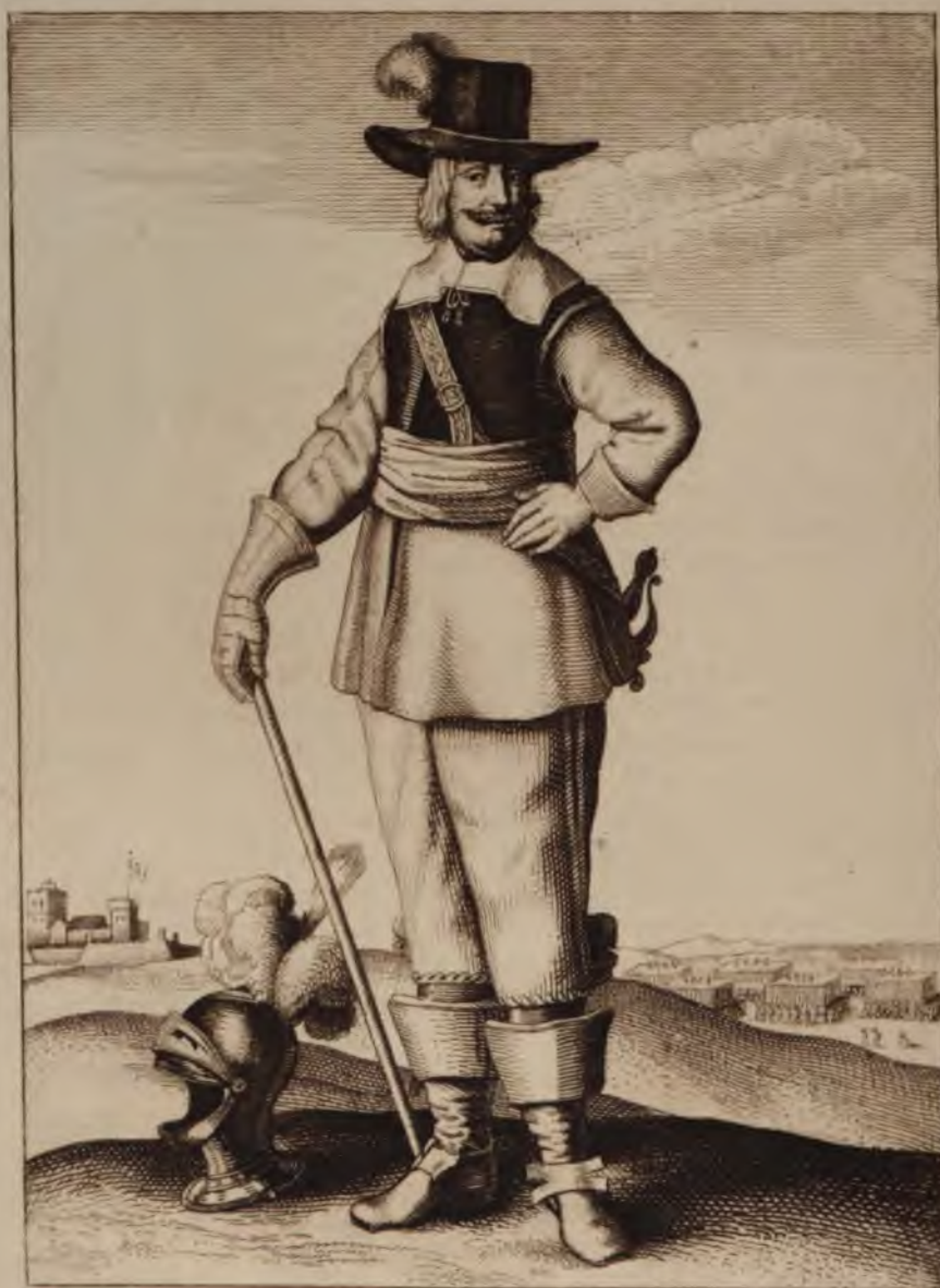
ROBERT DEVEREUX EARLE OF ESSEX HIS EXCEL Lucy & Generall of y e Army