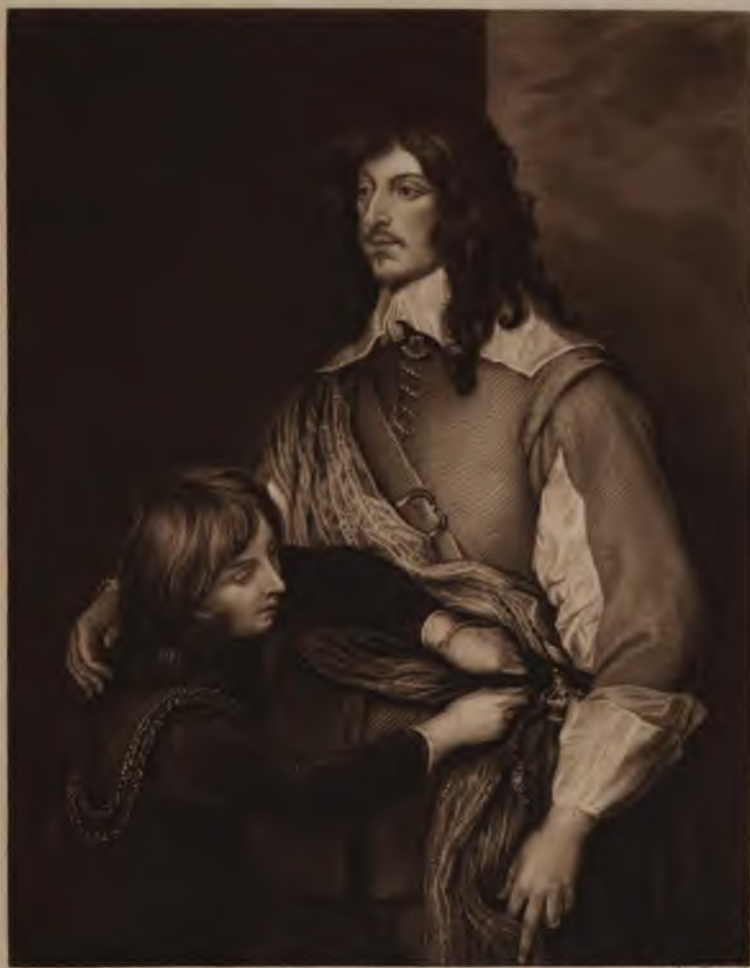
George, Lord Goring.