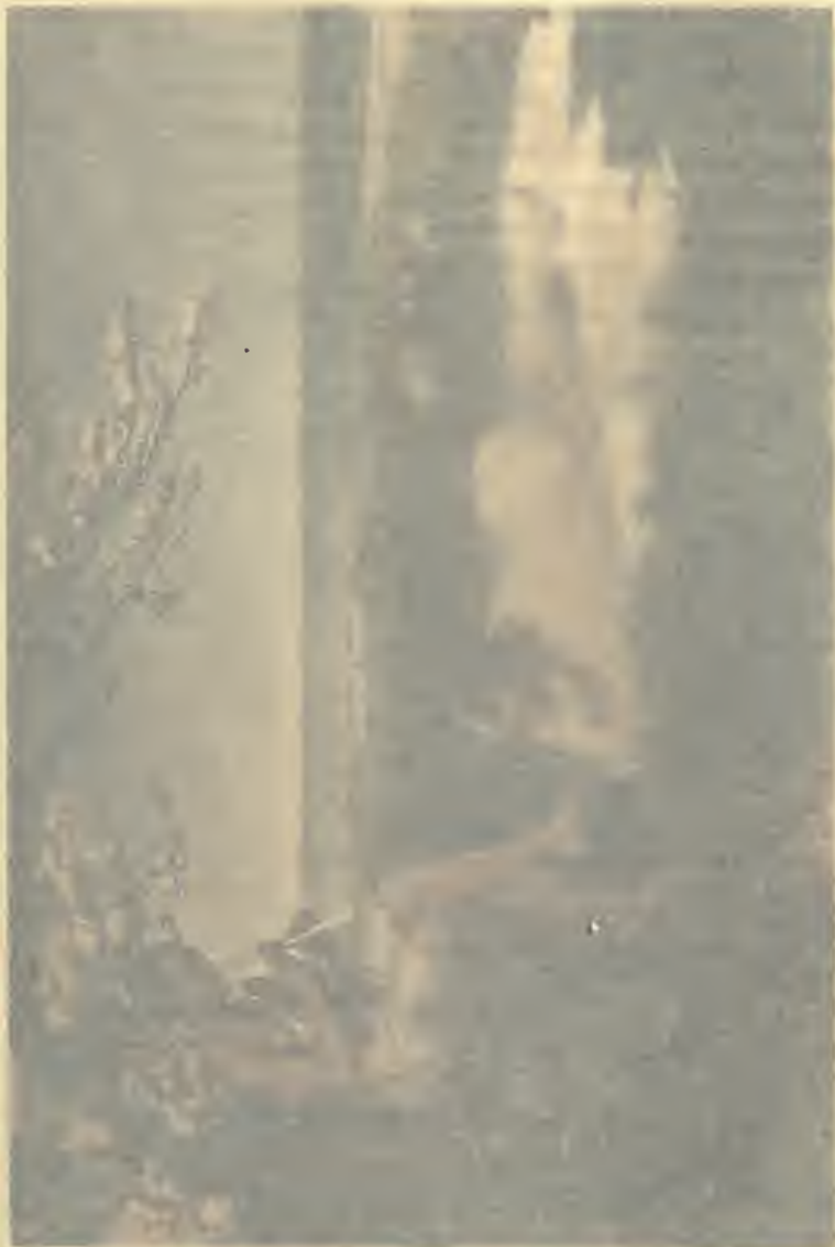
SPRING SONG OF THE SHEPHERD