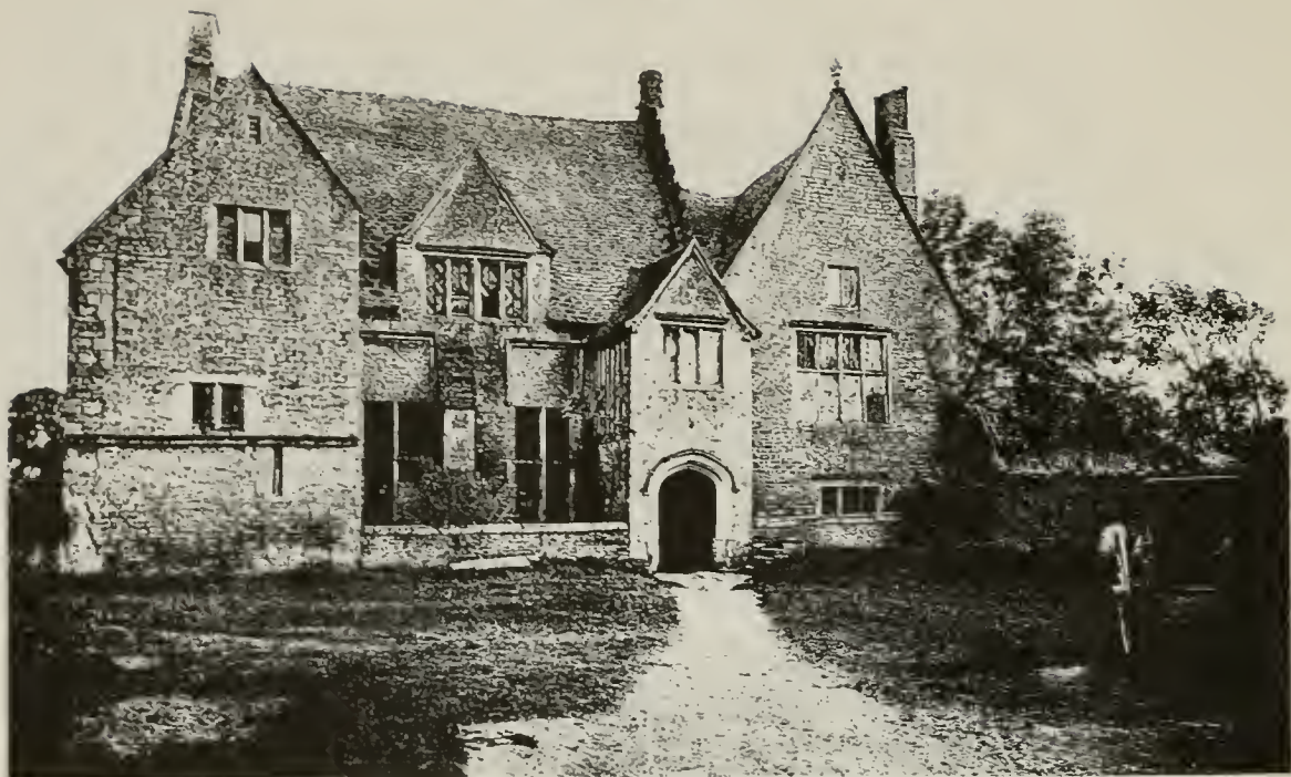
ANCESTRAL HOME, NORTHBOROUGH, ENGLAND PURCHASED BY JAMES CLAYPOLE, ESQ., 1572 FOR L5,000

CLAYPOLE MANOR, ANCESTRAL HOME OF THE CLAYPOOLES, is located about 85 miles North of London, just North of Peterborough, Northampton Co., England. "The remains of the manor-house, built by Geoffrey de la Mare 1340, consist chiefly of the ground-floor of the gatehouse and the hall of the house; the hall is now much subdivided, but at the west end three original doorways, with ogee-arched heads enriched with crockets and the ball-flower ornament, remain. It still retains its original crocketed gable, culminating in an octagonal chimney at the west end, and a cornice embellished with the ball-flower. It was here that Cromwell's widow died, as also did Mrs. Cleypole, his favorite daughter, who was buried in Henry VII's chapel at Westminster Abbey. (Cassell's Gazetteer of Great Britain and Ireland, 1897, Vol. N-S, p. 36)