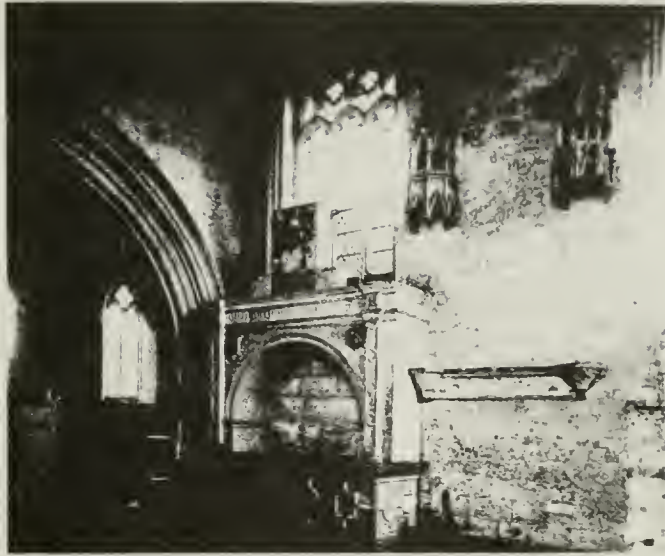
TOMB OF JAMES CLAYPOLE, ESQ. (d. 1599)