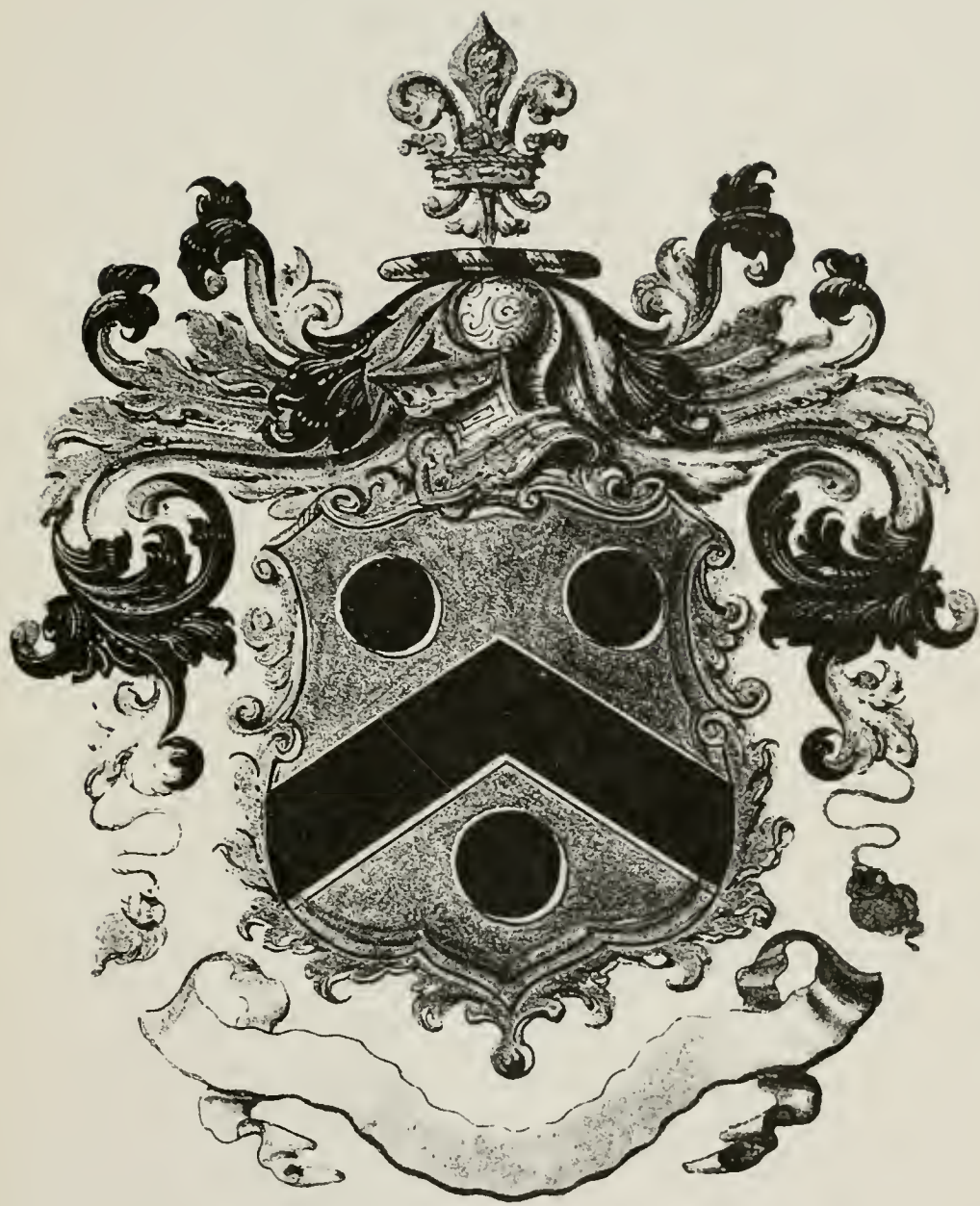
CLAYPOOLE COAT OF ARMS.