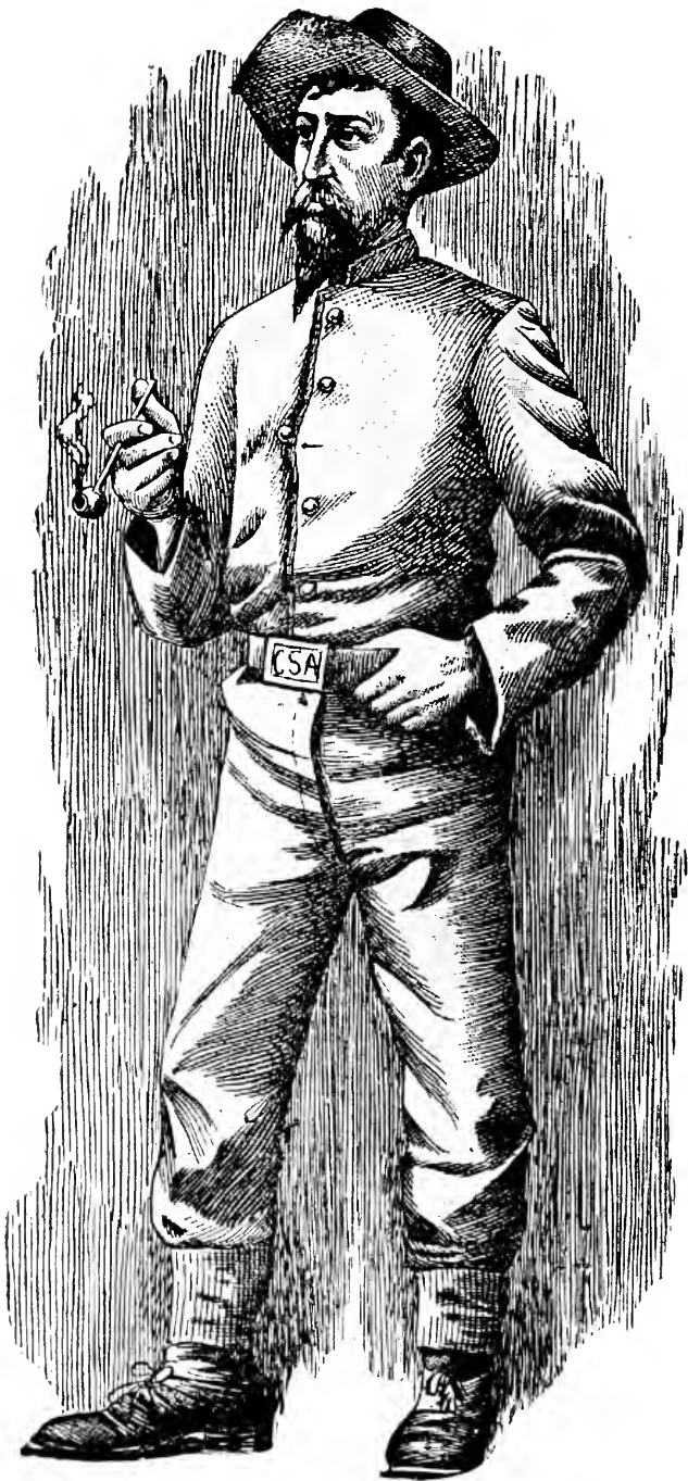
A TYPICAL CONFEDERATE SOLDIER.