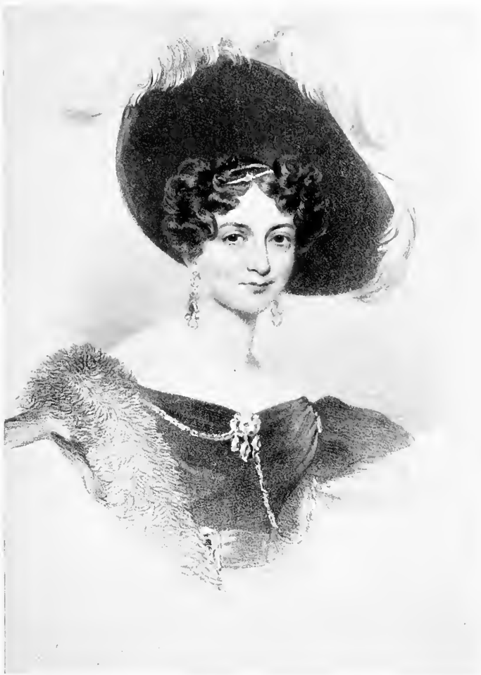
THE DUCHESS OF KENT.