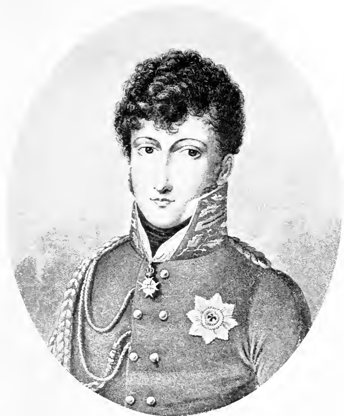
ERNEST I., DUKE OF SAXE-COBURG-GOTHA.