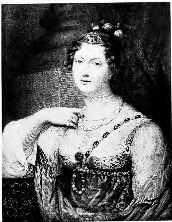
PRINCESS CHARLOTTE AUGUSTA.