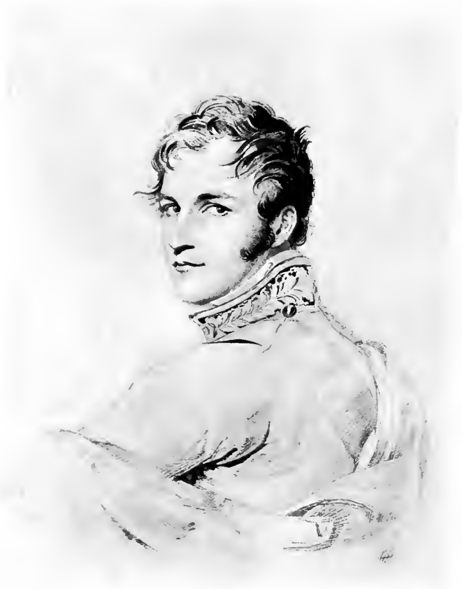
Prince Leopold of Saxe-Coburg