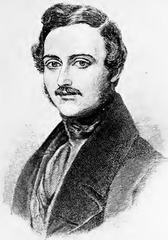
PRINCE ALBERT. After W. C. Ross, A.R.A.