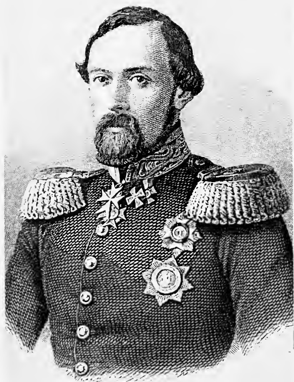
ERNEST II., DUKE OF SAXE-COBURG-GOTHA.