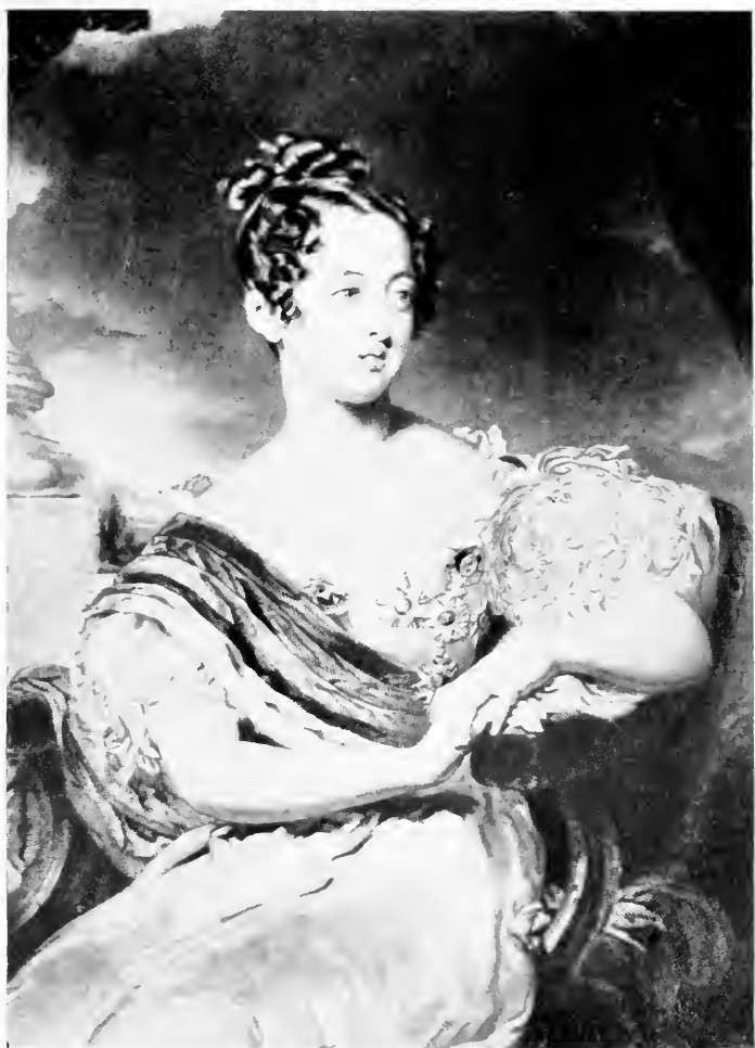
MARIE II. DA GLORIA, QUEEN OF PORTUGAL.