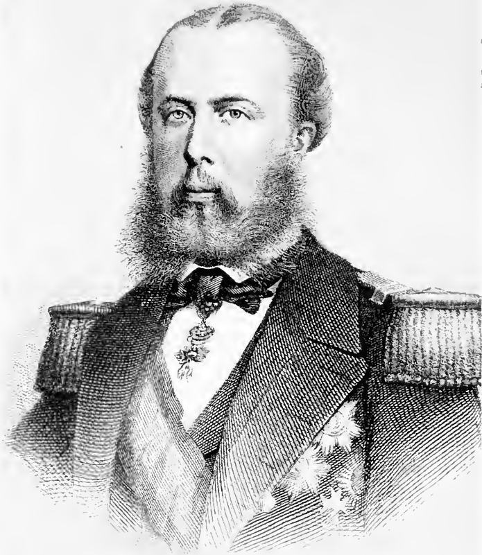
MAXIMILIAN, EMPEROR OF MEXICO.