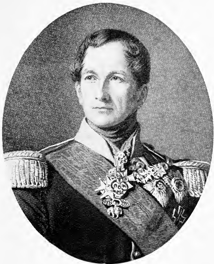
LEOPOLD I., KING OF THE BELGIANS.