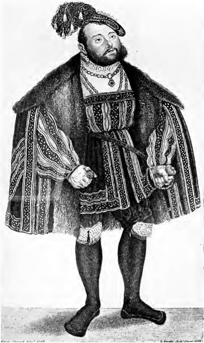
FREDERICK THE MAGNANIMOUS, ELECTOR OF SAXONY.