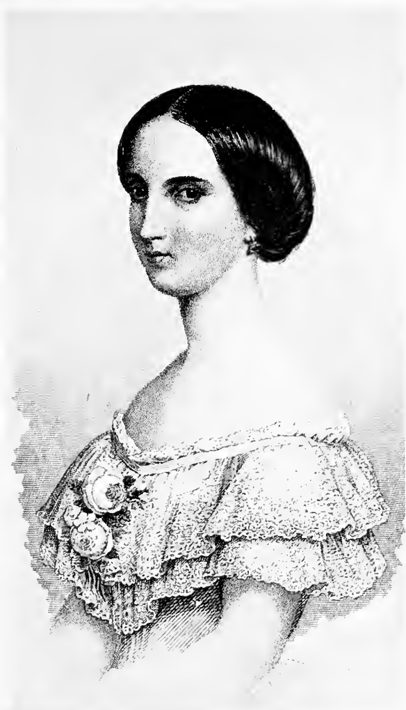
CHARLOTTE, EMPRESS OF MEXICO.