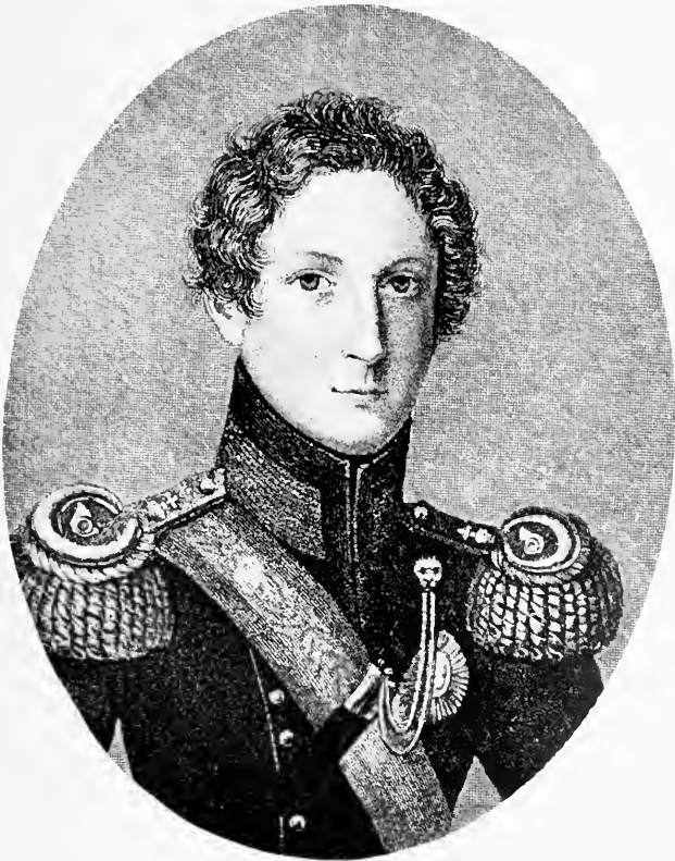
FERDINAND, KING-CONSORT OF PORTUGAL, AGED TWENTY-ONE.