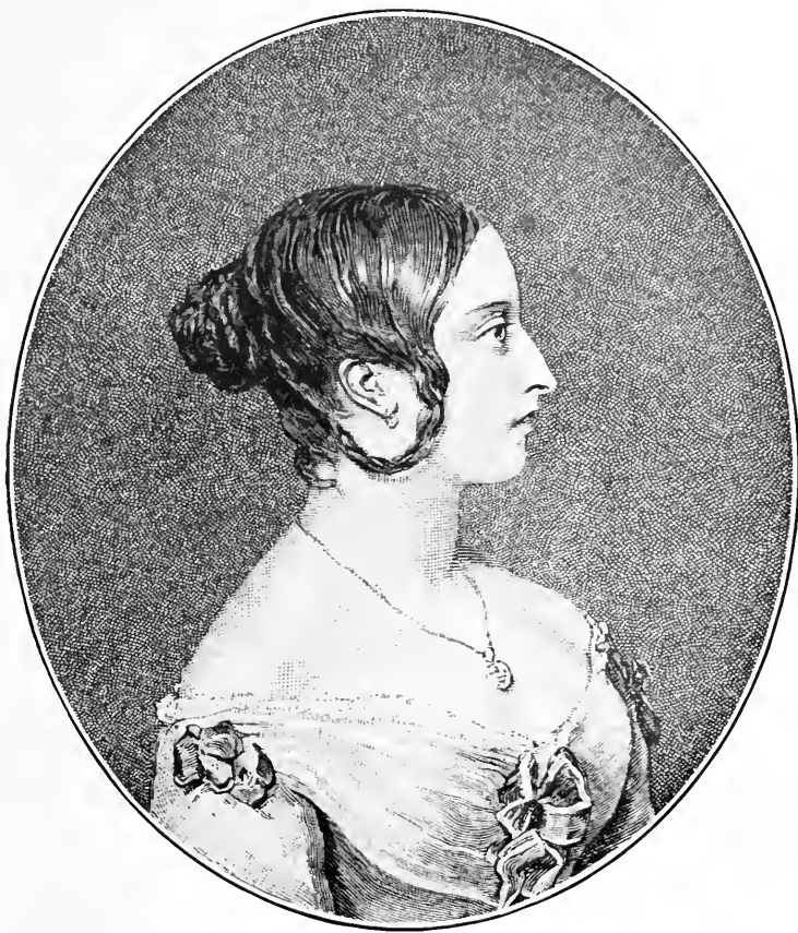
QUEEN VICTORIA. After W. C. Ross, A.R.A.