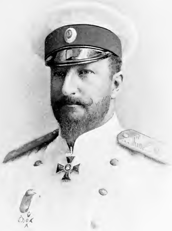
FERDINAND, TSAR OF BULGARIA.