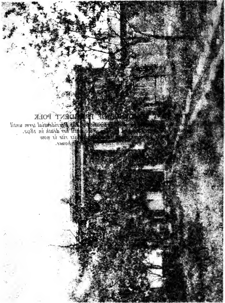
RESIDENCE OF PRESIDENT POLK The residence of President Polk was built in 1802. It is now a ruin.