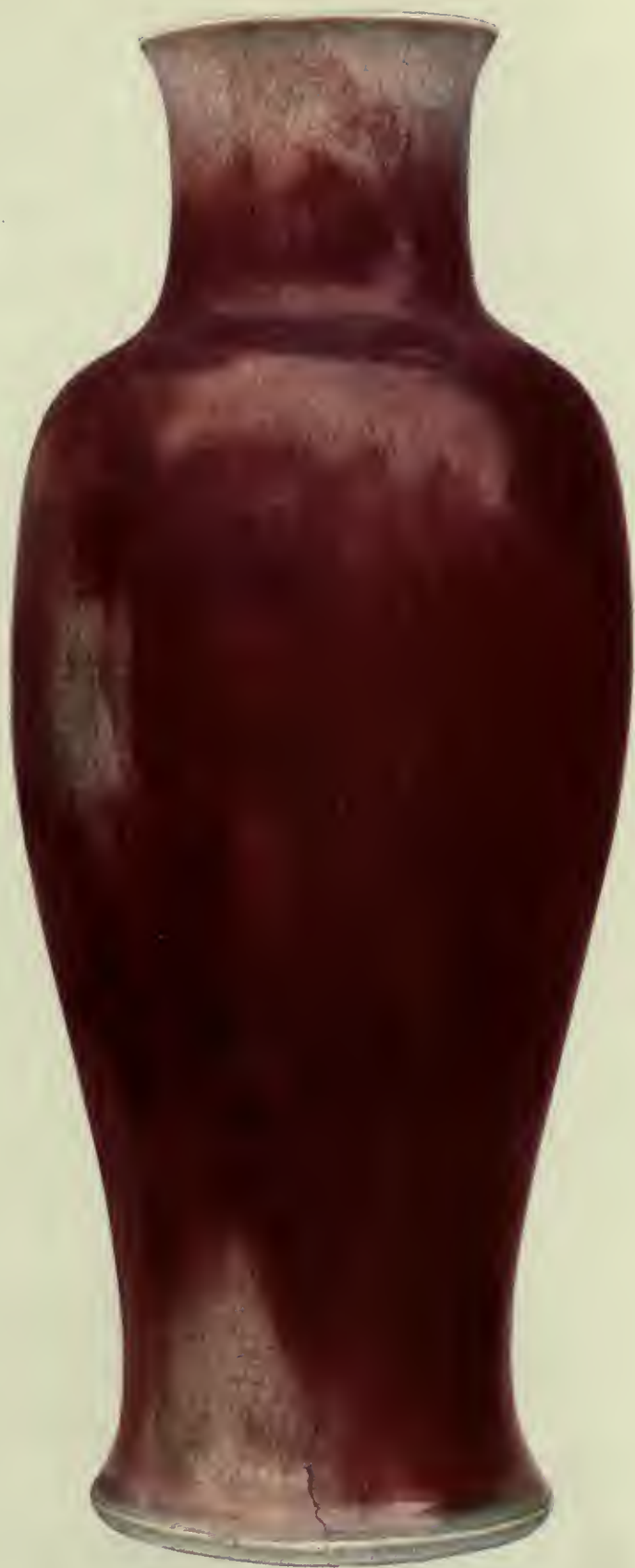
PLATE 10 GLASSWARE