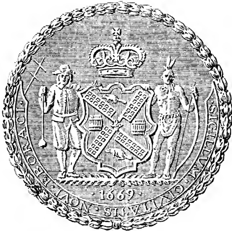
Seal of New York 1669

The index of names will illustrate the rules and statements given here.