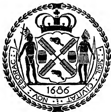
Seal of New York 1686

Six pence would procure meat, bread and drink. Such have been the opportunities of earning money by different kinds of labor that none willing to work were in want. Hence there are few beggars, but a few lazy, drunken wretches, not even fit objects for the almshouse.