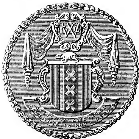
Seal of Nieuw Amsterdam