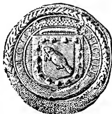
Province Seal of Nieuw Netherland