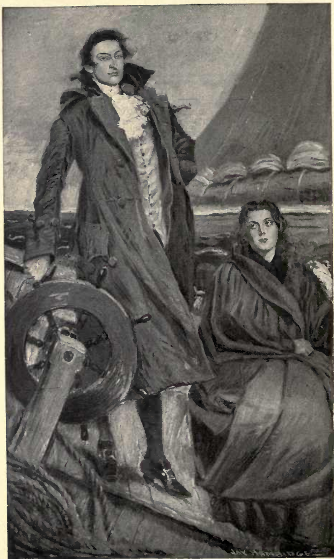
The wind had blown back the hood from her shoulders.