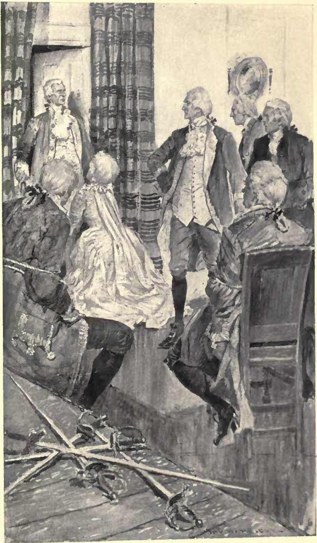
Sinking at his feet, exclaimed, " My child forgive me!"