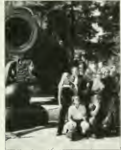
In between performances, some students from the Southern Singers touring group take time to catch this attraction in the Kremlin. The canon was never actually used because it could not effectively fire the enormous cannonballs.

Choral groups, the symphony orchestra, and concert