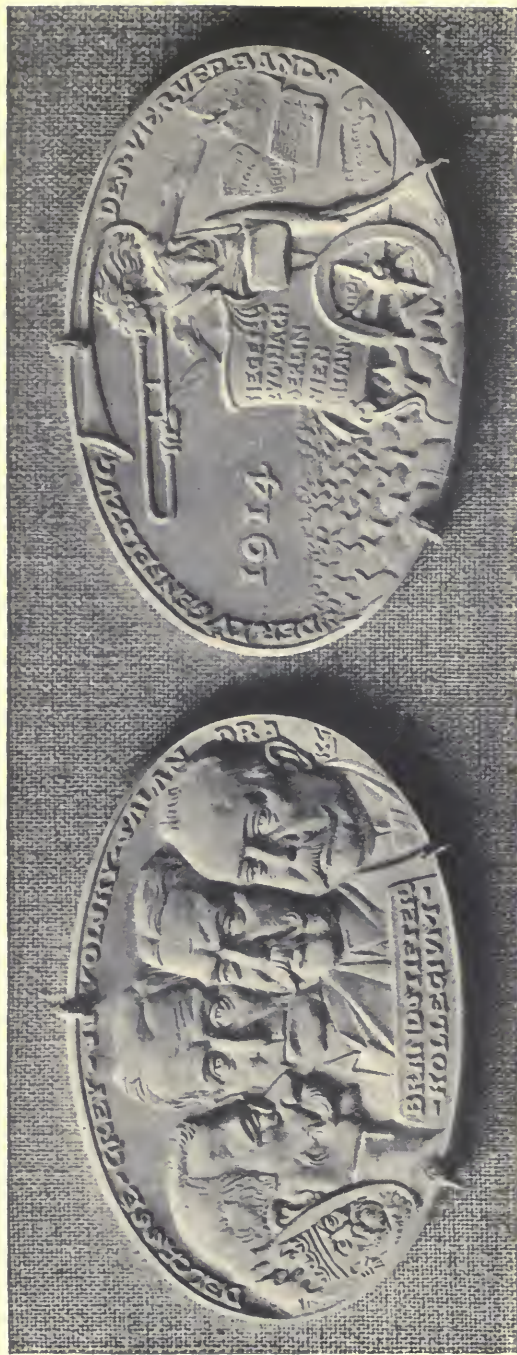
Fig. 8. THE FOREIGN MINISTERS OF THE ENTENTE. By K. GÖTZ.

On the obverse are the heads of M. Delcassé, Sir Edward Grey, M. Iswolsky, and Signor Salandra. Sir Edward Grey is embracing M. Delcassé and holding a medallion of King Edward VII. Below is the inscription: "The Cabal of Incendiaries." On the reverse is an allegorical representation of the "Quadruple Alliance's Campaign of Lies": A figure of Rumour blowing a trumpet is riding in a chariot inscribed "Triumphal Train to Berlin, Vienna, Constantinople," the wheels of which are being broken on the spiked helmets of the German Army. Rumour is scattering broad-sheets with the words: "Revolution in Berlin!" "Germany at the Point of Starvation!" "The Cathedral of Rheims in Ruins!" and "The End of the Barbarians."