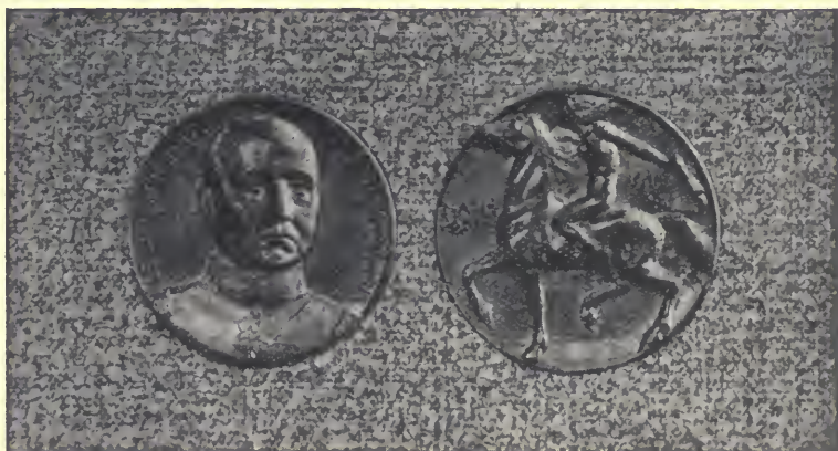
Fig. 10. "TO PARIS—1914."