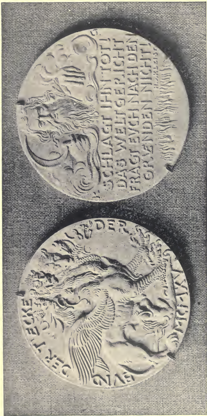
Fig. 7. THE ALLIED POWERS. By K. GÖTZ.

On the obverse is a chimera-like monster representing the "Alliance of Crafty Spite of 1915." Of the various heads the Cock stands for France, the Lions for Belgium and England, the Bear for Russia, the Ape for Japan. Below is Italy as a naked child, drawing what profit it can from the situation.