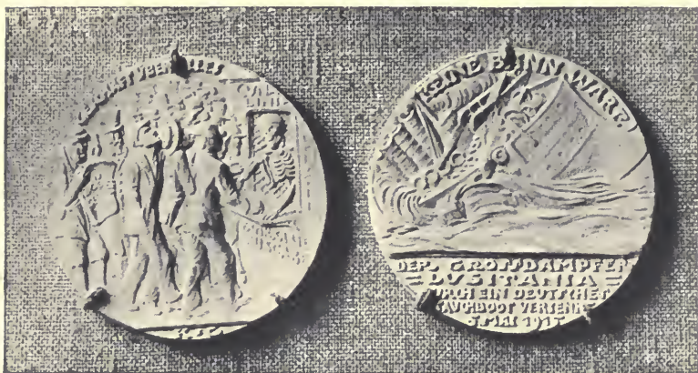
Fig. 11. THE SINKING OF THE LUSITANIA .

enemy. Such are the medals satirising the "Crafty Spite" of the Entente (Fig. 7); the "Campaign of Lies" conducted by the "Cabal of Incendiaries," our Foreign Ministers (Fig. 8); the Landing of the Indians at Marseilles (Fig. 14); the Wooing of the