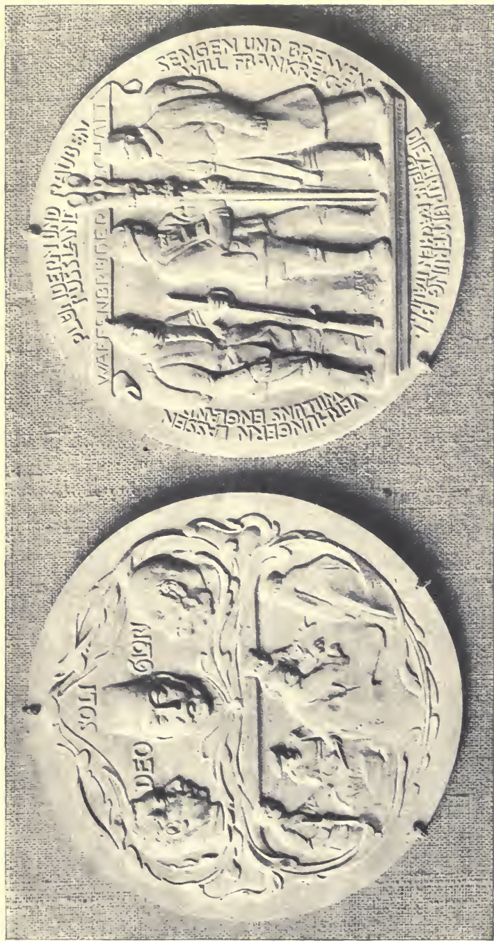
Fig. 1. THE NEW TRIPLE ALLIANCE. By Professor PAUL STURM.

On the obverse are the heads of the German Emperor, the Sultan of Turkey, and the late Emperor of Austria, with the words: "Soli Deo Gloria" (To God alone the Glory). Below is a group of officers consulting a war map. On the reverse are three soldiers, one with a rifle and the other two with a range-finder; above their heads a scroll with the words: "Brothers in Arms." The inscription round the edge runs: "England wishes to starve us out, Russia to plunder and rob us, France to lay our land waste with fire, and Italy to avenge the ruin of Belgium."