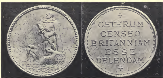
Fig. 9. A BISMARCK MEDAL.

mind of the German people. For the benefit of its readers, the German periodical adds: "The piece referred to is one of the satirical medals cast by Karl Götz at Munich, flagellating the levity of mind of the Cunard Line."* A curious point remains to be noted in this connexion. The attack on the Lusitania ,