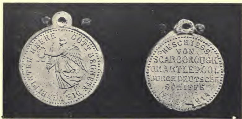
Fig. 4. A GERMAN "VICTORY-PENNY" ( enlarged ).

von Kluck, Field-Marshal von Mackensen, or—in the other elements—of Vice-Admiral von Spee and Grand-Admiral von Tirpitz and Count Zeppelin; but we have portraits of heroes of more modest rank, such as von Mücke (whose escape in a sailing vessel from Keeling Island to Hodeida must be almost forgotten