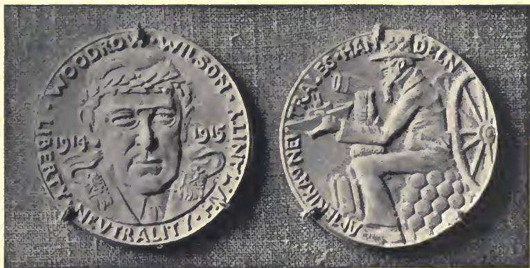
Fig. 17. AMERICAN NEUTRALITY.

regular mania throughout Germany for driving in nails. Protests on the part of the Berlin Academy of Arts and various professors have entirely failed to discourage the practice, which from the æsthetic standpoint cannot be too heartily condemned, and which argues a deplorable lack of sensibility in the public who indulge