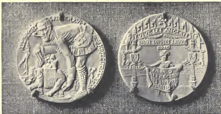
Fig. 14. THE LANDING OF THE INDIANS AT MARSEILLES.