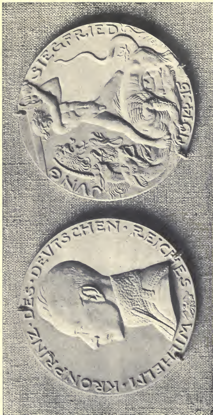
Fig. 3. THE GERMAN CROWN PRINCE By K. GÖTZ.

On the obverse is the portrait of "William, Crown Prince of the German Empire."