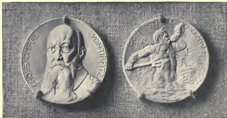
Fig. 6. GRAND-ADMIRAL VON TIRPITZ.

A critic is always able to detect unconscious humour in the works of an artist with whose intellectual and