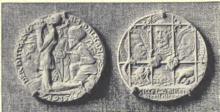
Fig. 15. THE WOOING OF THE BALKAN KINGS.

On the reverse is a triumphal arch erected by the French Republic, and an Indian carrying a poster running underneath it. The inscriptions (in French) run: "Long live the English! We are safe! Tremendous attraction—the Indians at Marseilles!" (It will be noted that, in the twelve French words of these inscriptions, there are five mistakes.)