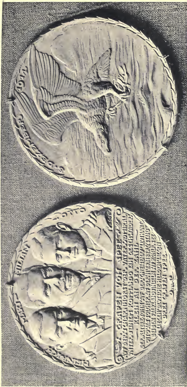
Fig. 13. THE THREE COUNTS VON SPEE.

On the obverse are the heads of Count Maximilian von Spee and his two sons, Heinrich and Otto. Below is a rhyming doggerel: