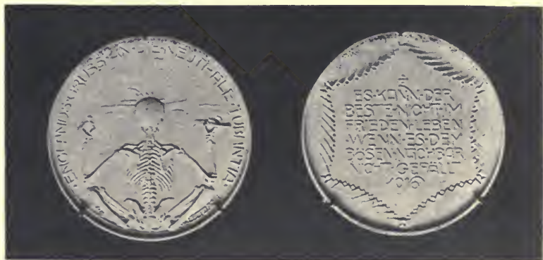
Fig. 12. THE TORPEDOING OF THE TUBANTIA .

the medal in this series (Fig. 12) which satirises "England's Greeting to the Neutral Tubantia ," and represents Death discharging, on England's behalf, a torpedo at the unfortunate Dutch vessel, was issued before or after it was definitely proved that the torpedo in question was a German one. Nor does it