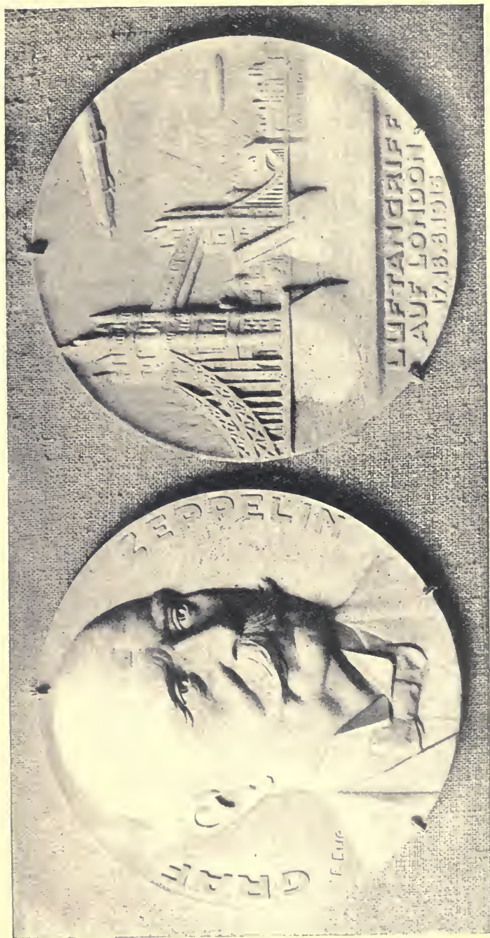
Fig. 2. A ZEPPELIN RAID ON LONDON. By F. EUE.

On the obverse is a portrait of Count Zeppelin.