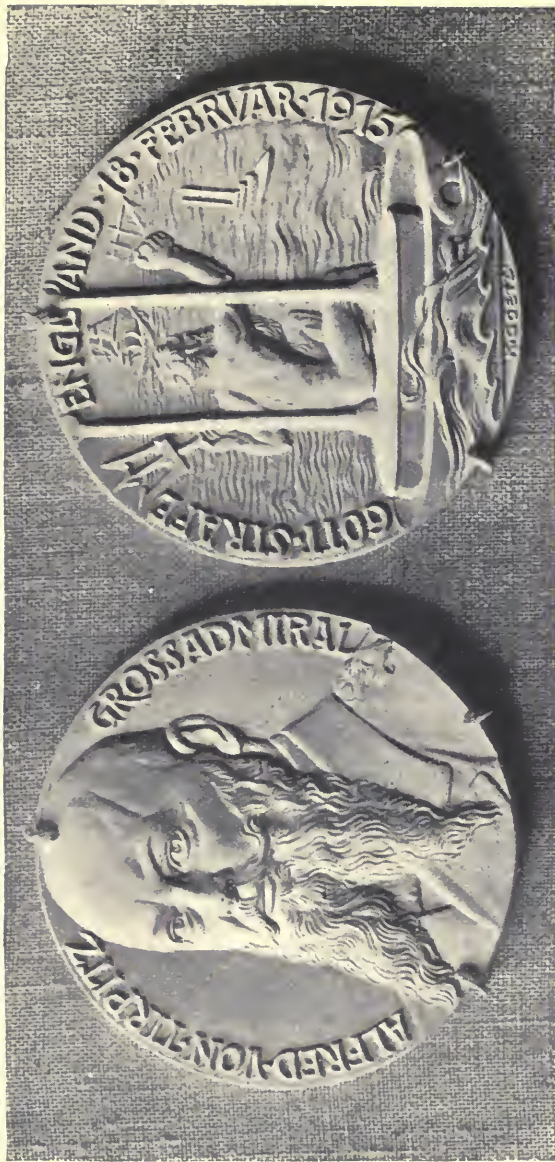
Fig. 5. GRAND-ADMIRAL VON TIRPITZ. By K. GÖTZ.

On the obverse is a portrait of Grand-Admiral von Tirpitz.