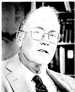
Charles H. Townes Nobel Laureate