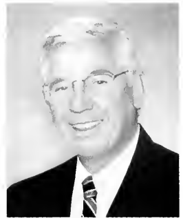
The Hon. Parris N. Glendening Governor, State of Maryland

Glendening has been a strong and passionate voice on issues of social justice. As governor, he has championed laws to protect people from all forms of bigotry and has worked hard to bring opportunity to every Maryland resident by embracing greater justice, fairness and inclusion.