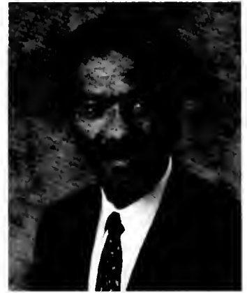
Franklin D. Raines

Mr. Raines graduated magna cum laude with a B.A. degree from Harvard College. He received his J.D. degree cum laude from Harvard Law School and also attended Magdalen College, Oxford University as a Rhodes Scholar.